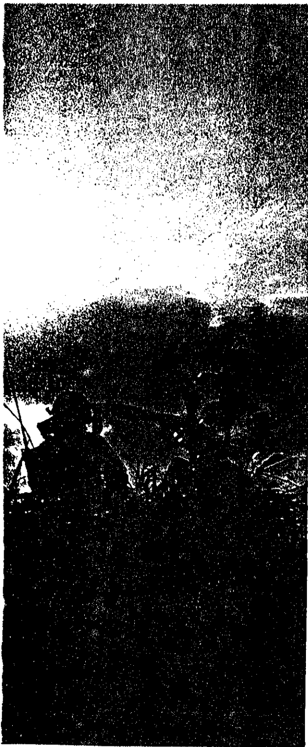
Armor and air support