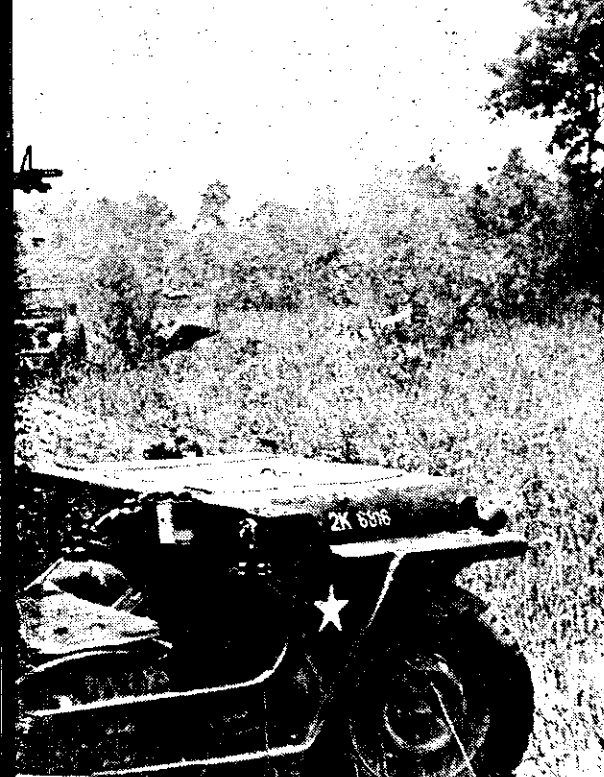
Bishop, Calif., feeds the M-60 as Specialist 4