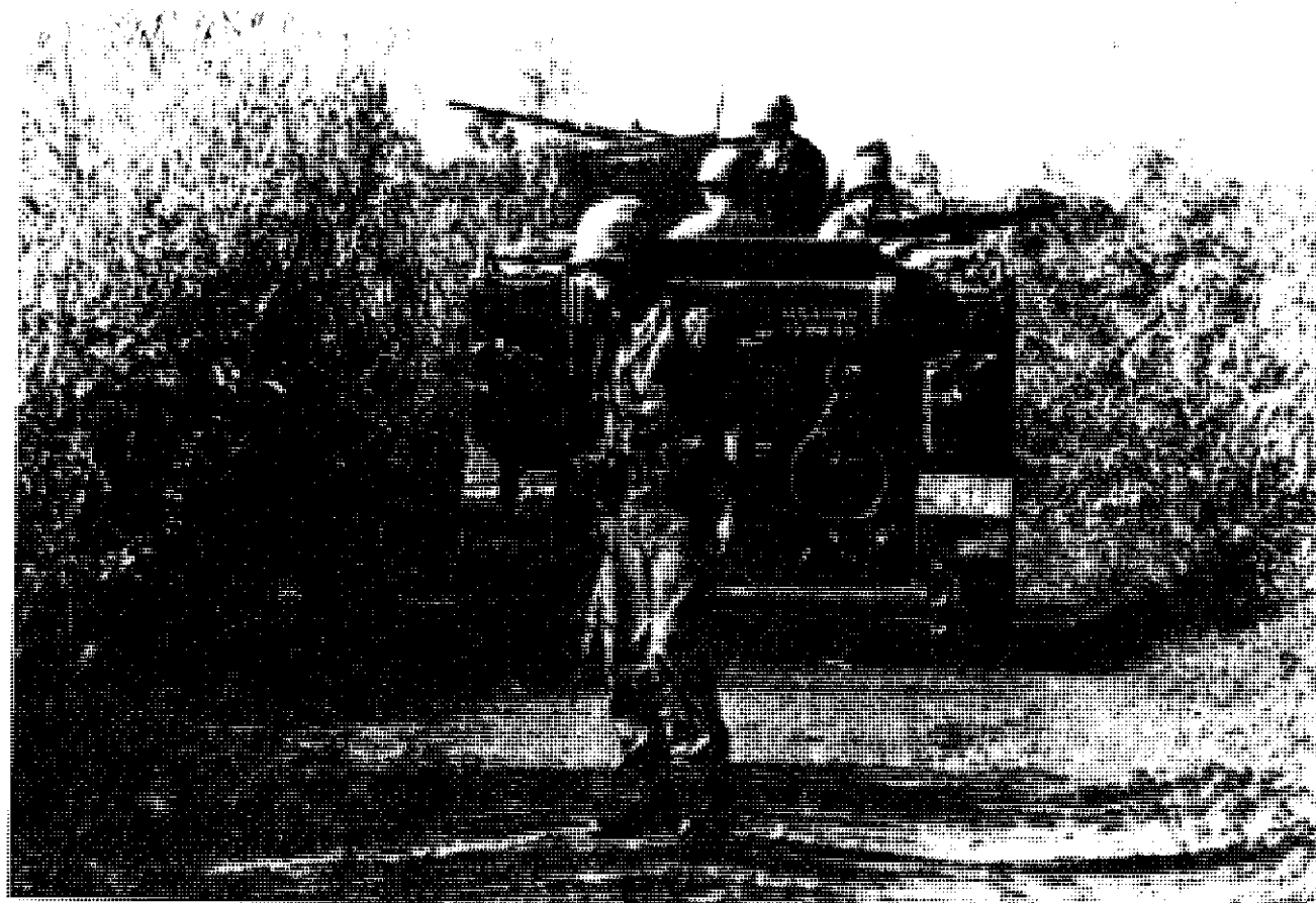
The M113 APC is the backbone of Armor in Vietnam for one simple reason—it can move!

Light tanks suffer the same limitations as mediums, but being lighter and narrower they are able to make better use of existing bridges. This allows them access to larger and more widespread operational areas and increases their opportunities to engage VC. The 76mm gun of the M41A3 is no less deadly than the M48's 90mm against troops and field fortifications and, surprisingly, the M41 stands up every bit as well as