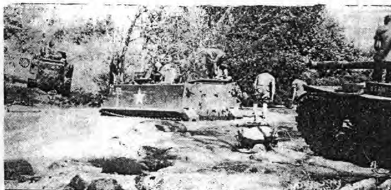
NOW WHAT THE HECK? — When an armored personnel carrier breaks down it can become frustrating. Members of the Ivy Division's Troop B, dismount, roll up their pants and begin looking for the source of the trouble.