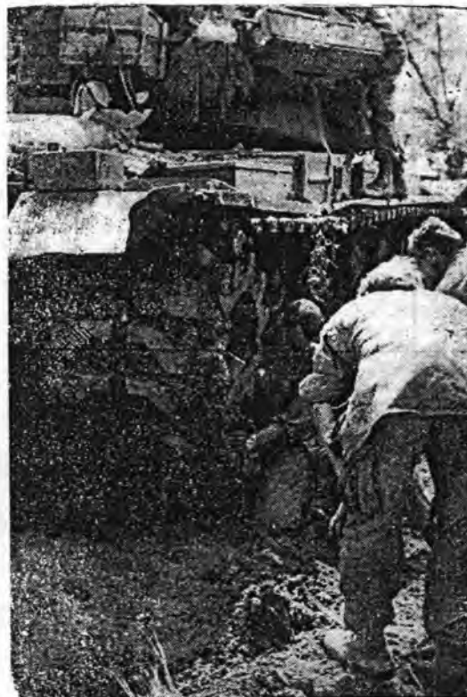
SLIDING A SLIPPED SECTION — What do members of the Ivy Division's Troop B do when they slip a section of track? They simply slide it back on. This is quite a trick when you consider the section is slipped from a monster of a tank which weighs 10 tons or more.