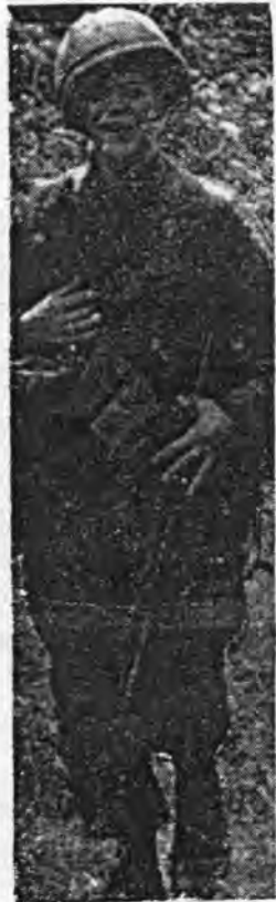
WALKING ALONG — A member of Company B, 1st Battalion, 35th Infantry smirks as he thinks private thoughts during another hard day of patrolling.