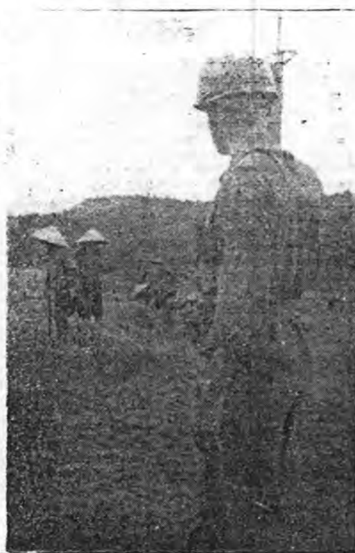
RICE GUARD —A lone "Brave" from the 3rd Battalion, 12th Infantry watches over one of the many rice fields guarded by Iuymen during the rice harvest protection phases of Operation Adams. The infantrymen secured the fields while refugees in Tuy An District came in and picked the grains.

They'll always remember the fighting they did up and down the hills of Phu Yen. They'll always remember the monsoon...when their greatest pleasure was simply a pair of dry socks.