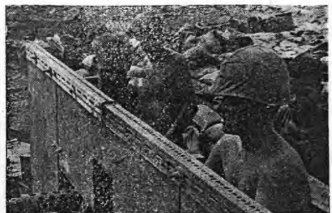
PROTECTION — The men of Battery D, 71st Artillery run crew drills while attached to the 2nd Battalion, 77th Artillery at Prek Klok. The big quad-fifty caliber machine guns provide protection for the battalion's big guns.