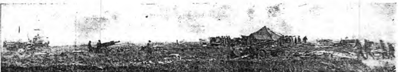
BATTLEFIELD — The howitzers of the 2nd Battalion, 77th Artillery continue to pound the enemy during the Battle of Suoi Tre while a dustoff waits for an injured man.