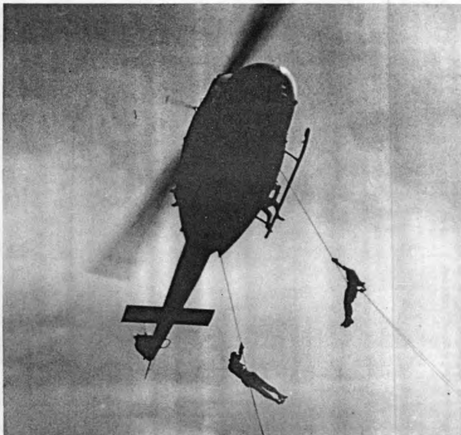
(Tay Ninh) 188th Assault Helicopter Company, "Black Widows," December 1967. 5th Special Forces Group, Team B-36 during operation "Rapid Fire."