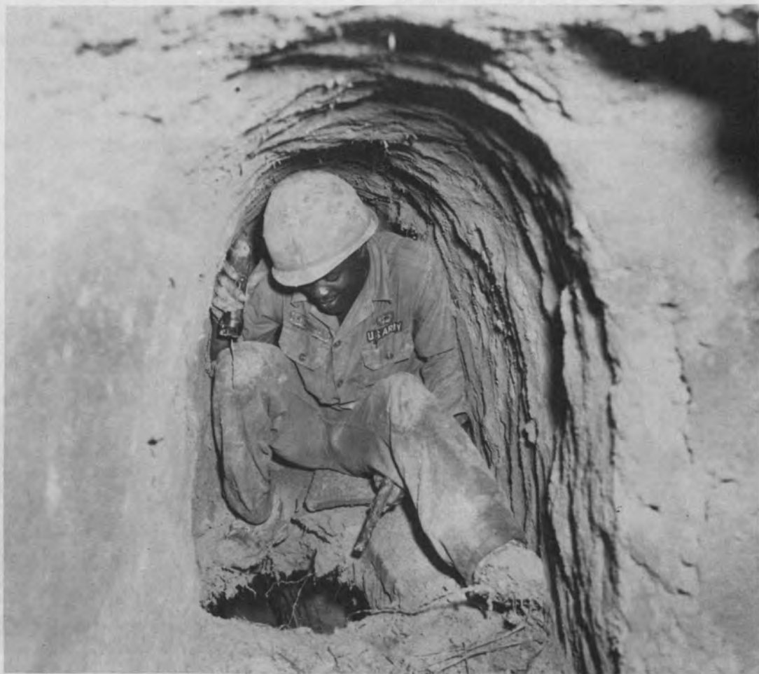
A "tunnel rat" at work in the sector of the 25th Infantry Division near Cu Chi, in the III Corps Zone, August 1966.