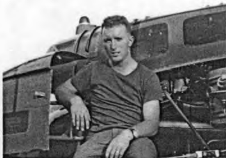
(Long Binh) 25th Aviation Co., 1st Aviation Br., 1967-68. This picture was taken on "Top Pad" in April of 1968. It looks like I was changing some filters...and had a long day of it. Most of the time I didn't even know what day it was. I think I had two or three days off the whole year. I really can't say it bothered me, I just did my job and I'm damn proud of it.