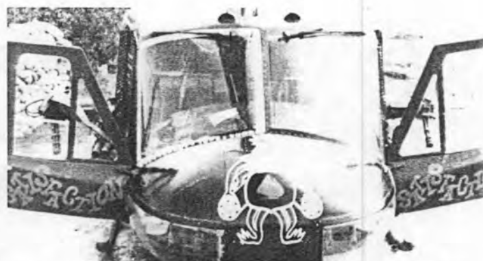
(Dau Tieng) 188th Assault Helicopter Company, "Black Widows," This is a photo of my gun ship, #179 the SATISFACTION, 3rd flight platoon at LZ Sally. We flew direct combat support for the 25th Inf. Div. Ship #179 was shot down twice while in-country...something I'll never forget.