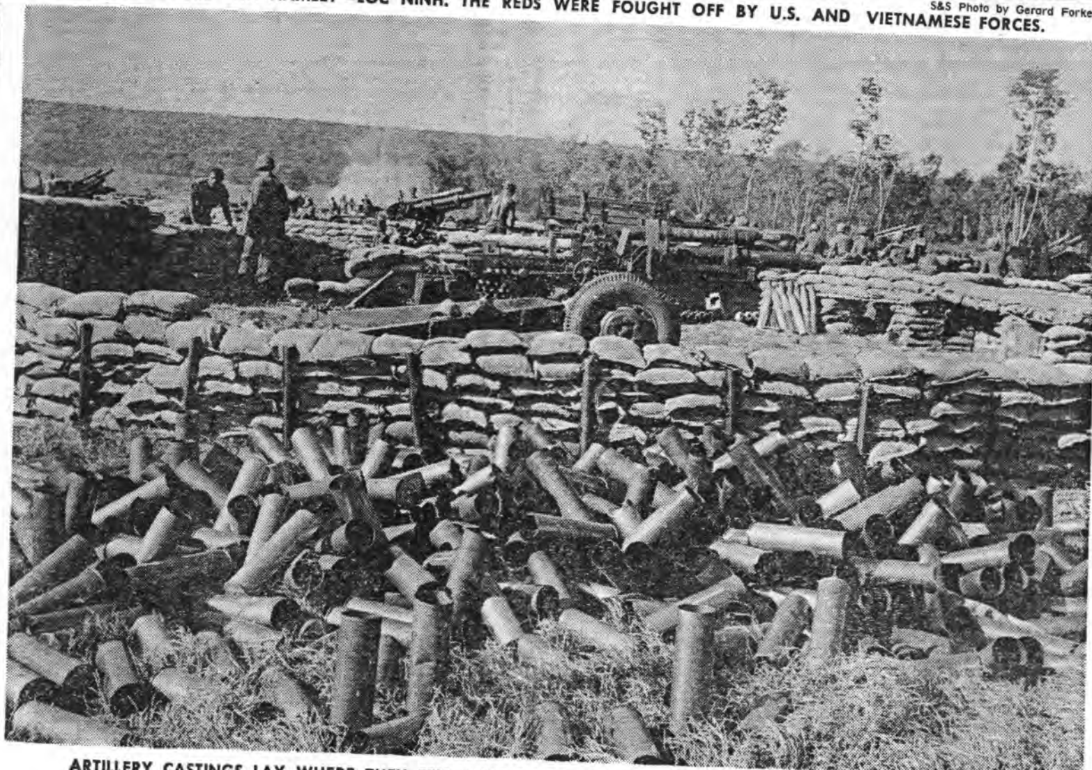
ARTILLERY CASTINGS LAY WHERE THEY FELL DURING BATTLE FOR LOC NINH, NEAR CAMBODIAN BORDER.