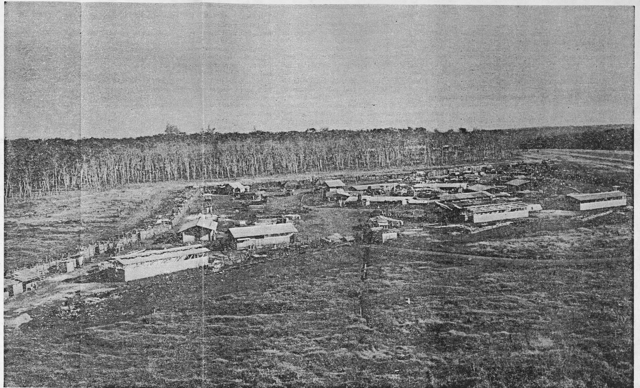
COMMUNIST FORCES LOST AT LEAST 923 MEN TRYING TO CAPTURE THIS HAMLET—LOC NINH. THE REDS WERE FOUGHT OFF BY U.S. AND VIETNAMESE FORCES.