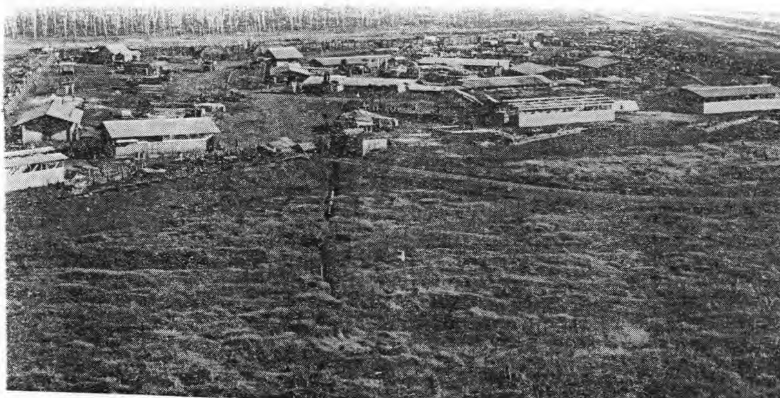
MEN TRYING TO CAPTURE THIS HAMLET—LOC NINH. THE REDS WERE FOUGHT OFF BY U.S. AND VIETNAMESE FORCES.