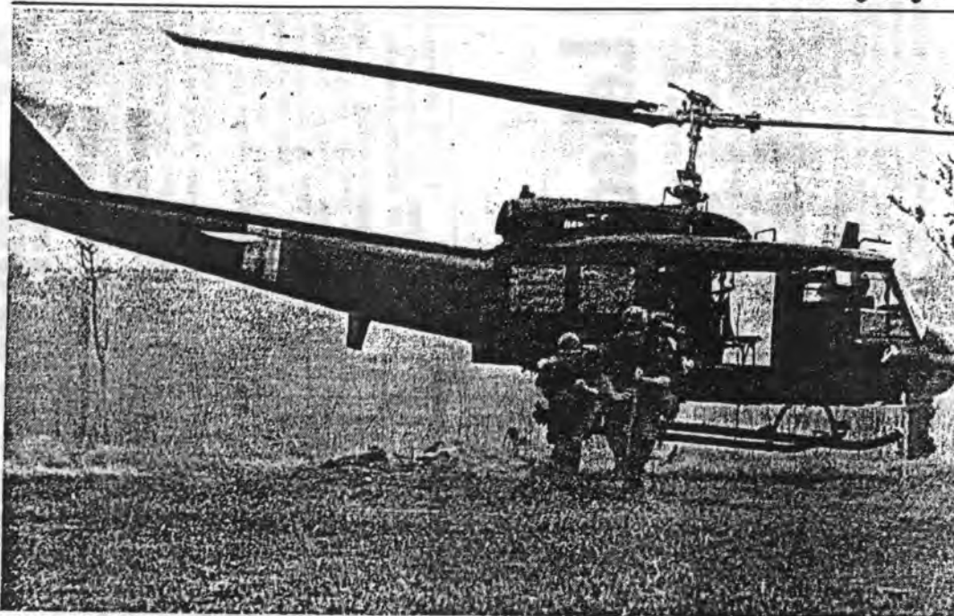
COLD LANDING ZONE —Air Cavalrymen from Co. B, 3rd Bn., 187th Inf. conduct a heliborne assault near Cu Chi in search of NVA supply bases and unit assembly points. The troopers hit the landing zone (LZ) unopposed before moving out on reconnaissance-in-force sweeps.