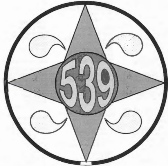
539th Transportation Detachment