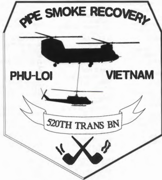
520th Transportation Battalion