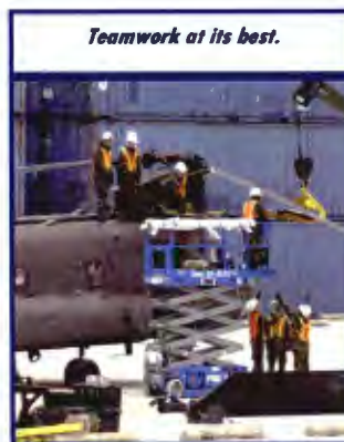
Teamwork at its best.