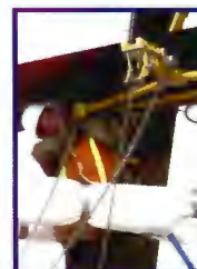
Our courage and pride give us strength.