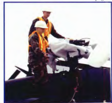
Soldiers from 8/101 AVN removing blades from aircraft.