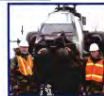
MG Petraeus and BG Sinclair visit the soldiers.