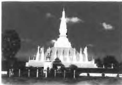
Pha That Luang Shrine Symbol of a Nation