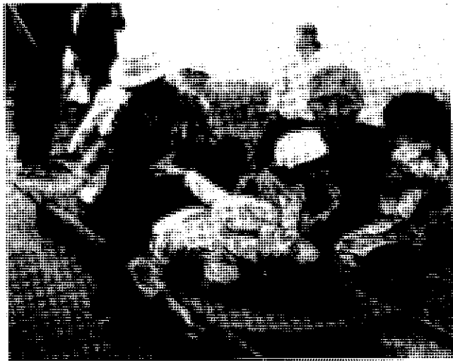
This South Vietnamese woman and her wounded daughter huddled alongside are given first aid after the bus they were traveling in was blasted in Kien Tuong Province on May 3, 1964, by a Viet-Cong mine.

May 22, 1966 —Viet Cong terrorists slaughtered 18 men, one woman, and four children late at night while attacking a compound of canal workers in the Mekong Delta Province of An Giang. The defenseless families were shot in their beds.