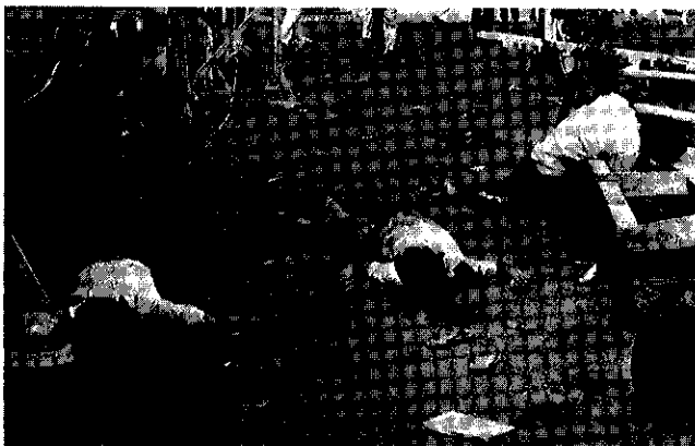
The bodies of 2 boys and a man lie in a Saigon street following a Viet-Cong grenade attack that killed 7 persons and wounded 47.