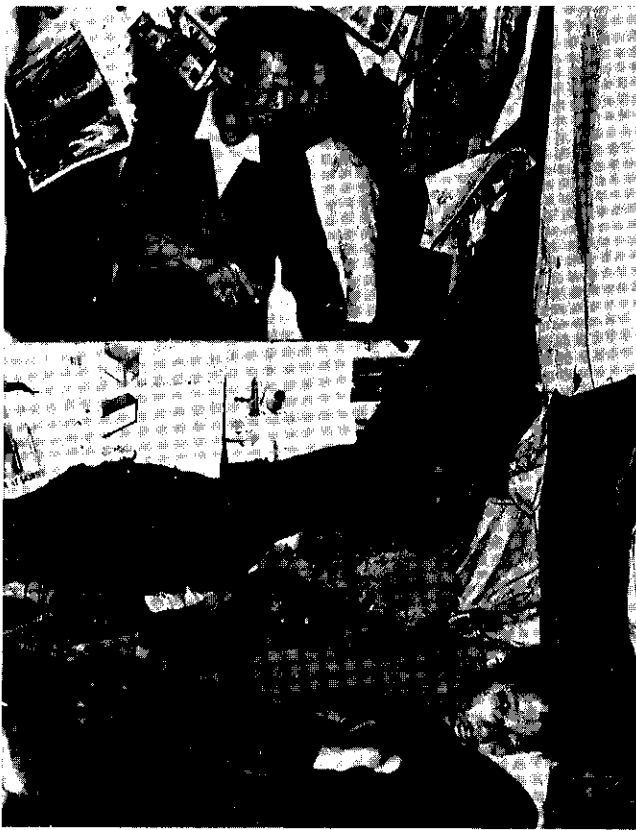
South Vietnamese villagers weep as they identify a young victim of the Viet-Cong mortar and rocket barrage on Ap Do village.

Viet Cong are able to play the role of champions of the people. By systematically wiping out the popular leaders who work effectively to improve the lives of the villagers, the Viet Cong hope to leave the masses leaderless and demoralized.