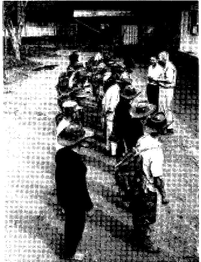
A U.S. Information Service officer explains to former Viet Cong why American troops are in Viet-Nam and the reasons for bombing Communist targets. These men then return to contested areas and explain government policy to the residents.

In the long run, the Government's success in winning Viet Cong sympathizers to peaceful and constructive participation in Vietnamese society will be closely related to the support it receives from the population as a whole. The progress of the government program to place political organization of the country on a democratic and constitutional base (See Viet-Nam Information Note No. 5, "Political Development in South Viet-Nam") is an increasingly important factor in building public support. The Viet Cong effort to prevent and disrupt elections indicates its recognition that effective and representative self-government in South Viet-Nam is totally incompatible with Communist goals.