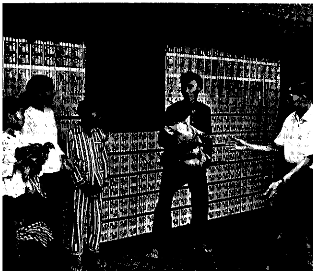
The families who settle in "New Life" hamlets with defectors from the Viet Cong are given land, animals, food, and a financial allowance. The men receive training in a new skill at a Chieu Hai center.

Once he is settled at the camp, the rehabilitation process begins. The Hoi Chanh is indoctrinated in the aims and purposes of the Government and the role of the allied forces in the war. The returnee is encouraged to plan for his own future.