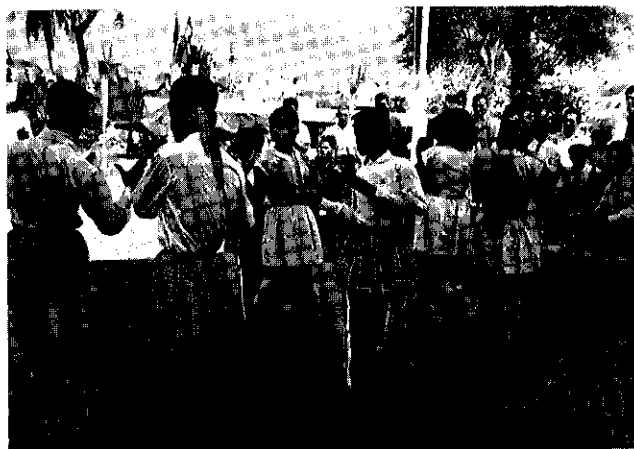
This professional dance team, part of a group of 50 musicians and dancers who rebelled against their harsh exploitation by the Viet Cong, defected en masse to authorities in South Viet-Nam.

The success of the Chieu Hoi program with the lower ranking Viet Cong was one of the