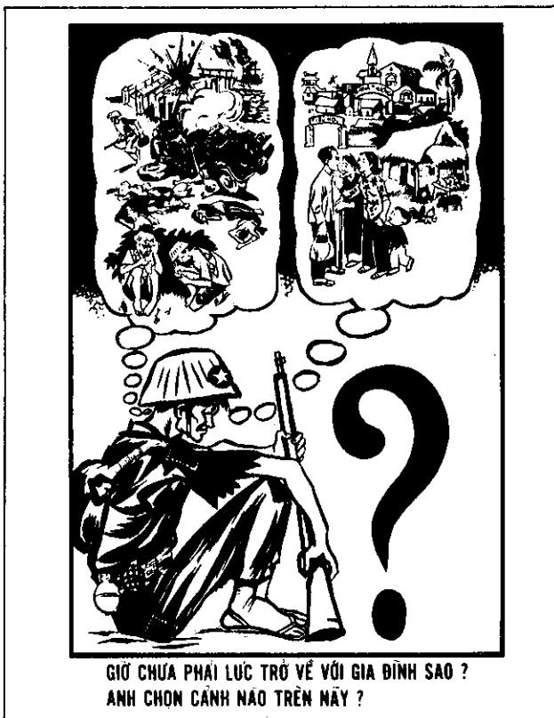
This South Vietnamese leaflet appeals to Viet Cong to give up fighting and return home.

Viet Cong propaganda derides the returnees as cowards, it does offer to take them back.