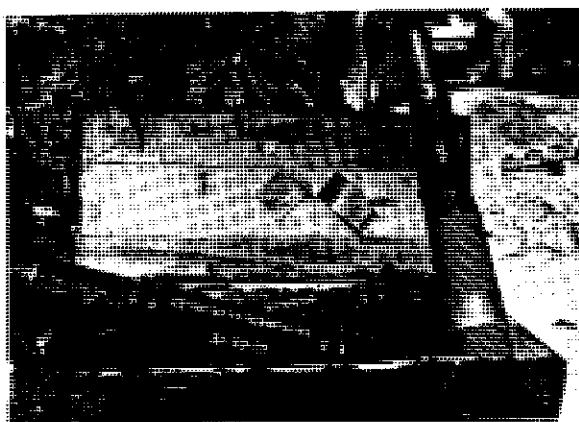
SOUTH VIET-NAM. Chinese language markings plainly visible on these 77mm. recoilless rifle shells found in offshore caves in South Viet-Nam show that they were manufactured in Communist China. At least 100 tons of North Vietnamese military supplies, mostly from Communist China and Czechoslovakia, were found in this spot alone.

"Today in South Viet-Nam we are witness to ... a war that is waged by men who believe that subversion and