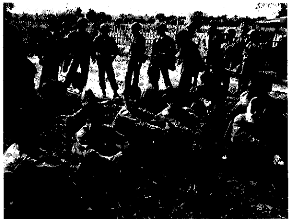
'LAOS. Lao soldiers guard North Vietnamese Regular Army soldiers after their capture in Thakhek, Khammouane Province. The Vietnamese soldiers were guarding a cave containing Communist Chinese-manufactured weapons and supplies.

Soviet foreign policy has been complicated by the ideological divisions which