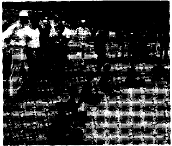
VIET-NAM REVOLUTIONARY DEVELOPMENT. Vice President Humphrey and Ambassador Ellsworth Bunker observe young Vietnamese boys being taught national songs at the Vung Tau National Revolutionary Development Center. The Center has graduated more than 30,000 young rural men and women who have gone into hamlets threatened or controlled by the Viet Cong to assist the local people in resisting Communist intimidation. The Vice President flew from Saigon where he was attending the October 1967 inauguration of President Thieu.

4. Efforts to initiate a peaceful settlement. From the outset of the war in Viet-Nam, the United States has tried to move from the battlefield to the conference table. President Johnson often has offered talks without preconditions. Hanoi's response until May 3 was to demand preconditions of its own. The U.S. response, in effect, has been: If Hanoi demands such a precondition as a halt to the bombing, the United States has a right to ask for assurance that Hanoi will not take military advantage of such a halt. Moreover,