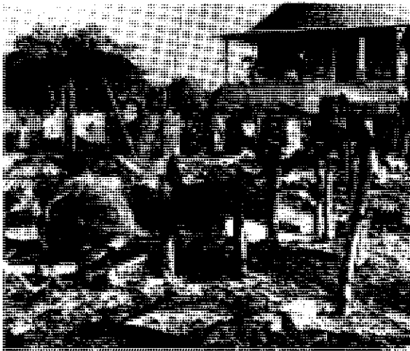
PHILIPPINES. Townspeople search the wreckage of their homes after a Communist-led Hukbalahap guerrilla raid on Luzon Island August 25, 1950. Guards ringed Manila after a weekend of terror by the Huks left a death toll of 85 persons in nearby communities.

excuse for a war of national liberation by giving the country its independence under a democratically elected government.