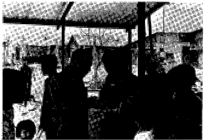
Cadre advisor of the Agency for International Development checks plans for new housing with Revolutionary Development team and local people.

It was at a graduation ceremony of recently elected officials who had completed government training that President Nguyen Van Thieu, speaking extemporaneously, underscored his nation’s resolve to strengthen and support free village elections. “In order to defeat the Communists,” he said, “democracy must be implemented at every level in South Vietnamese life. Democracy is not just having a constitution, an elected assembly, and elected national leaders. For people do not live in the Presidential Palace or in the National Assembly, but in straw huts in the villages and ham-