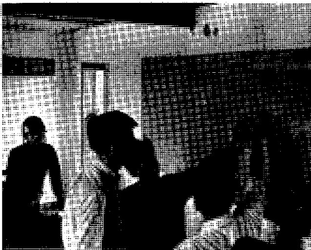
Briefing sessions on hamlet development progress are conducted regularly by Revolutionary Development teams for U.S. Government representatives.

The data are assembled at regular intervals by MACV District Advisors who live in close contact with the villages and hamlets in their region. The computerized measurement of hamlet control is reported under three basic categories—Relatively Secure, Contested, VC Controlled.