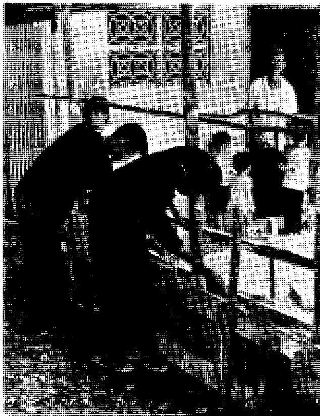
Building projects are underway throughout South Viet-Nam, where Revolutionary Development teams encourage the villagers' participation to give them a direct interest in preserving what they have built.

Although essentially and predominantly a Vietnamese program, the RD effort is supported by United States and other free world assistance missions. Under the overall coordination of the Military Assistance Command in Vietnam (MACV), American aid and technical advice is funneled through U.S. Civil Operations and Revolutionary Development Support (CORDS)—an inter-agency management group which combines the efforts of the Agency for International Development (AID), the U.S. Information Agency (USIA), several U.S. Embassy offices, and the non-combat