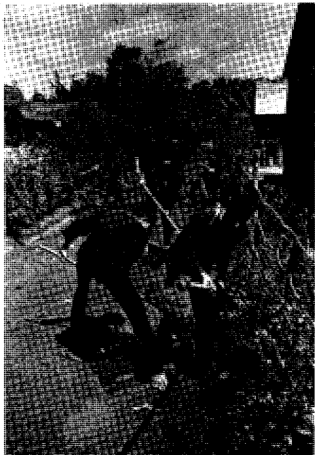
Revolutionary Development team workers assigned to this secure hamlet help dig drainage ditches along the roads after installing barbed wire around the houses.

The rural policeman on his remote hamlet beat, or the ARVN medic bandaging a villager's