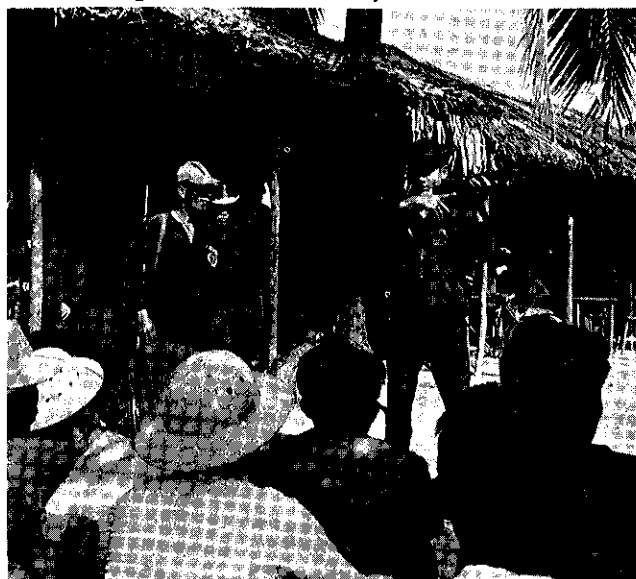
Defense briefing and weapons training is given to local militia by members of Revolutionary Development team.

Creating a secure environment is essentially a matter of people participating in their own defense. The hamlets of Viet-Nam illustrate the point dramatically. Here members of