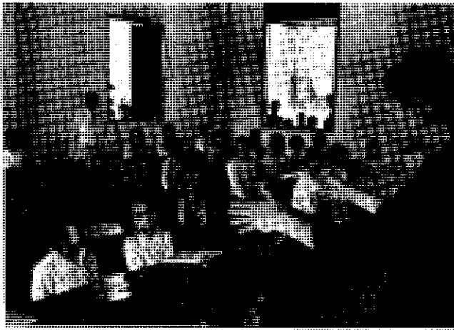
Revolutionary Development team members not only help to build schools, they also assist in the educational process.

ganizes citizen groups, and improves local government. The remaining section assists village officials in the implementation of development programs.