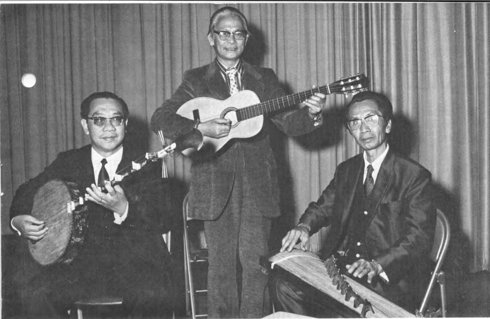
Symposium on Vietnamese Music at Southern Illinois University