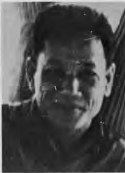
Lt. General Tran Van Tra