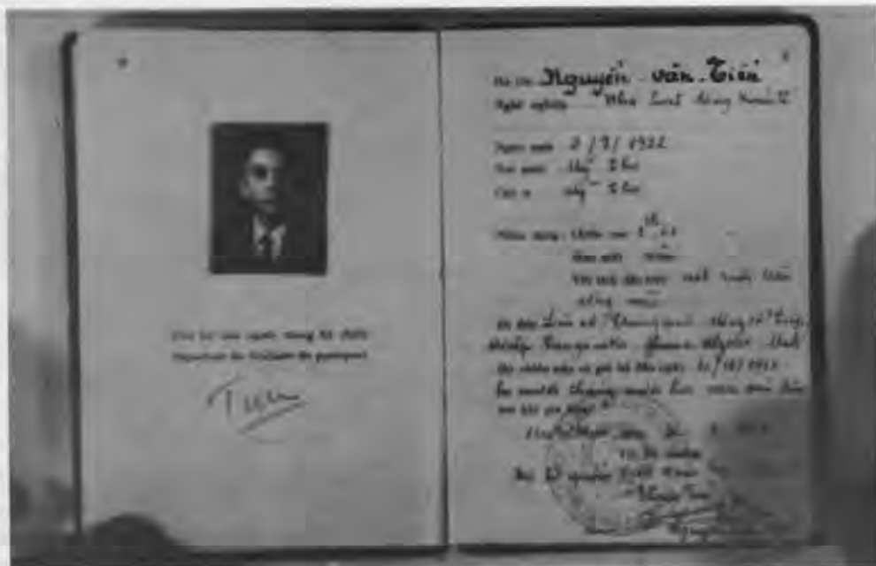
North Vietnamese Passport used by Official of National Liberation Front (NLF)

While the regular North Vietnamese military and Viet Cong main force units draw supplies from the North as an expeditionary force, the Viet Cong guerrillas are more likely to depend on supplies generated in the South. They, too, however, depend on North Viet-Nam for much of their war materiel. Comprehensive information on how the regular military units coordinate with the Viet Cong is not available, but it appears likely that much of the coordination is done on an ad hoc basis at the local level.