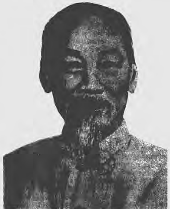
Ho Chi Minh

Save for reducing the Viet Minh threat, most of this program was completed by 1958.