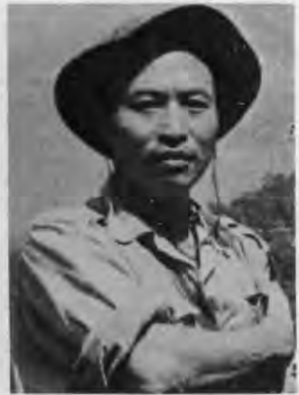
Maj. General Tran Do

forces that can be rallied, win over all forces that can be won over, neutralize all forces that should be neutralized, and draw the broad masses into the general struggle against the U.S.-Diem clique for the liberation of the South and the peaceful reunification of the fatherland."