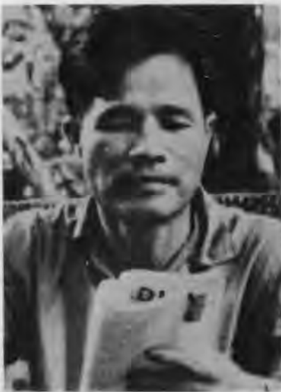
General Nguyen Chi Thanh