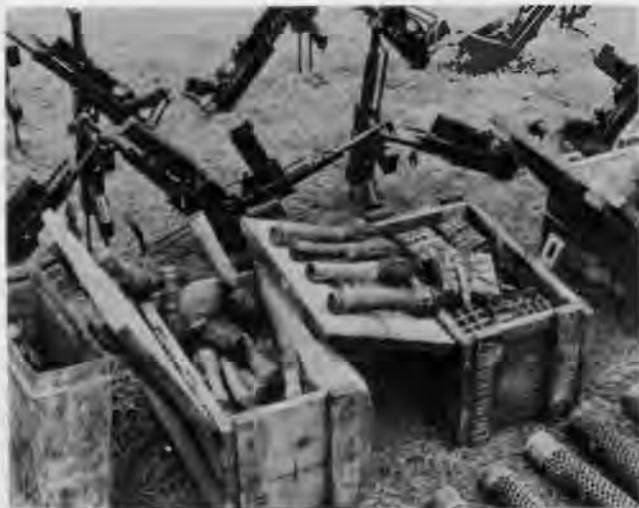
Captured Viet Cong Weapons

The early Viet Cong effort laid great stress on guerrilla activities, largely in the rural areas. Occasional terror bombings were per-