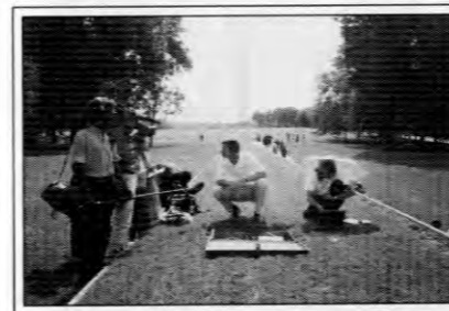
The Parsons Brinckerhoff team explains to local and national press about their instrumentation and readings.

So you can see there are a lot of variables that have to be studied when considering how best to protect this important American legacy. After a thorough analysis, the PB team will issue a series of recommendations for Phase III. A life cycle cost analysis and recommendations for replacing stone panels, if and when necessary, will be made a part of this phase. Also, a thorough investigation into any and all facets of the entire site will be rendered at the completion of Phase III. And while it may be technical, we will keep you informed every step of the way because we know how much the Memorial means to each and every one of our loyal supporters. And we at the VVMF are confident that working together with you, our scientists, and the National Park System, the Vietnam Veterans Memorial will be guaranteed a long, long life, well into the new millennium.