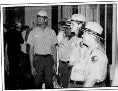
Vietnam Veterans Memorial Volunteers, Gold Star Mothers, National Park Service rangers, and even our official VVMF Bagpiper, gathered together to enjoy some R'n'R under VVMF auspices.