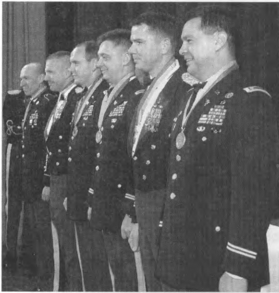
Order of St. Michael awardees