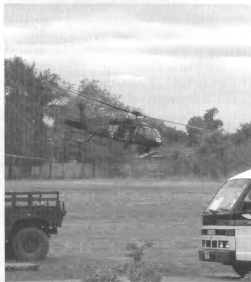
A 54th Med. Co. crew departs TF 62 Med. area on a mission, Phitsanulok, Thailand, during Cobra Gold 2001 deployment