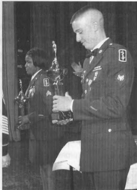
421 st Soldiers of the Year awardees

421st Medical Evacuation Battalion— Best Aviation Battalion for Combat Support