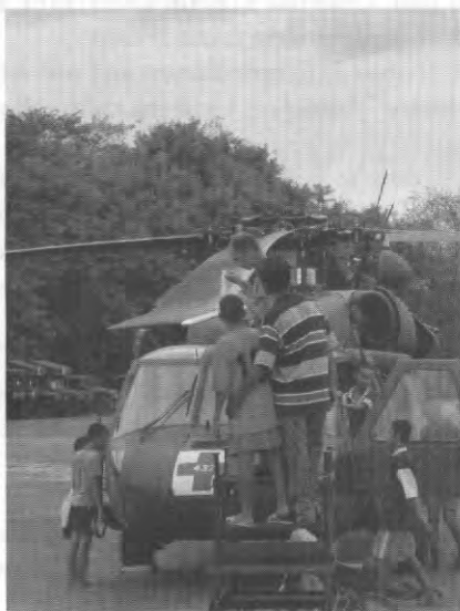
Local Thai school children supervise 54th Med. Co. maintenance, Phitsanulok, Thailand, during Cobra Gold 2001 deployment