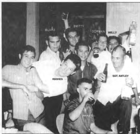
Shorttimer’s Party at Ocean Bar, Saigon, April 1964.