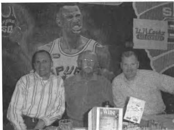
Two commanders and the CSM of the 421 st Medical Evacuation Battalion at the Army Medical Evacuation Conference.