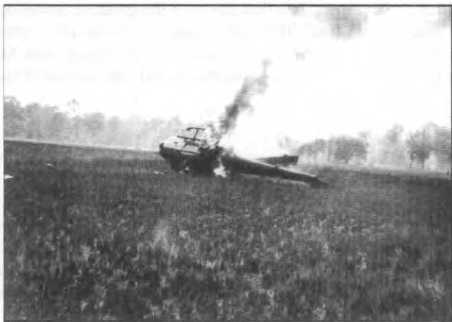
Binh Gia, Vietnam, February 1965.