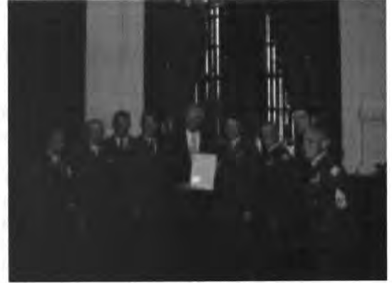
Texas Legislature honors the 507th Medical Company (AA)