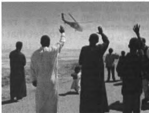
The residents of the Iraqi village wave goodbye.