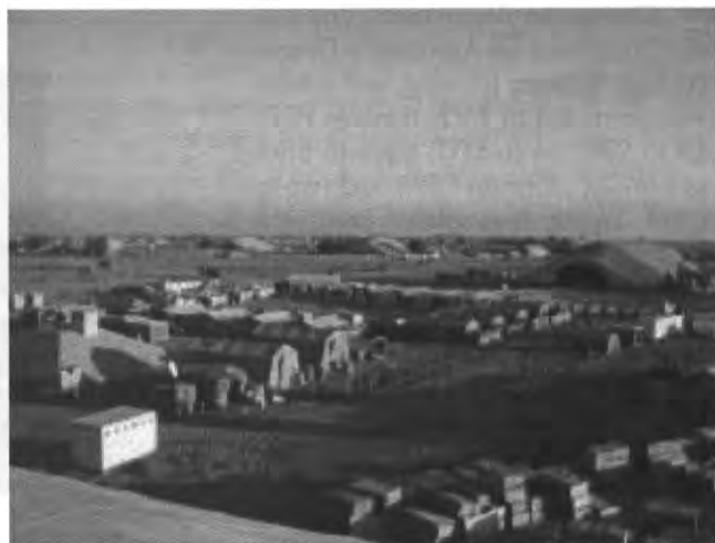
Overhead view of the company area at LSA Anaconda.