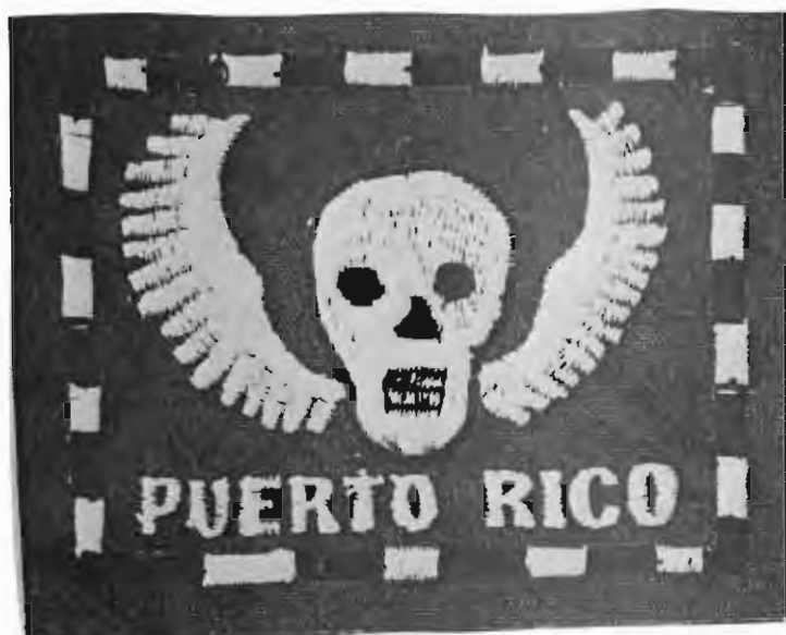
RECON TEAM PUERTO RICO