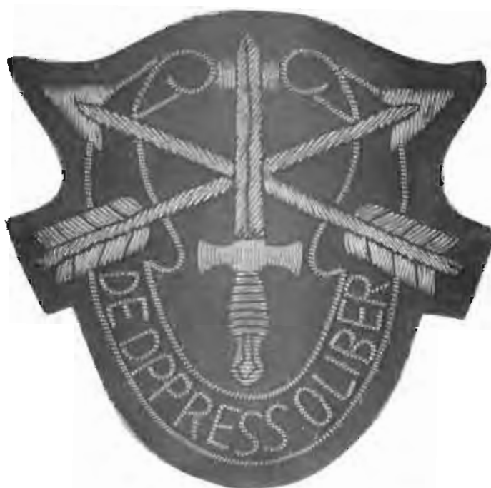
SPECIAL FORCES Pocket Patch BULLION EMBROIDERED