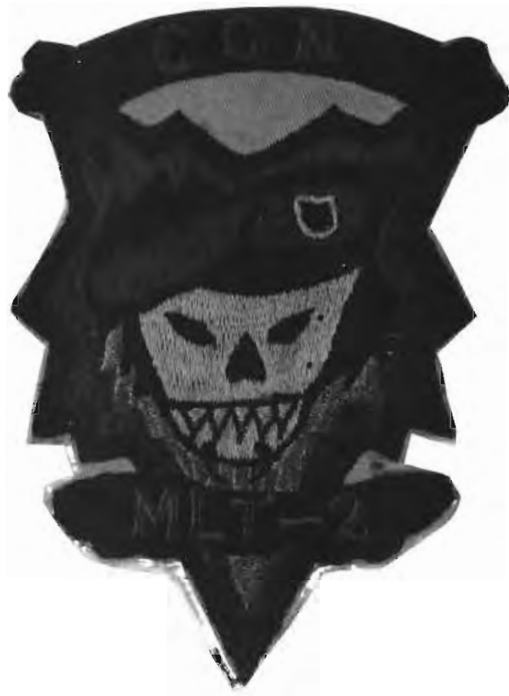
MOBILE LIAISON TEAM 2