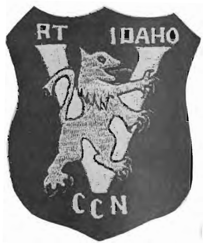
RECON TEAM IDAHO