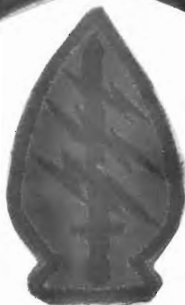
Shoulder Patch, VIET MADE SUBDUED