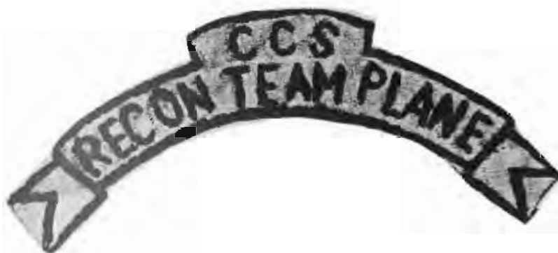
RECON TEAM PLANE