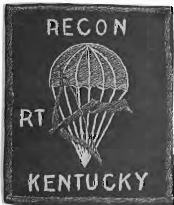
RECON TEAM KENTUCKY