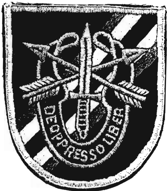
46th Special Forces Co