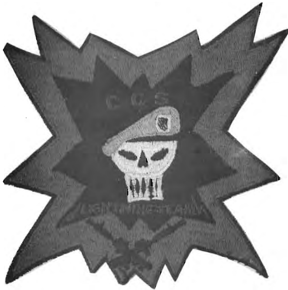
Recon Team "FORK"