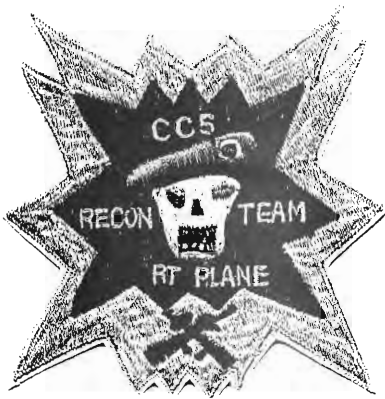
RECON TEAM PLANE