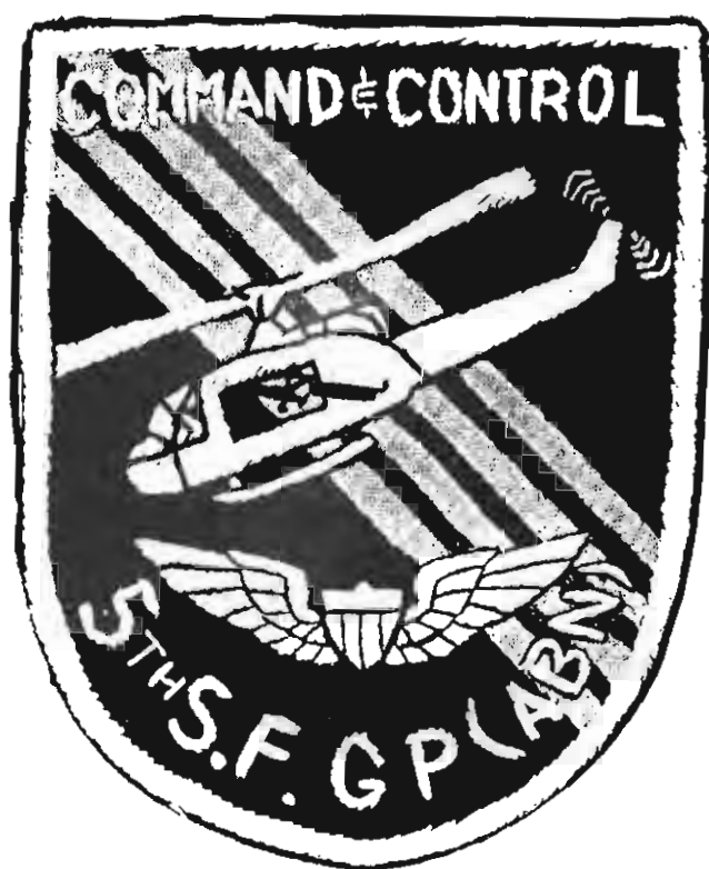
5th Special Forces Gp