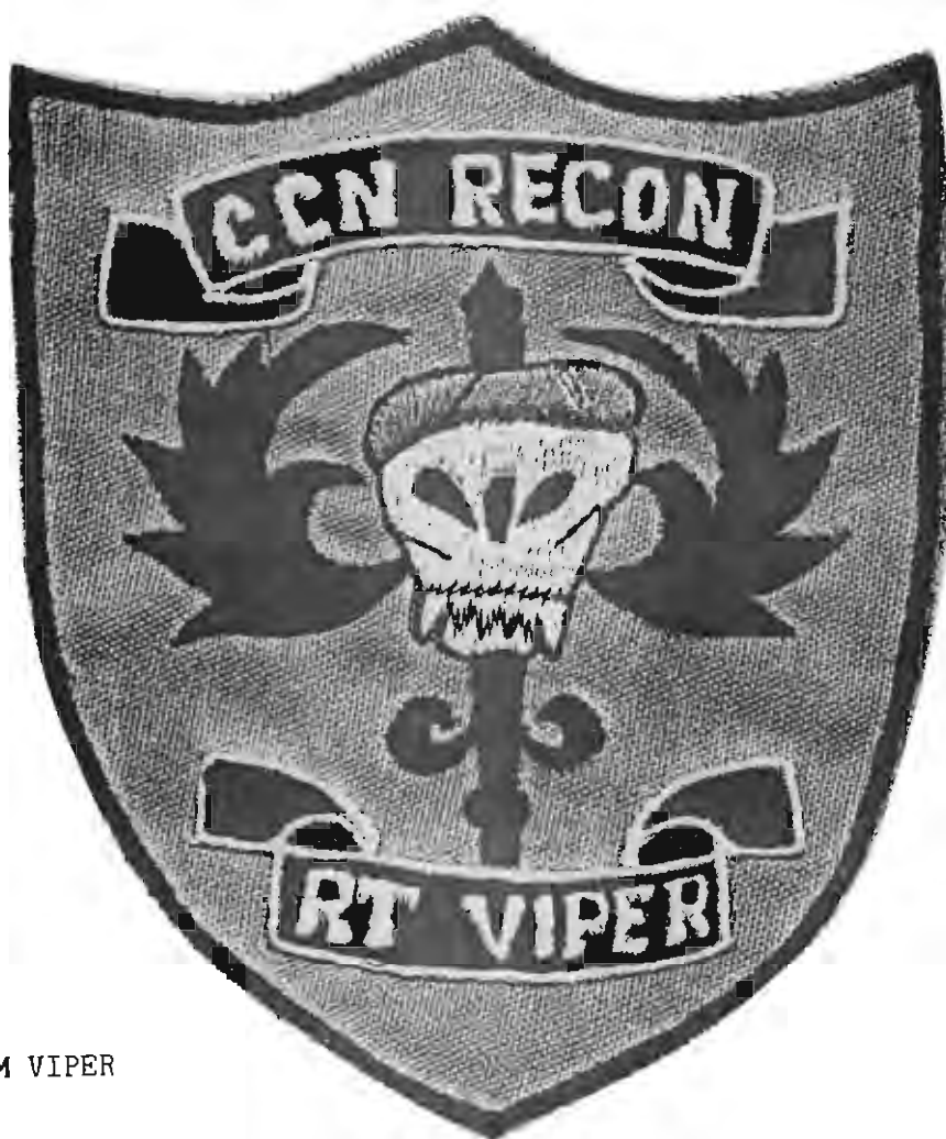
RECON TEAM VIPER