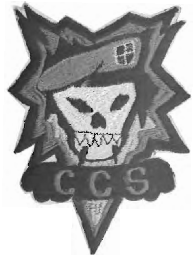
Command Control South