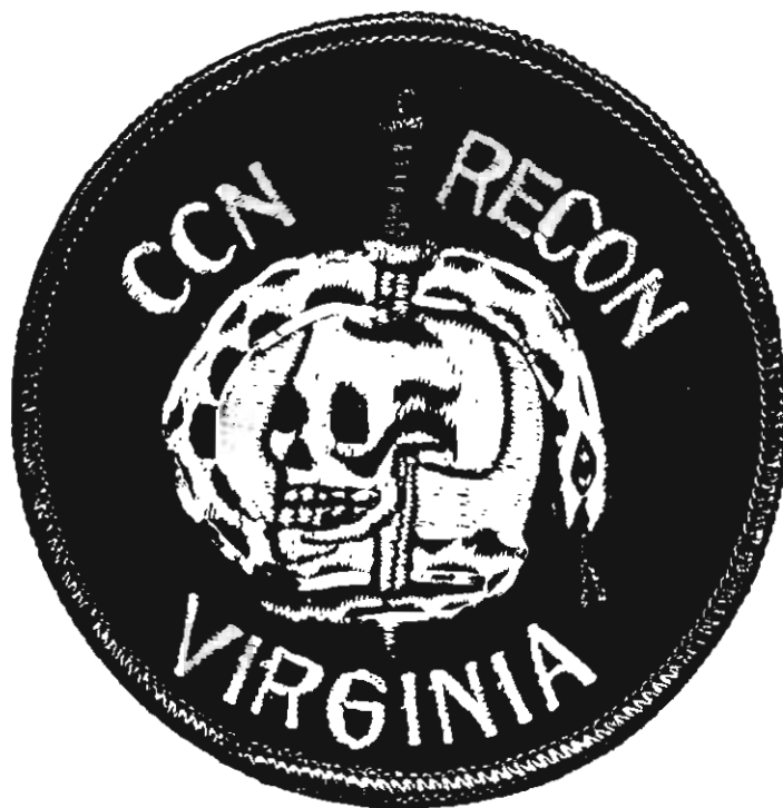
RECON TEAM VIRGINIA