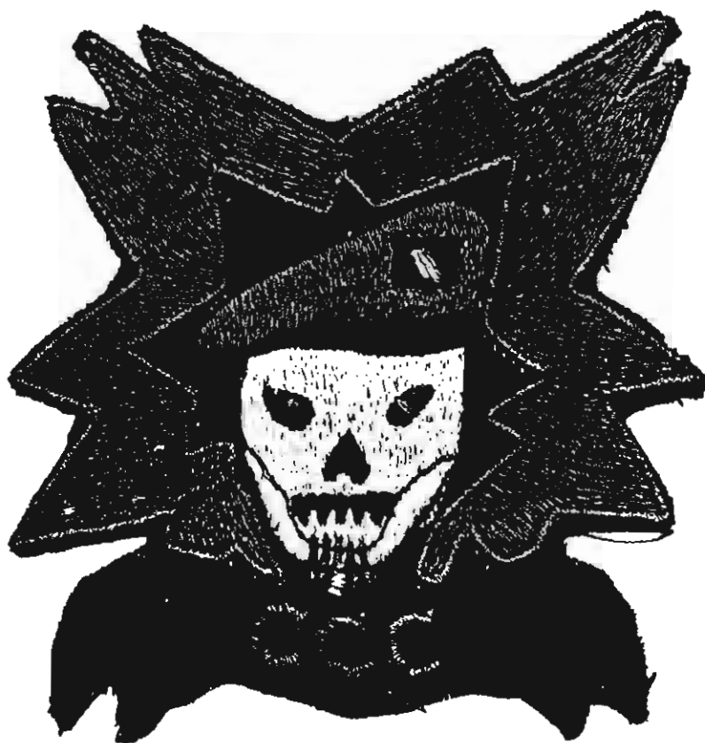
COMMAND & CONTROL CENTER