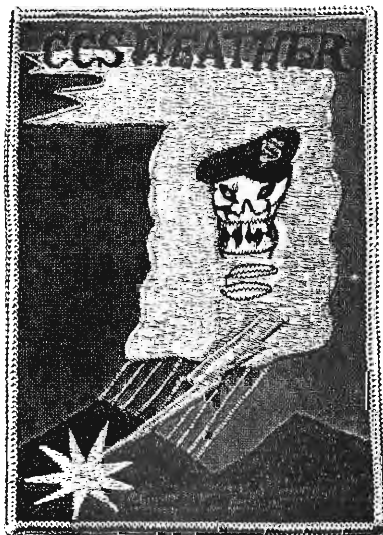
RECON TEAM WEATHER