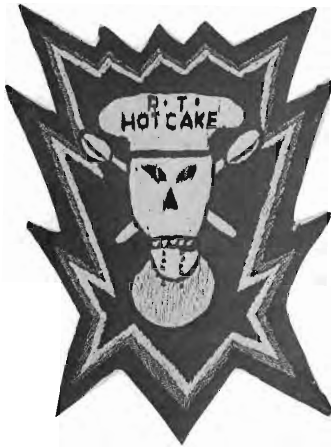
RECON TEAM HOT CAKE