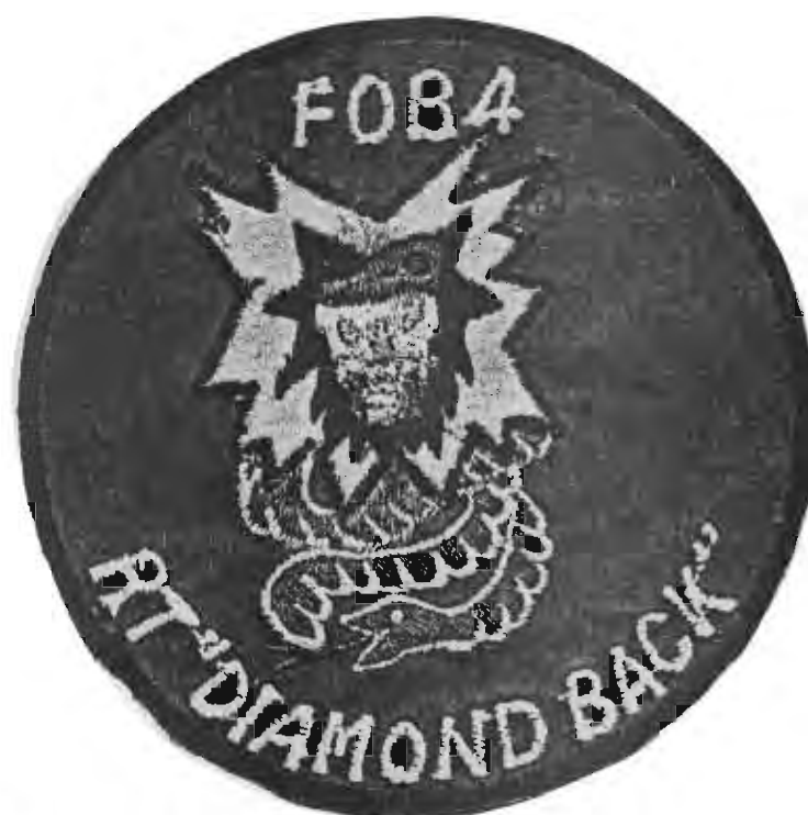
Forward Opns Base "4"