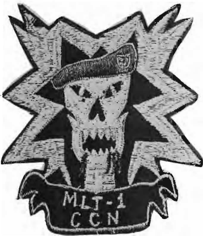
MOBILE LIAISON TEAM 1