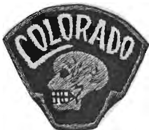
Recon Team Colorado