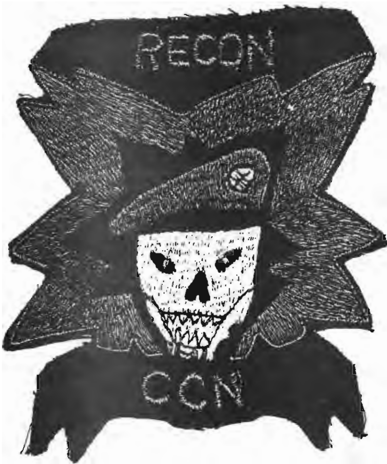
COMMAND CONTROL NORTH