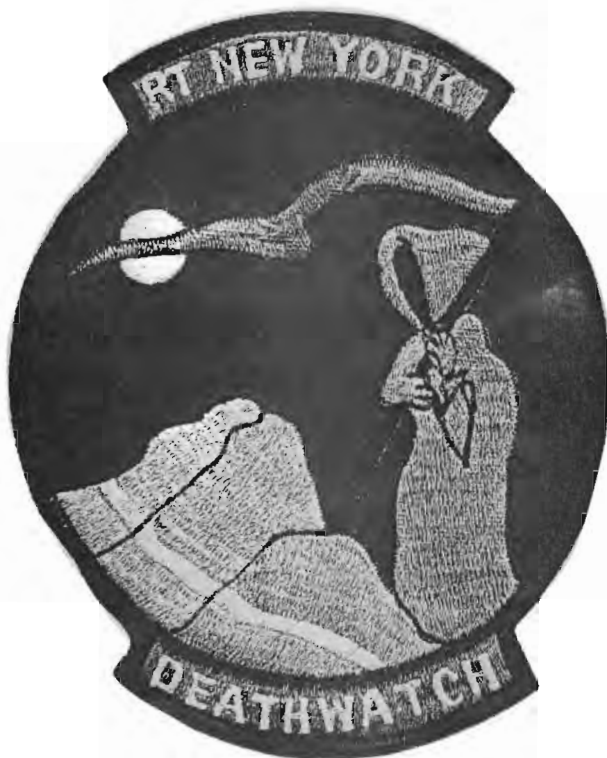
Recon Team New York