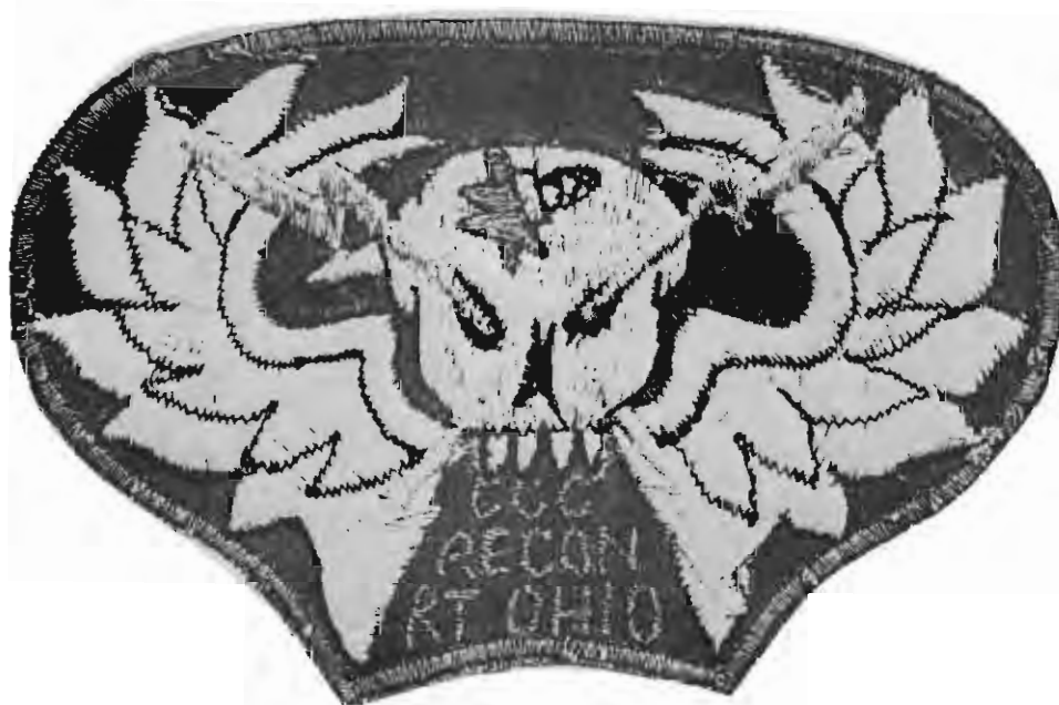
Recon Team "OHIO"