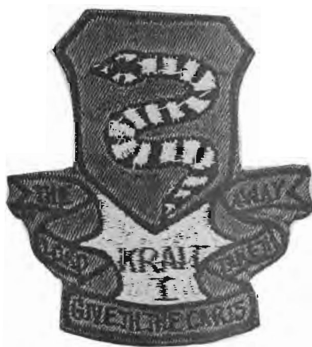
RECON TEAM KRAIT