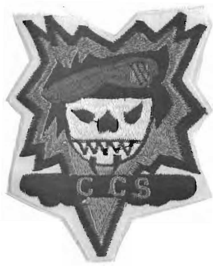
Command Control South