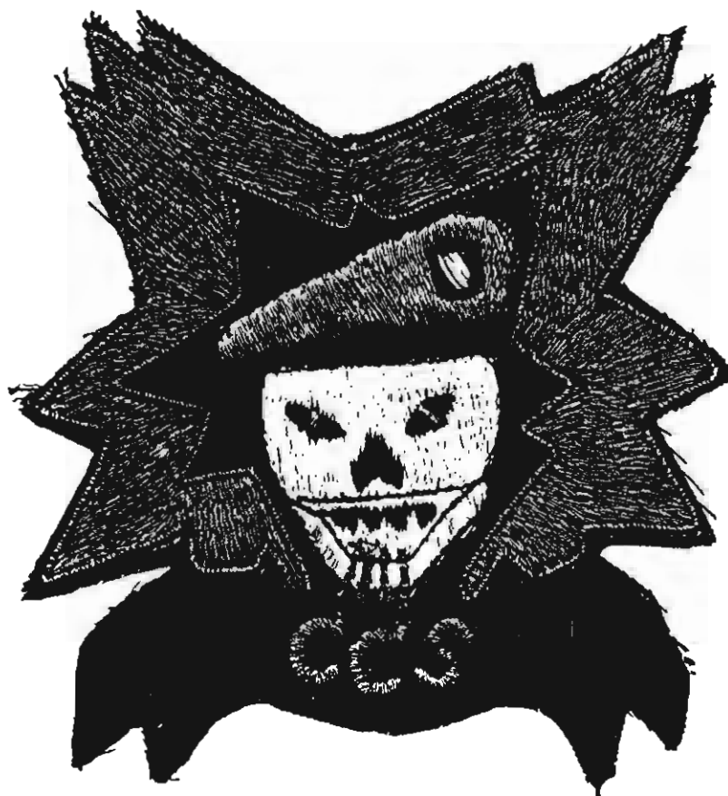
COMMAND & CONTROL SOUTH