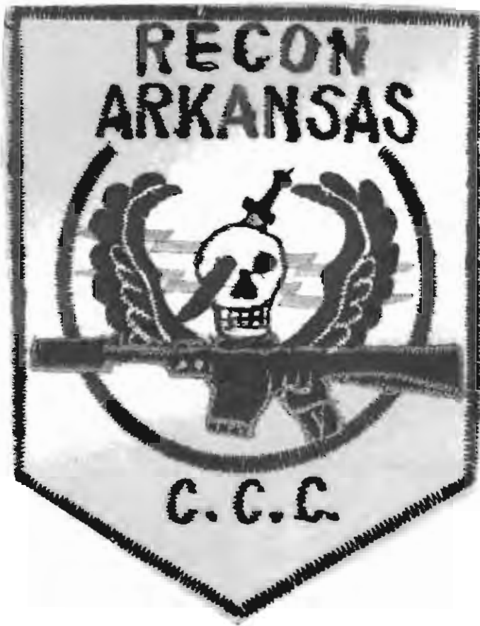
Recon Team "ARKANSAS"