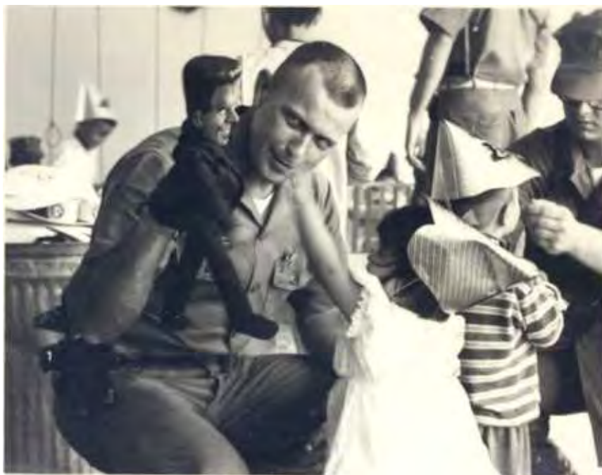
NO 'MONSTER' IS HE -- Marines serving with the Armed Forces Military Police, Da Nang, entertain children at the Sacred Heart Orphanage, Da Nang, during a holiday season party sponsored by the military police unit. 1-3229-68