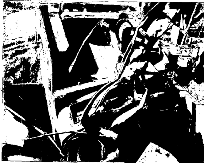
Photograph of a M38A1 Jeep which detonated an explosive device of unknown origin in the vicinity of the Hamlet of Thon Quat KA, RVN, on 26 January 1967, at 1615H.