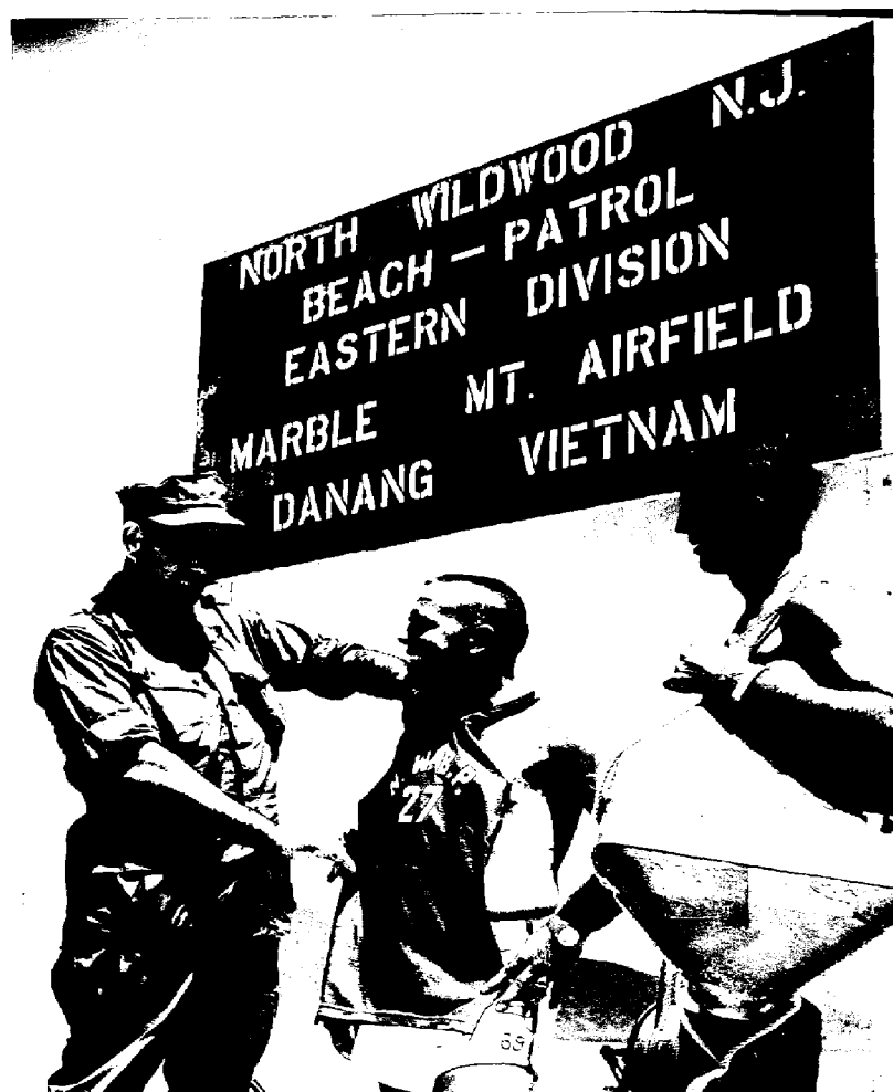
Supporting Art III MAF Release #759-65 Photo Release #1-327-65