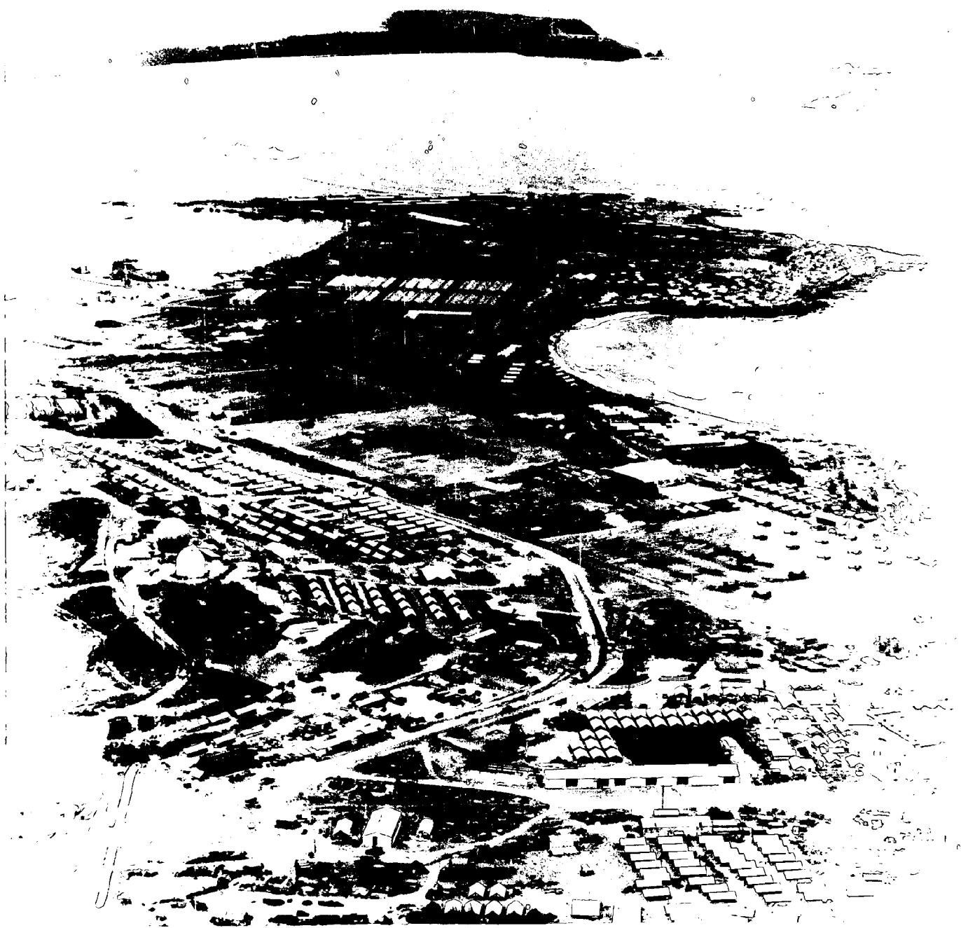
PHOTOGRAPH OF KY HA COMPLEX - LOOKING NORTH