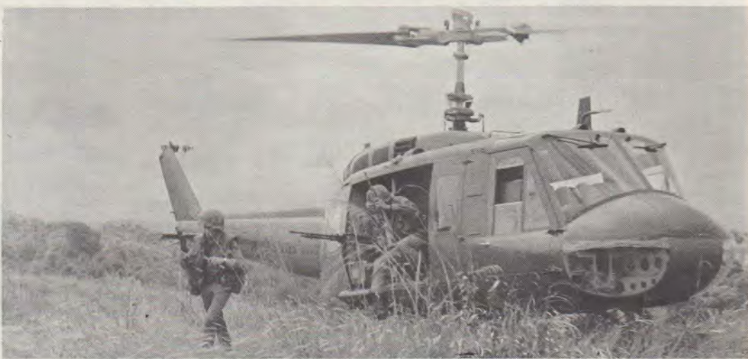
YOUTHS IN ACTION—A "Combat Youth" training with members of the 11th Inf. Bde. piles out of a helicopter for a combat assault.

At the graduation ceremony at the Duc Pho helipad, Henderson said the program showed the "determination on the part of all citizens of the Duc Pho area to stand up and be counted in the common struggle against the Viet Cong."