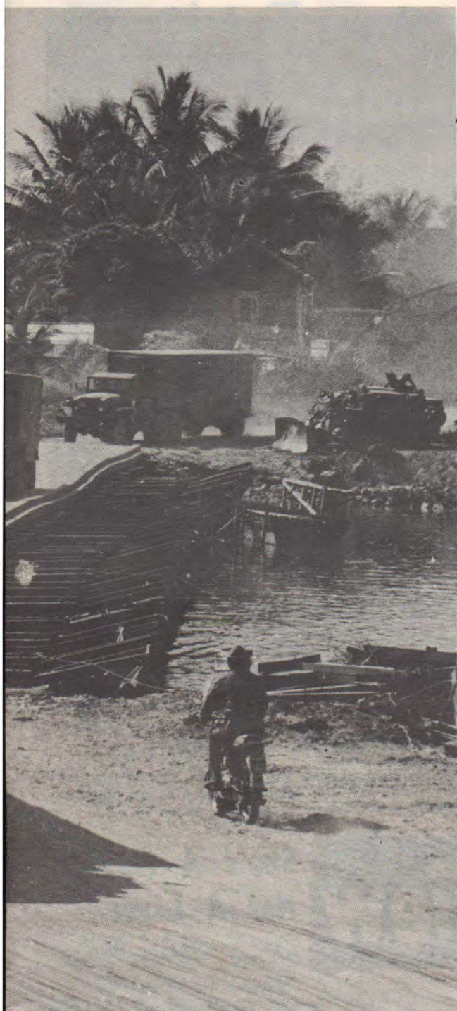
olls Off An Tan Bridge