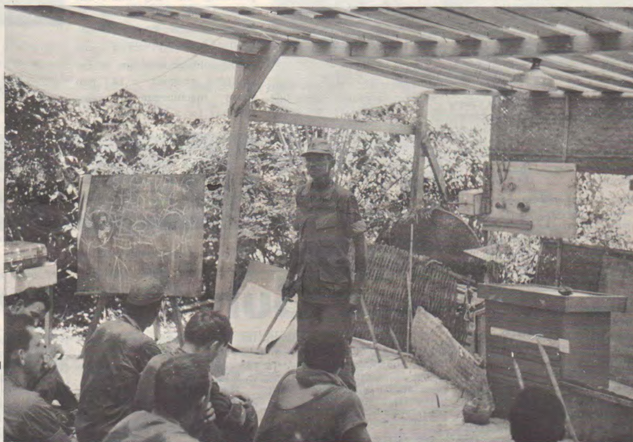
Combat Center Trains New Troops