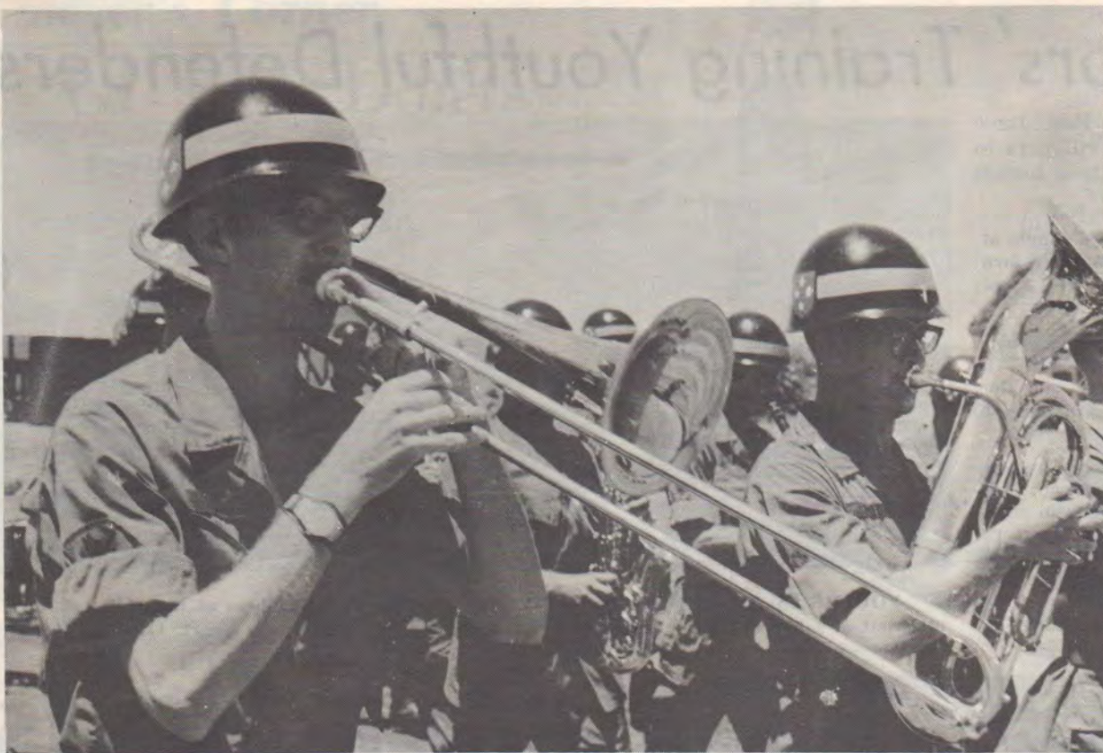
Band Provides Music For All Events