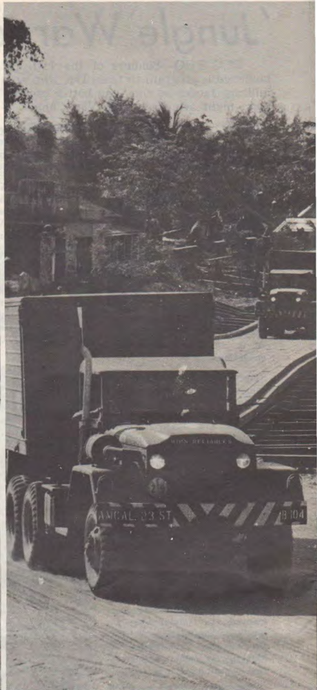
23rd S&T Bn. Convoy R