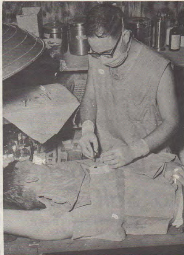
23rd Med. Bn. Treats Vietnamese as well as Soldiers