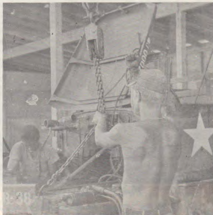
73rd Maints. Bn.'s Work Non-Ending