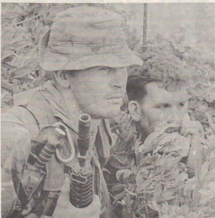
LRP's On Patrol

CHU LAI —From a long range patrol team deep in the jungles around Chu Lai to a marching band playing at a change of command ceremony, the Americal Spt. Cmd. backs up the combat activities of the Army's only named division.