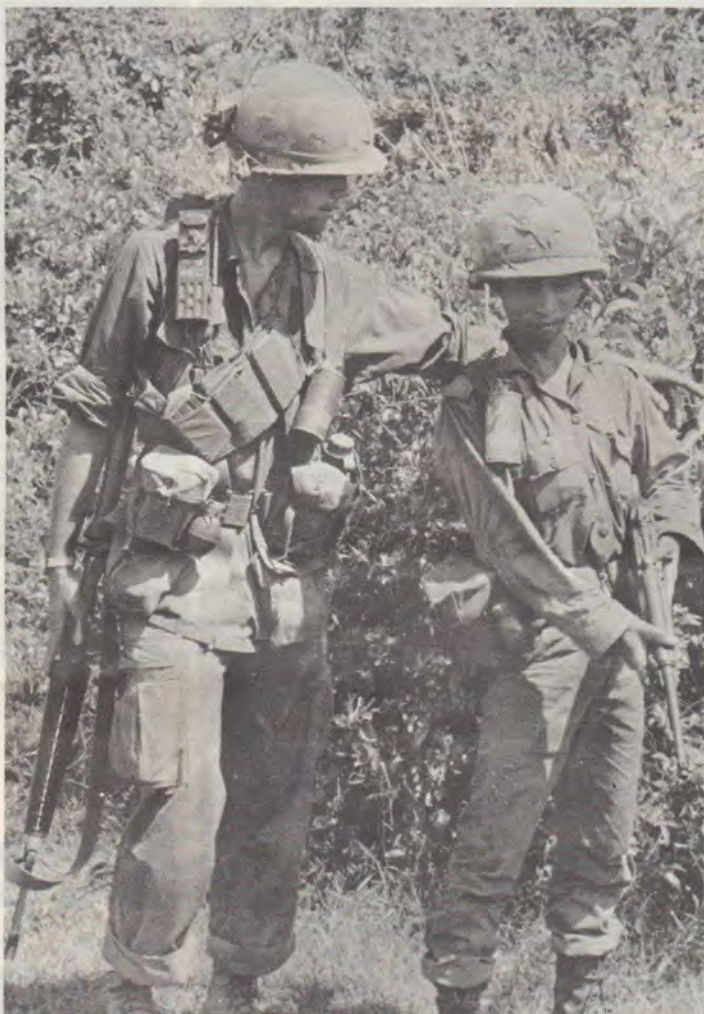
GIVES ADVICE—An 11th Inf. Bde. soldier gives friendly advice to a "Combta Youth" during a field operation.