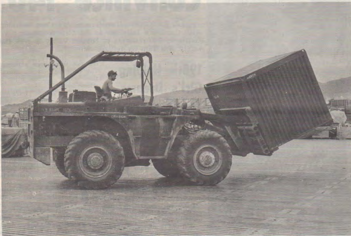
23rd S&T Bn. Handles Supplies