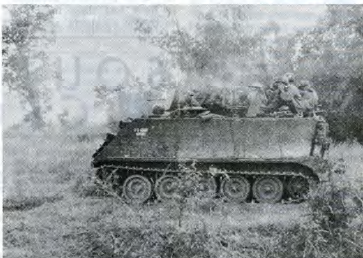
ACAV FROM 1ST SQDN., 1ST CAV. BLASTS AWAY at VC/NVA force that tried to launch an offensive toward Tam Ky. The "Dragoons" annihilated the enemy push.

A few minutes later, the (Continued on Page 3)