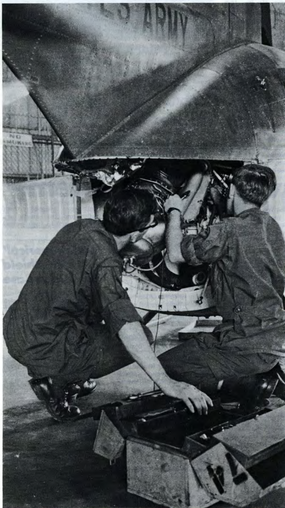
Mechanics search for trouble spot in Cayuse engine