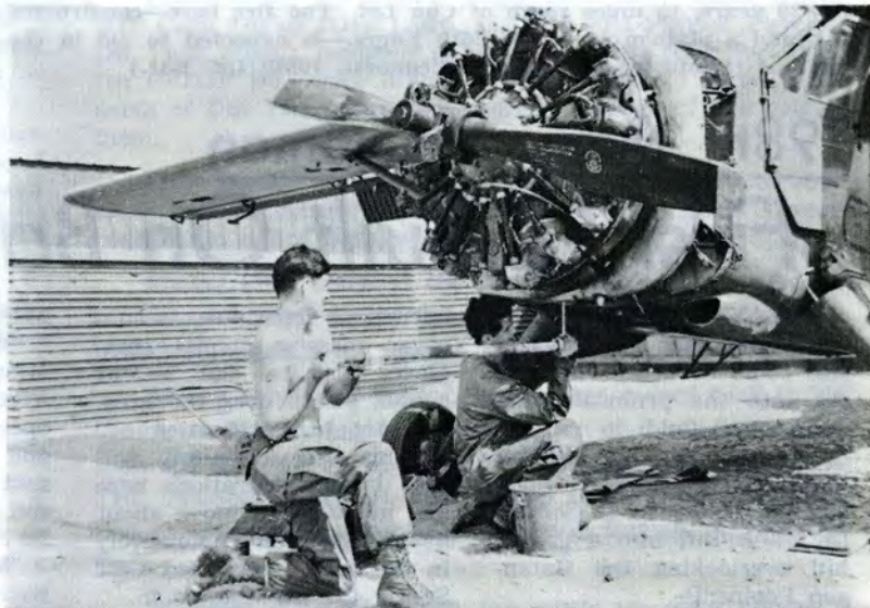
Fixed-wing craft also receive expert repair