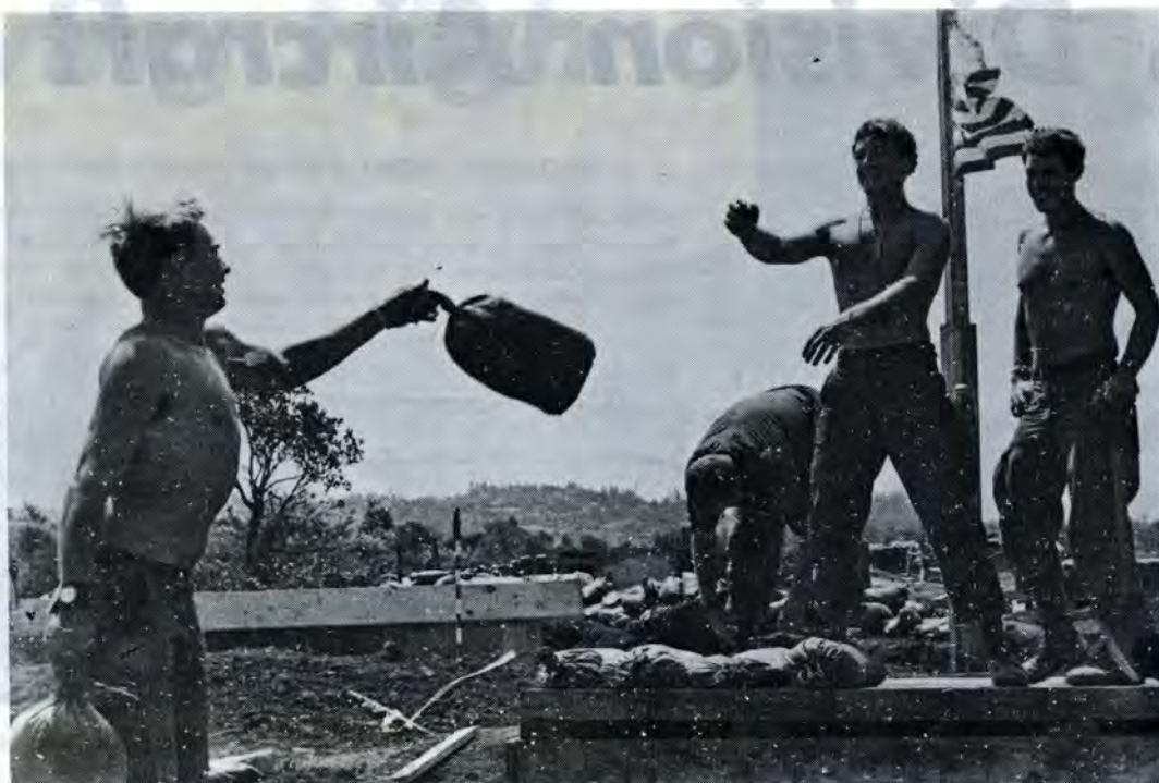
WITH A HEAVE, 198th Inf. Bde. soldiers add another sandbag to a bunker at Fire Support Base Minuteman, the new forward LZ of the 5th Bn., 46th Inf. Minuteman is the first American fire base in the heart of the Batangan Peninsula, a former Communist stronghold for 20 years, 15 miles south of Chu Lai. The fire base—constructed by D Co., 5th Bn., 46th Inf. and a platoon of B Co., 26th Engrs.—is expected to aid in the pacification of the peninsula.