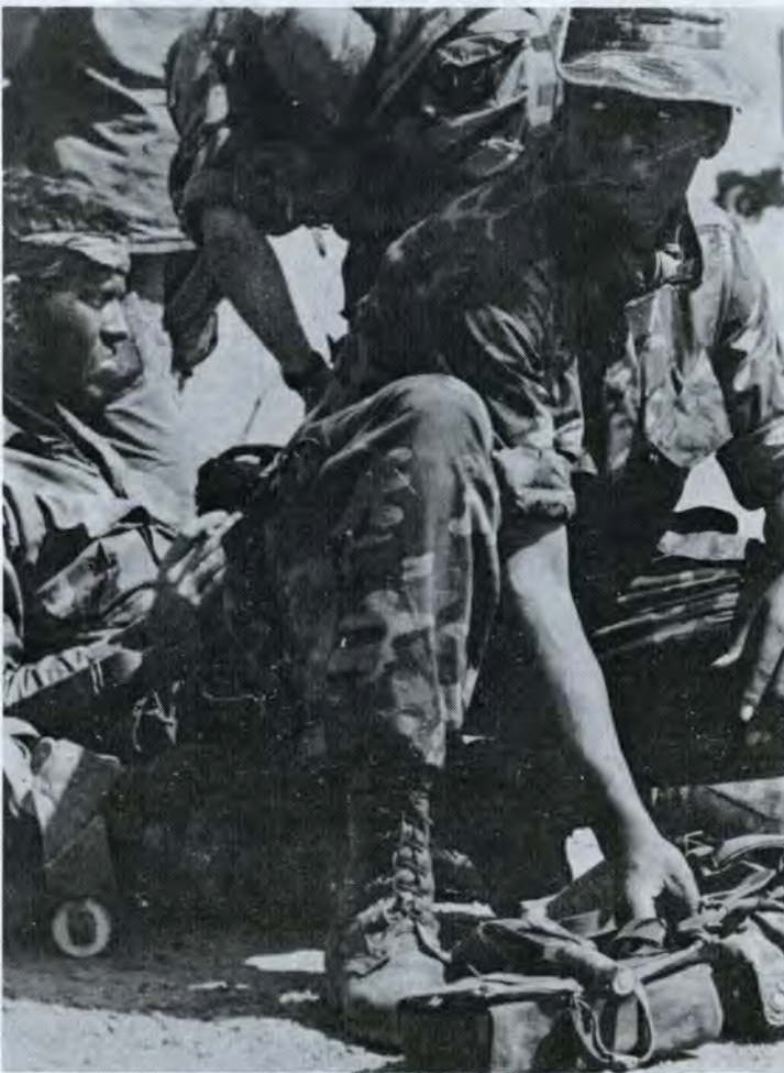
CAMOUFLAGED AND READY to seek hidden enemy, LRPs relax and check equipment before choppers fly them to mission.