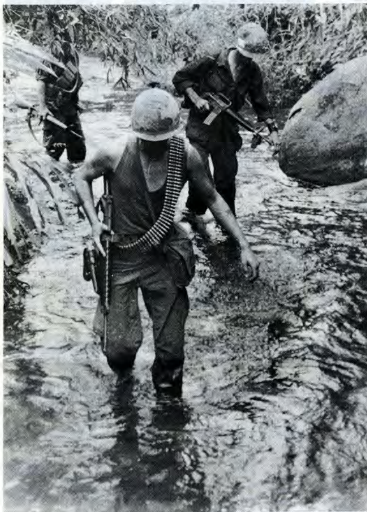
SLOSHING IN A MOUNTAIN STREAM, 2nd Bn., 1st Inf. troops of the 196th Inf. Bde. look for 'Charlie' in recently-concluded Operation Fayette Canyon.