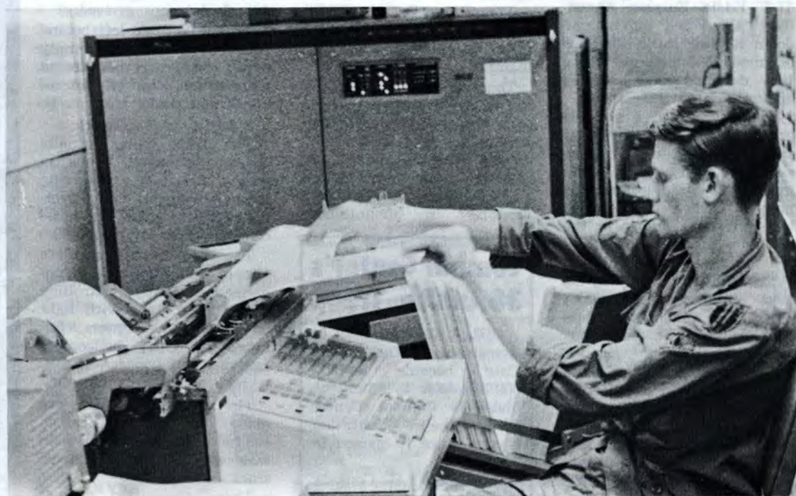
Computer is fed with data to keep track of 20,000 replacement parts