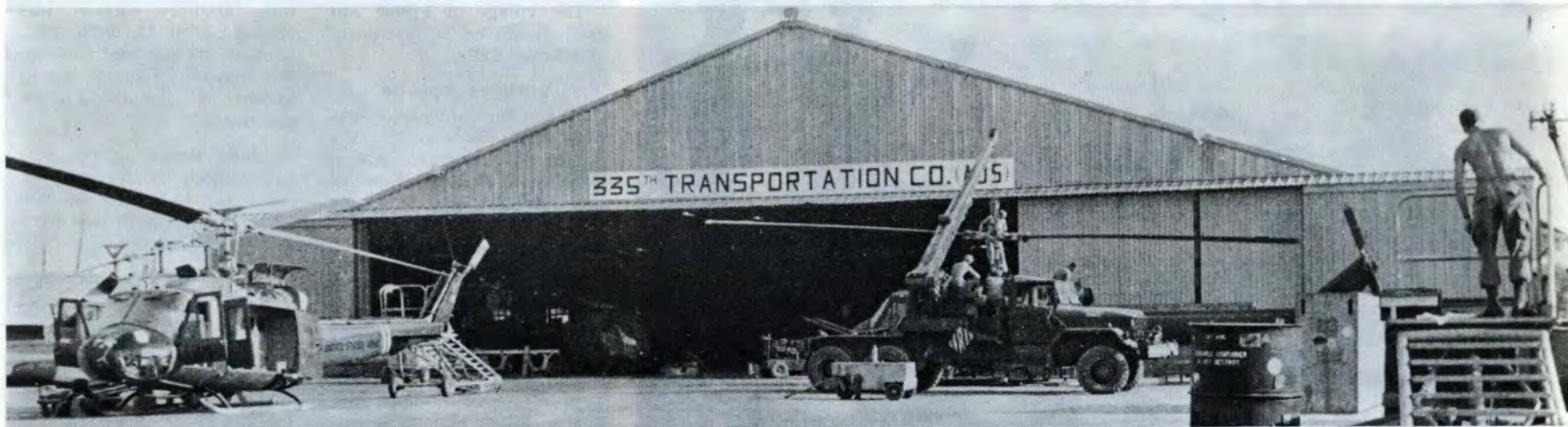
Crippled Americal choppers are patched up outside the 335th Trans. Co.'s main maintenance hanger