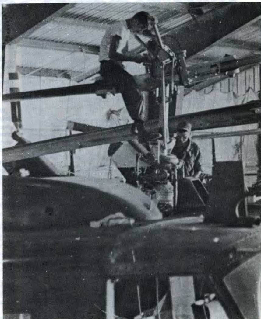
The helicopter fix-up center for the division, the 335th,