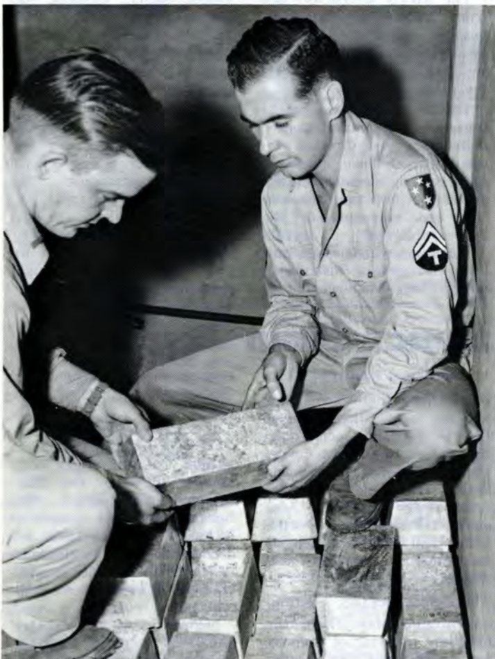
HOARDED SILVER BARS uncovered by infantrymen of the Americal Division on October 9, 1945, are prepared for shipment to the Japanese Finance Ministry by an Americal lieutenant and tech sergeant.

After the Occupation ended, the $1,343,000 hoard of silver was turned over to Japan's Finance Ministry to determine the rightful owners.