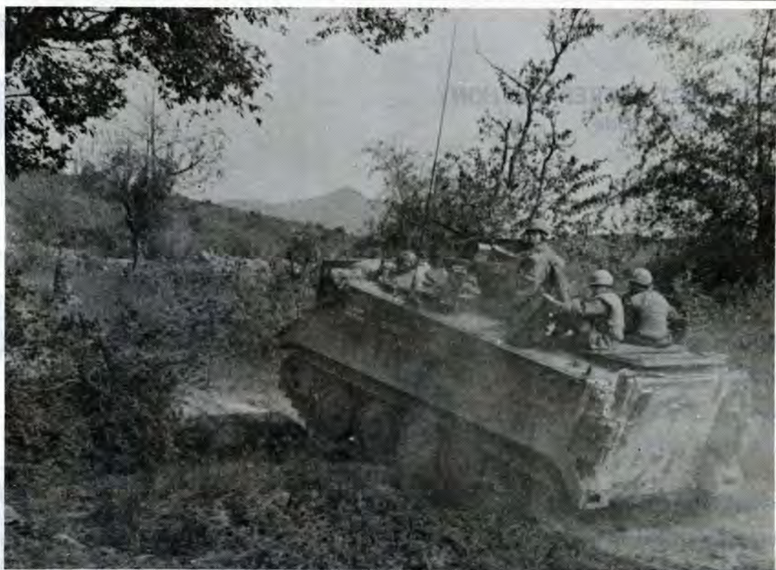
DUSTY ACAV from E Trp., 1st Cav. moves cautiously over the rough terrain south of the area where A Co. 1-20 trapped six VC in their cozy little hole hidden under a tree. E Trp. was operating with B Co. in squeezing the VC towards A Co. who were awaiting the rendezvous.