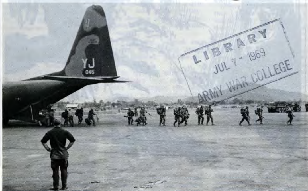
"SCREAMING EAGLES" deplane from C-130s that carried them from their nesting place near Phu Bai to the Tam Ky Airport to engage in Operation Lamar Plain. The mid-afternoon arrival enabled the soldiers to begin activity the next morning under the operational control of the Americal.