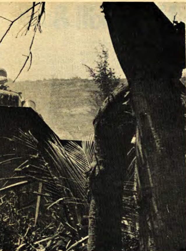
the dozer heads for the larger tree. The dozer was d by Headquarters Platoon, Bravo Company of the