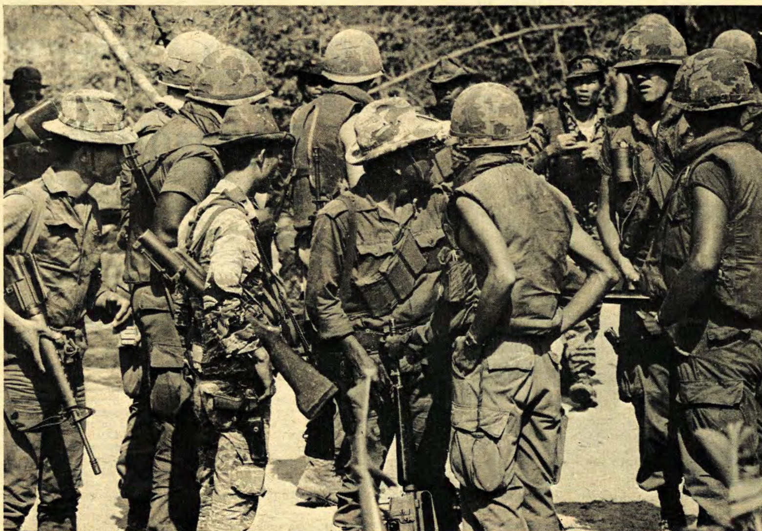
Members of the Quang Ngai province Civilian Irregular Group confer with infantrymen from Bravo Company, 1st Battalion, 6th Infantry. The men were organizing a joint patrol in the defense of Van Thien which is located north of Quang Ngai.

A little further west, a jumble of bamboo framework and concertina wire bears the promise of safety and shelter for the several thousand Vietnamese. Scurrying figures run the maze of trails and paths carrying impossible loads of