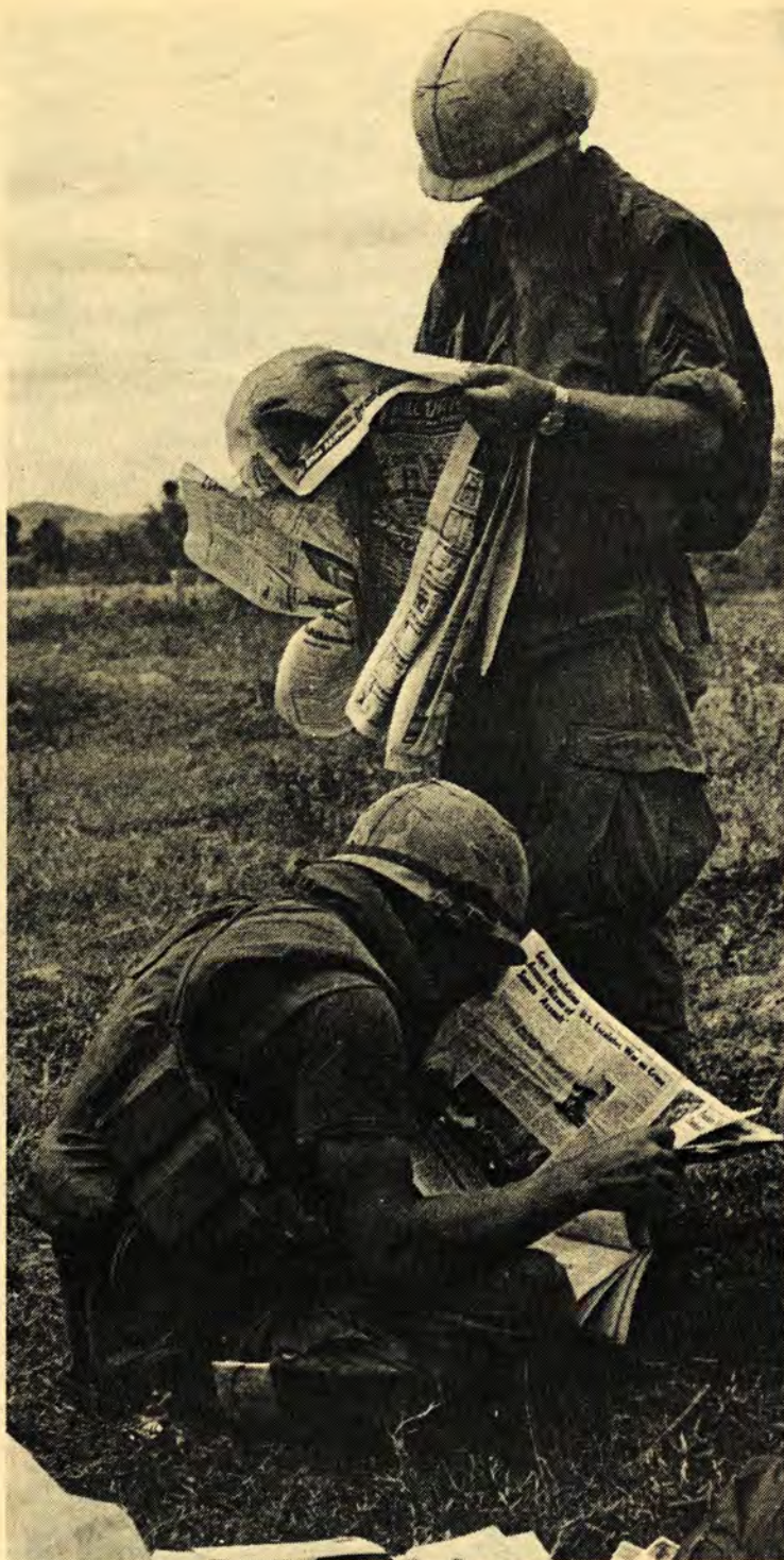
CHU LAI, (AMERICAL IO) -- Division soldiers of Delta Company, 1st Battalion, 52nd Infantry, 198th Infantry Brigade relax long enough to catch up on the news.