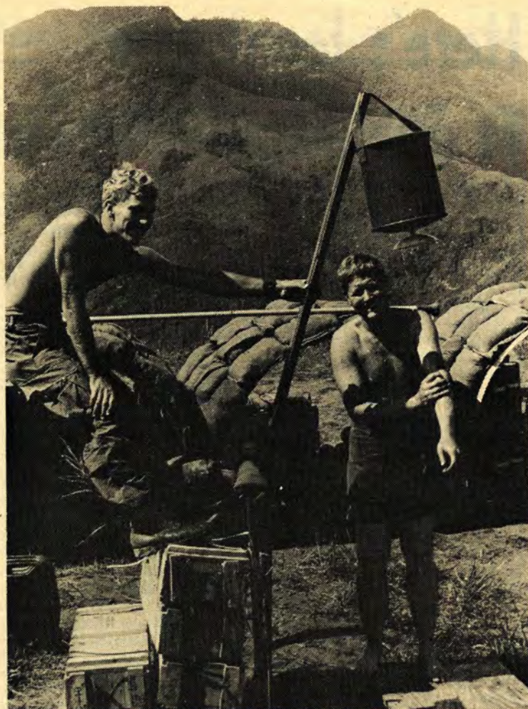
Necessity is said to be the mother of invention. Two Division soldiers from Delta Battery, 6th Battalion, 11th Artillery smile proudly as they put their new improvised shower to work.