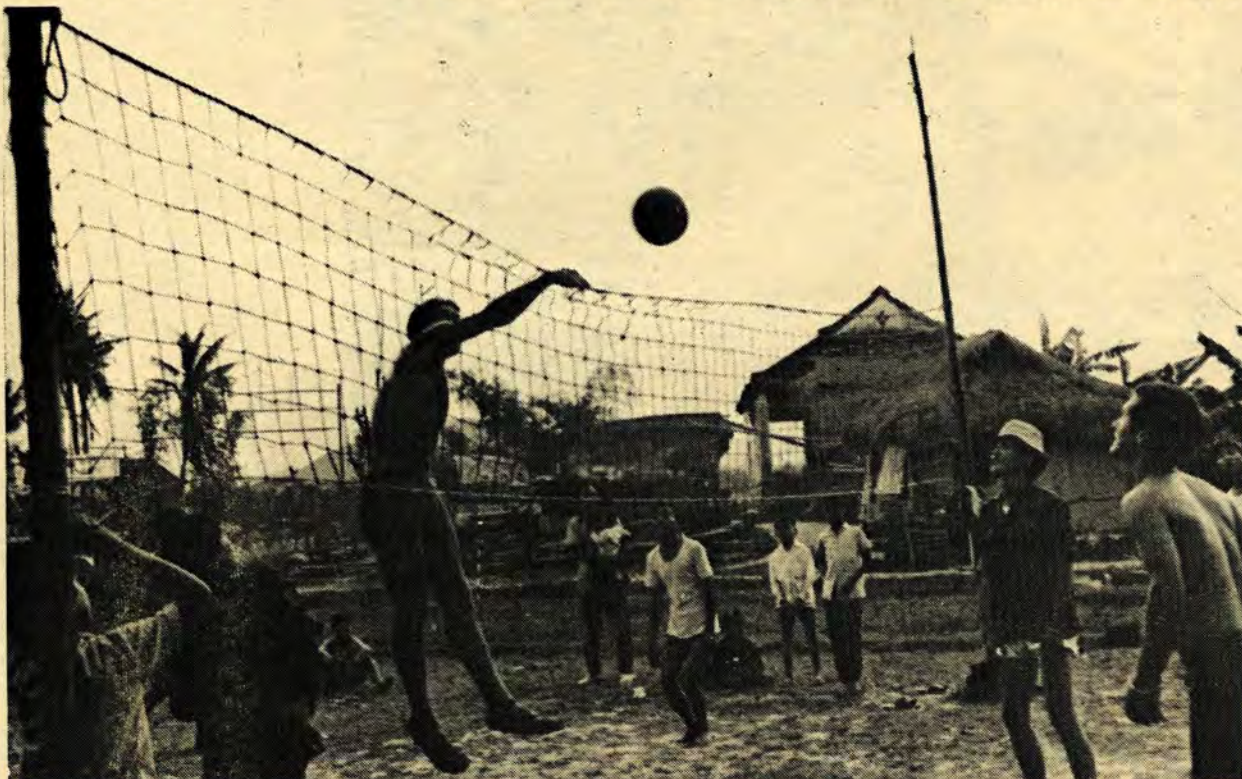
Soldiers of Company B, 1st Battalion, 20th Infantry play an after dinner game of volley ball with their Popular Forces counterparts. The PF and the 11th Brigade infantrymen provide security for the pacification hamlet two miles north of Duc Pho.

The people of Chi Trung will not go hungry and will have new homes thanks to the charity of their neighbors and the coordination afforded by MACV and USAID.