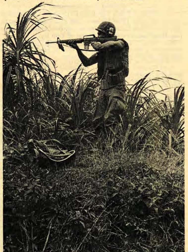
This infantryman of Delta Company, 1st Battalion, 52nd Infantry returns fire during recent action. He is a member of the 198th Infantry Brigade whose unit was working about 20 miles south of Chu Lai.