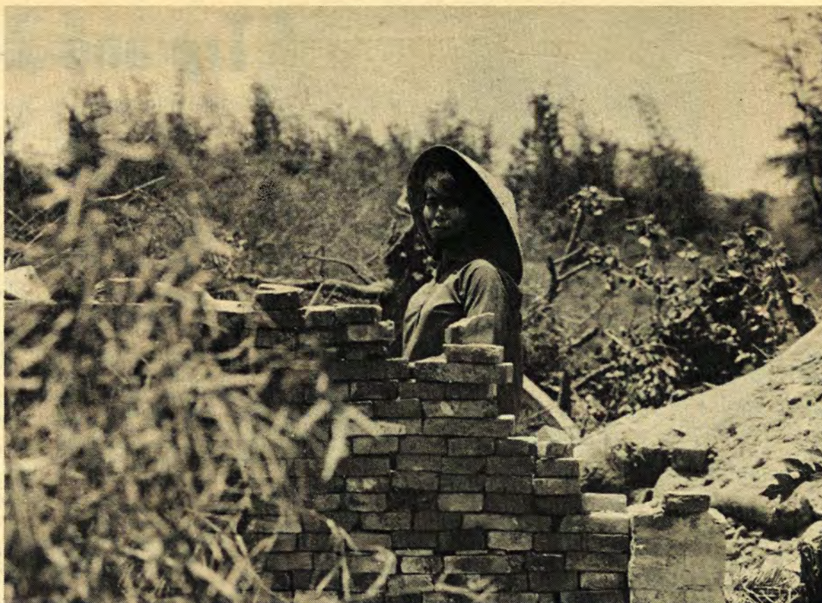
A Vietnamese women salvages bricks from the ruins of an old farm house near the village. Later she will use the bricks to build herself and family a new farm house.