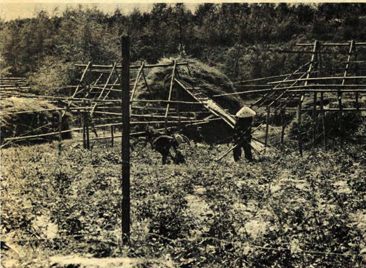
namese father and son work peacefully in their field. The farmers have been able to work t harassment from the enemy because the 1st Battalion, 6th Infantry is providing security for t.