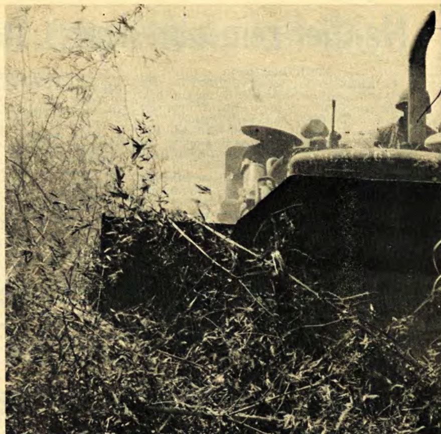
The big blade of a D-7 bulldozer pushes brush and trees before it is involved in a land clearing operation around the village. It was supplied by the 26th Engineer Battalion.