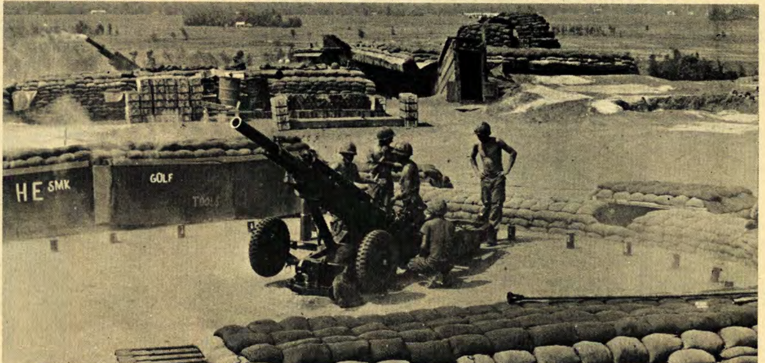
LZ HAWK HILL, (AMERICAL IO) -- Crew members of this 105mm howitzer stand ready to go into action on a moment's notice. The artillerymen, members of the Division's A Battery, 3rd Battalion, 82nd Artillery support infantrymen of the 196th Infantry Brigade from this fire support base north of Tam Ky.