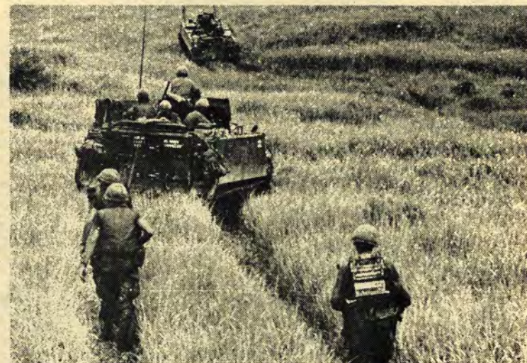
Infantrymen from the division's 1st Battalion, 46th Infantry, 196th Infantry Brigade and armored personnel carriers from the 1st Squadron, 1st Cavalry, work their way up a hill on a mission near Hiep Duc.