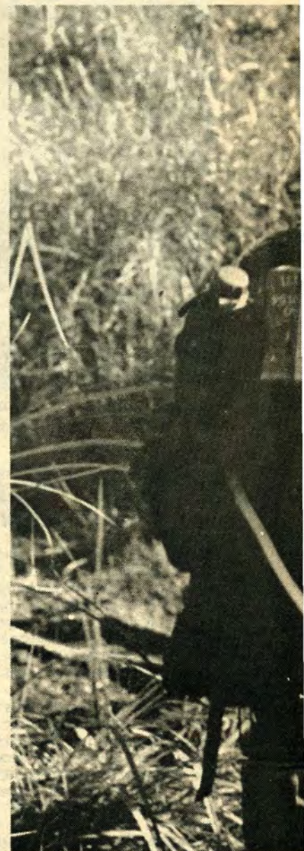
Charlie Company Infantrymen on a sweep and clear operation northwest of Tam Ky.