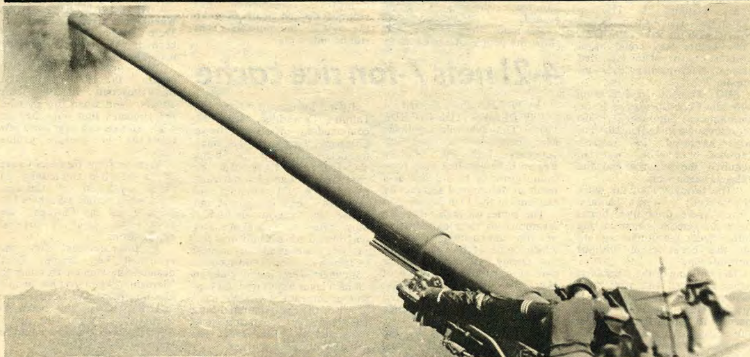
Division cannoneers brace themselves against the shock as their 175mm gun roars its defiance to the enemy.