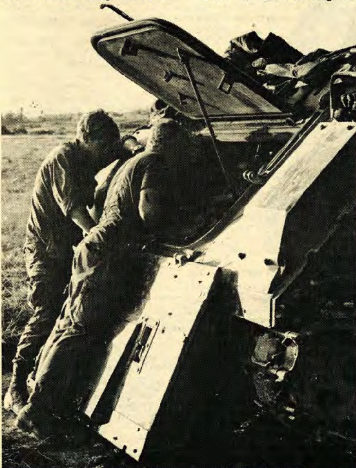
Two members of 3rd Platoon, Bravo Troop, 1st Squadron, 1st Cavalry attempt to trace the trouble of their APC while in a defensive position 10 miles northwest of Tam Ky.

The platoon blew the artillery round in place and continued moving toward their destination with Sgt McConnaughey, still walking point, a bit unnerved perhaps but still walking steady, according to the other platoon members.