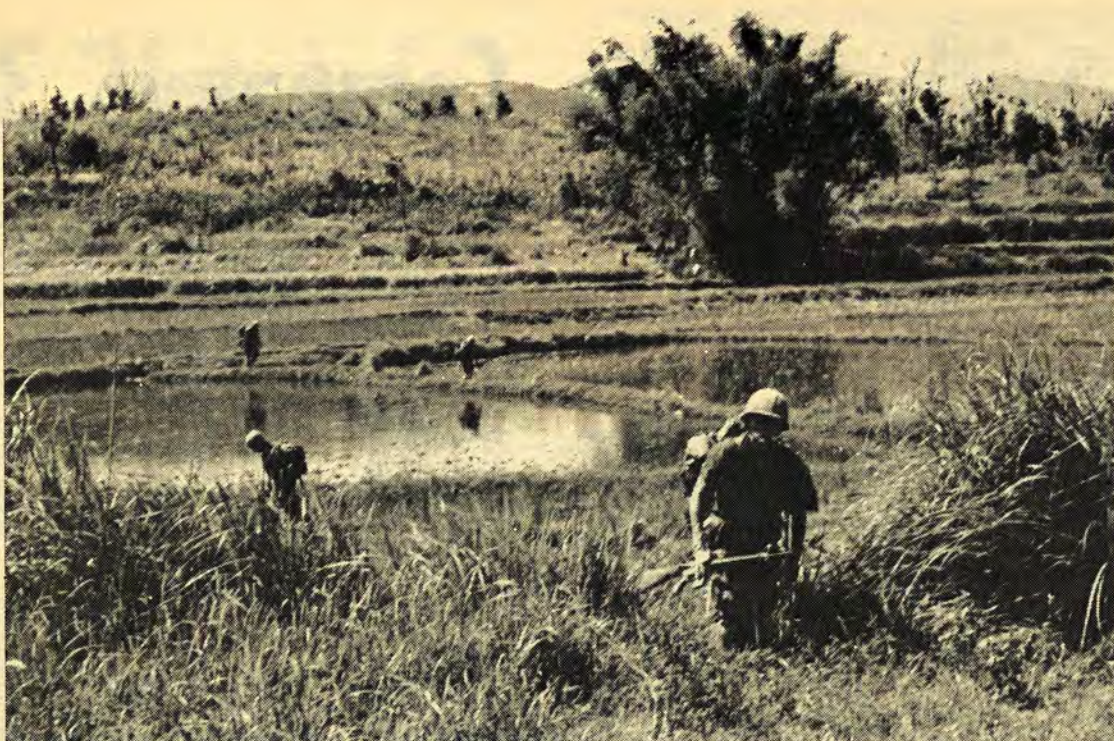
After humping all morning these division soldiers move into a day laager position south of LZ Siberia. The men are from Bravo Company, 1st Battalion, 46th Infantry, 196th Infantry Brigade.