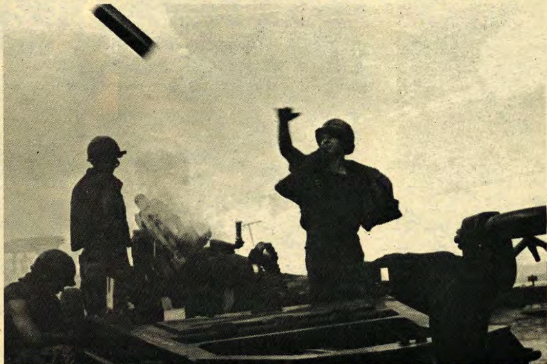
Keeping his gun pit clean during a fire mission, this cannoneer of Delta Battery, 1st Battalion, 14th Artillery, hurls a spent 105 millimeter cannister out of the parapit.