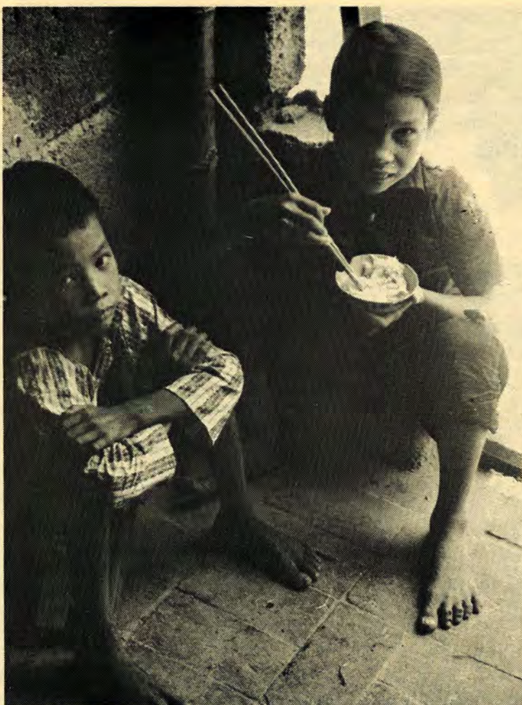
A young girl and her brother stare apprehensively at the camera as they eat a mid-morning bowl of rice in a hamlet 10 miles northwest of Tam Ky. The hamlet was used as a defensive position by two soldiers from B Troop, 1st/1st Cavalry and Regional Force troops.