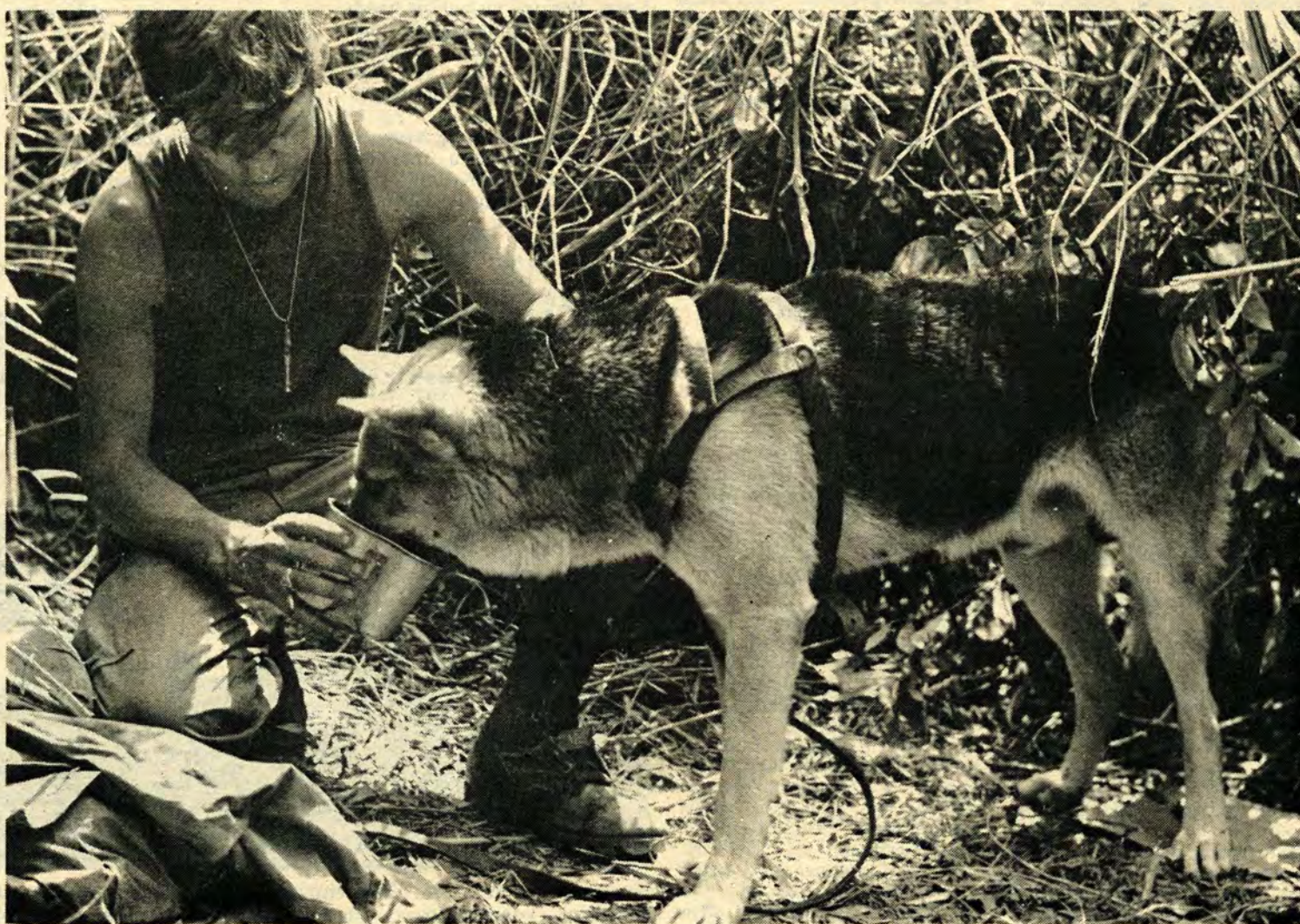
A member of the 48th Scout Dog Platoon gives his thirsty dog a drink. The scout dog team was working with Company C, 3rd Battalion, 21st Infantry, 196th Infantry Brigade.