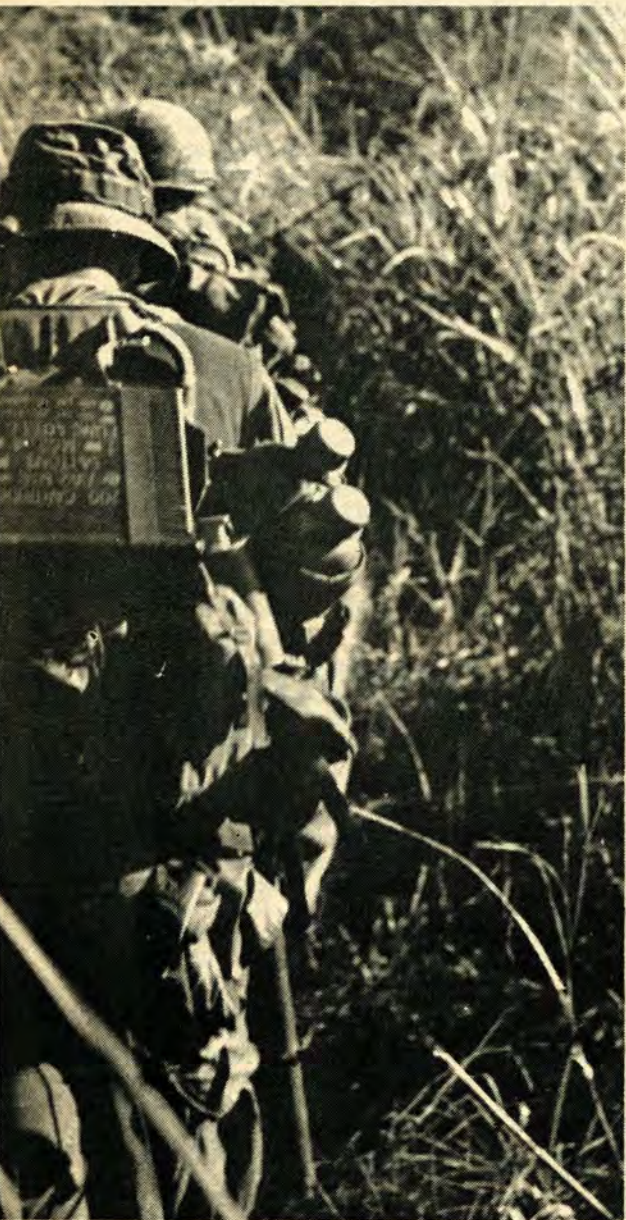
Members of Company C move out across an open field northwest of Tam Ky while on a sweep and clear operation.