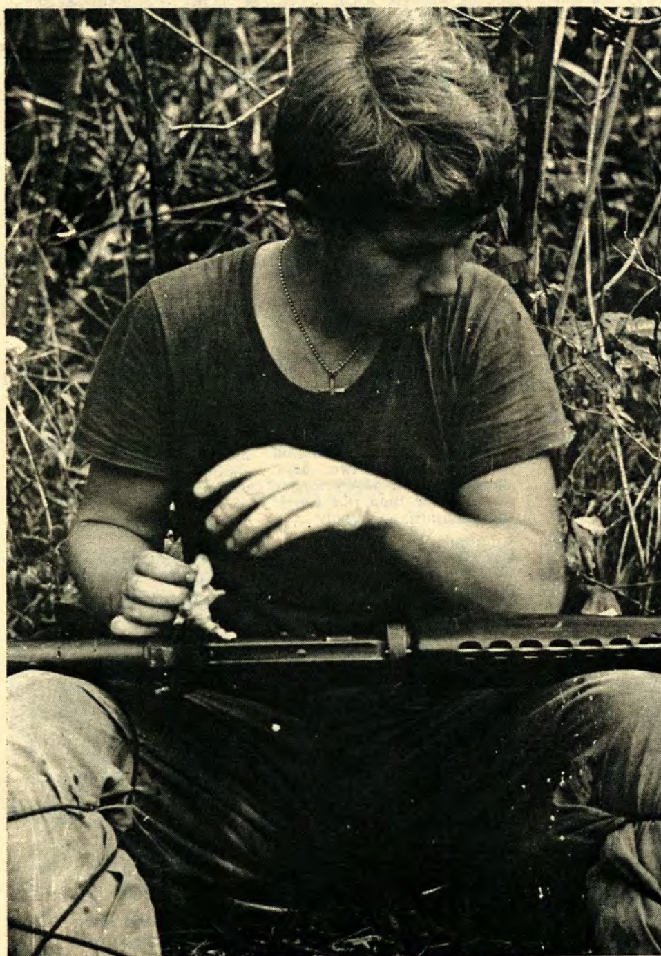
The infantrymen of Company C, 3rd Battalion, 21st Infantry, don't waste time during a break period. This "Tiger" is making use of a break to clean his M-16.