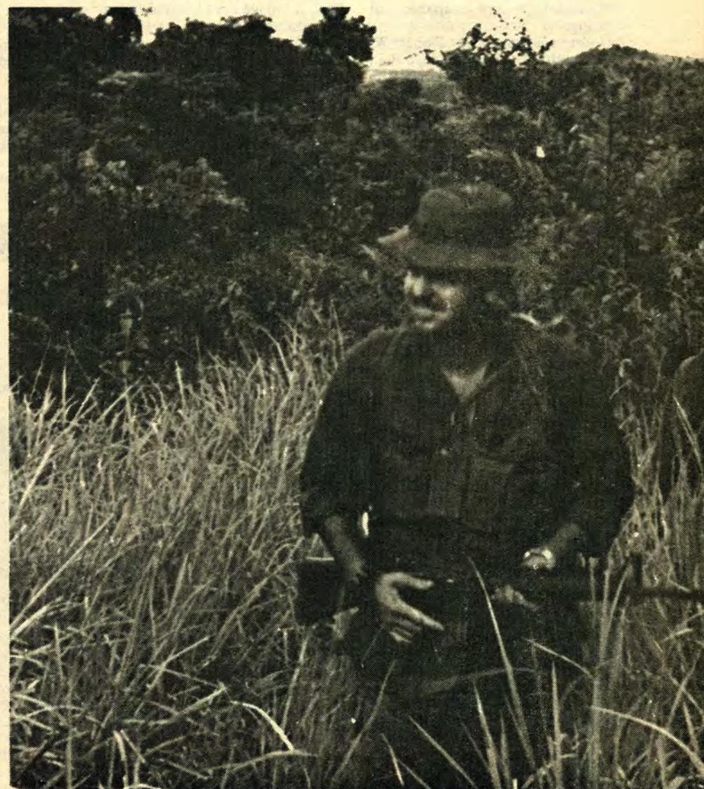
A "Tiger" on point is no exaggeration in the case of this "Gimlet" from Company C.