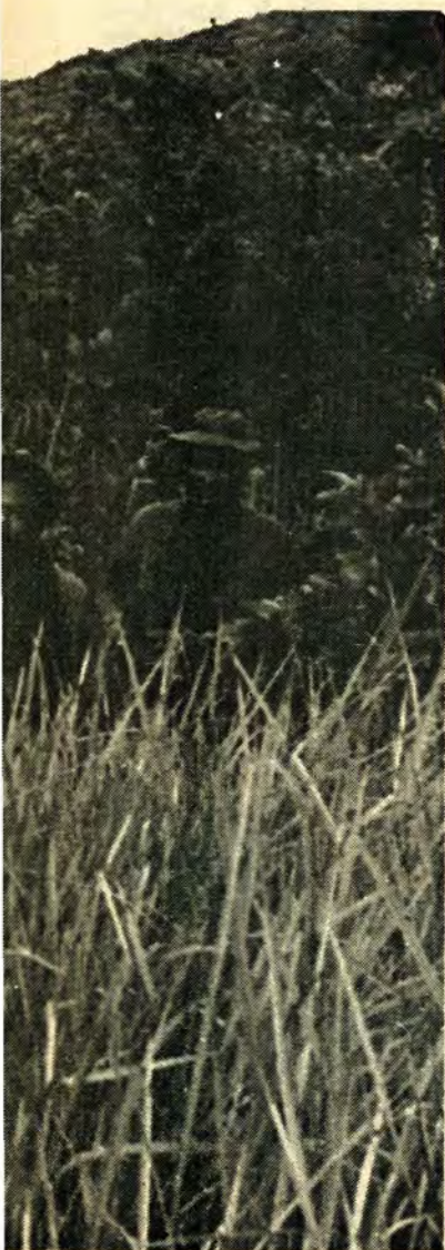
A member of the 48th Scout Dog Platoon gives his thirsty dog a drink. The scout dog team was working with Company C, 3rd Battalion, 21st Infantry, 196th Infantry Brigade.