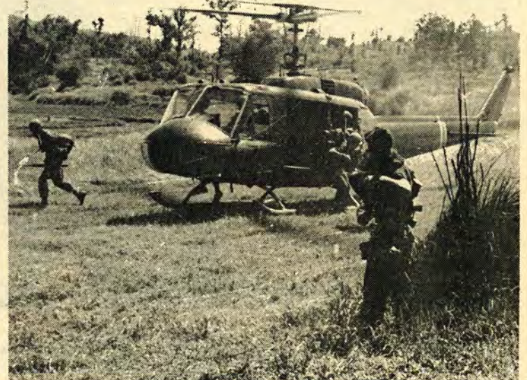
Division infantrymen make a hasty exit from the area after an insertion three miles south of LZ Siberia. The men were part of 1st Battalion, 46th Infantry, 196th Brigade on a search and clear mission.

The enemy's hard-learned lesson on noise discipline cost them a total of five killed, four detained, five rifles, 10 Chicom grenades and one knife.