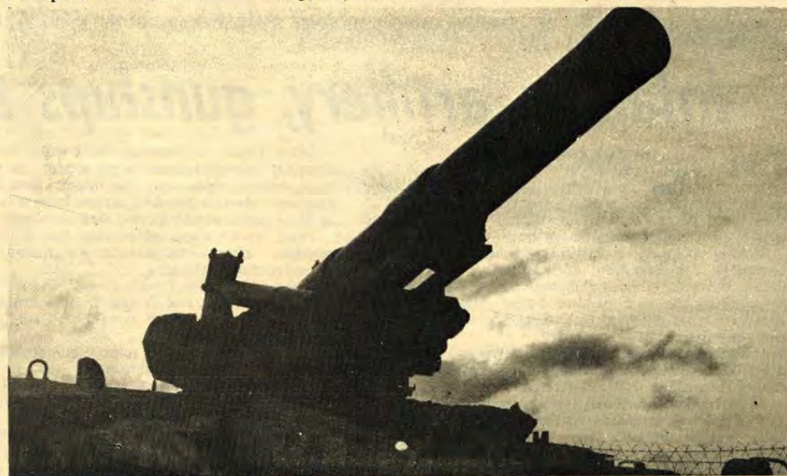
This eight-inch gun from Delta Battery, 1st Battalion, 82nd Artillery is silhouetted against the evening sky after a day of support to division soldiers.