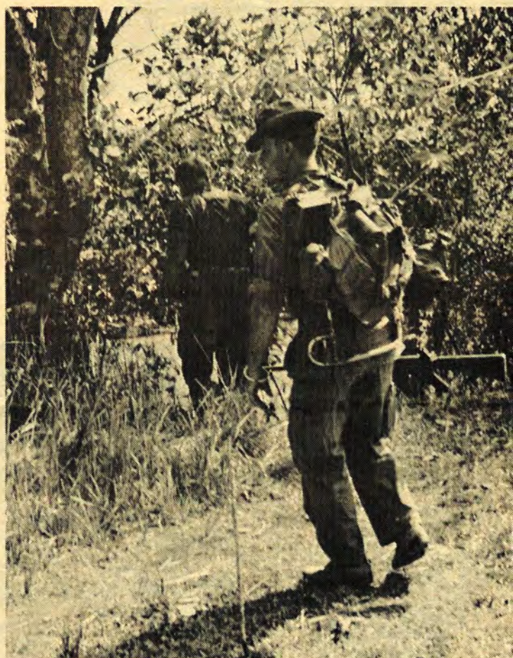
Two Americal Division soldiers from Company C, 5th Battalion, 46th Infantry search heavy brush for enemy bunkers 18 miles west of Chu Lai.