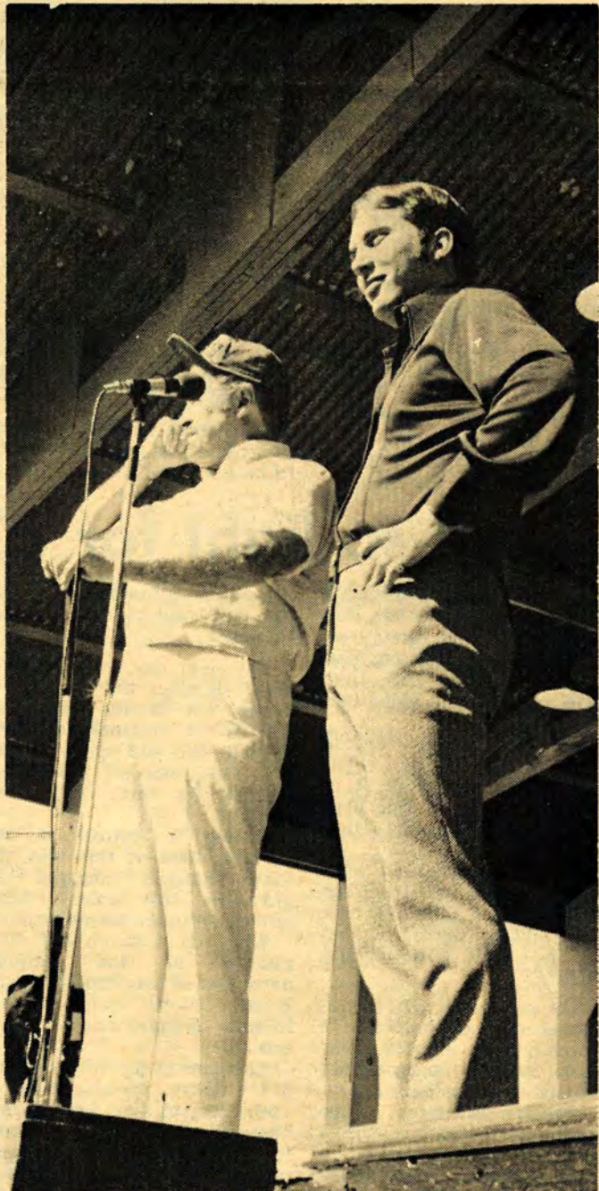
Johnny Bench, star Catcher, is presented for minority viewpoint