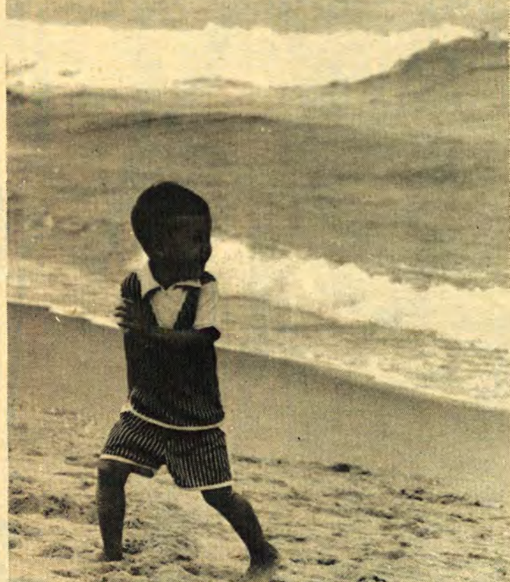
A young Vietnamese boy frolics on the beach of the South China Sea as he plays tag with a playmate.