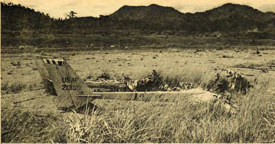
The wreckage of an Air Force OV-10 Bronco Forward Air Control plane haunts the air trip here at Kham Duc where the plane was destroyed by enemy fire when the strip was evacuated in May 1968.

It was difficult to tell whether he was talking about the children or about the soldiers.