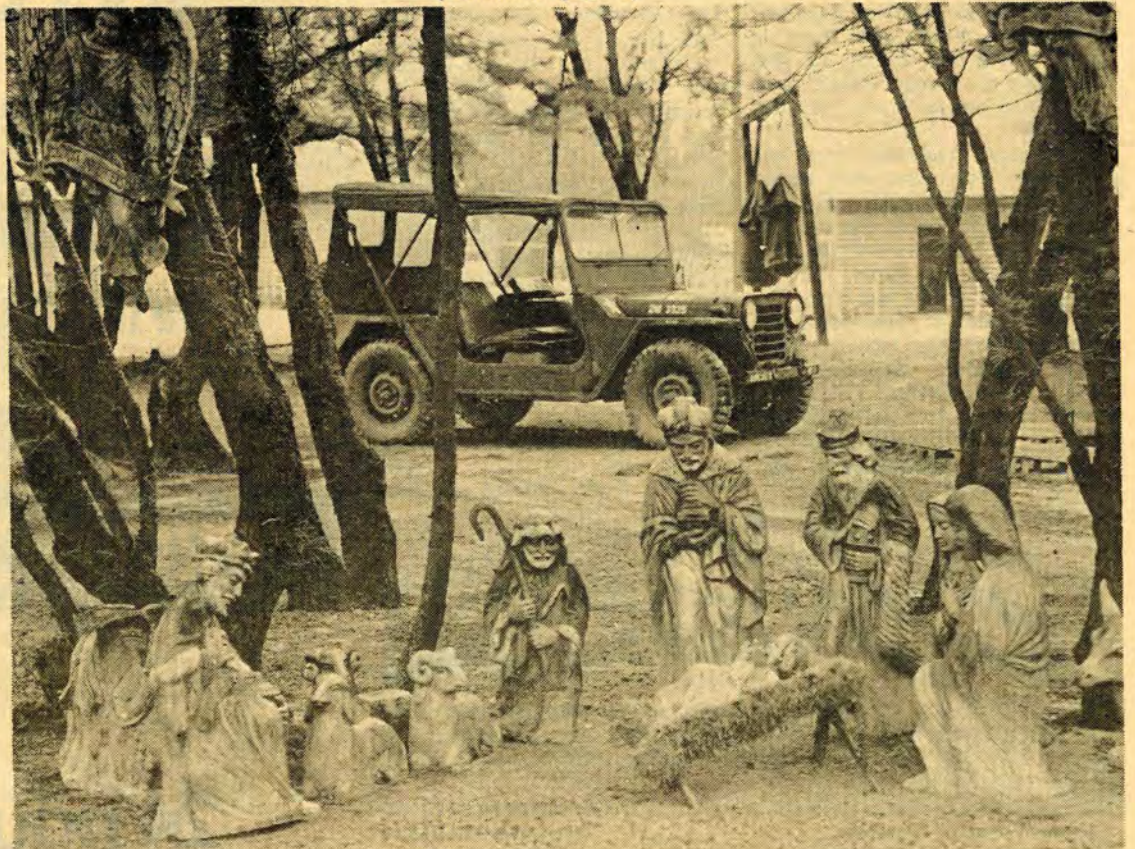
Christmas in Chu Lai, and at the 23rd Infantry Division Headquarters, a nativity scene conveys the message of the birth of Christ. It is doubtful however, He had a Jeep for transportation.