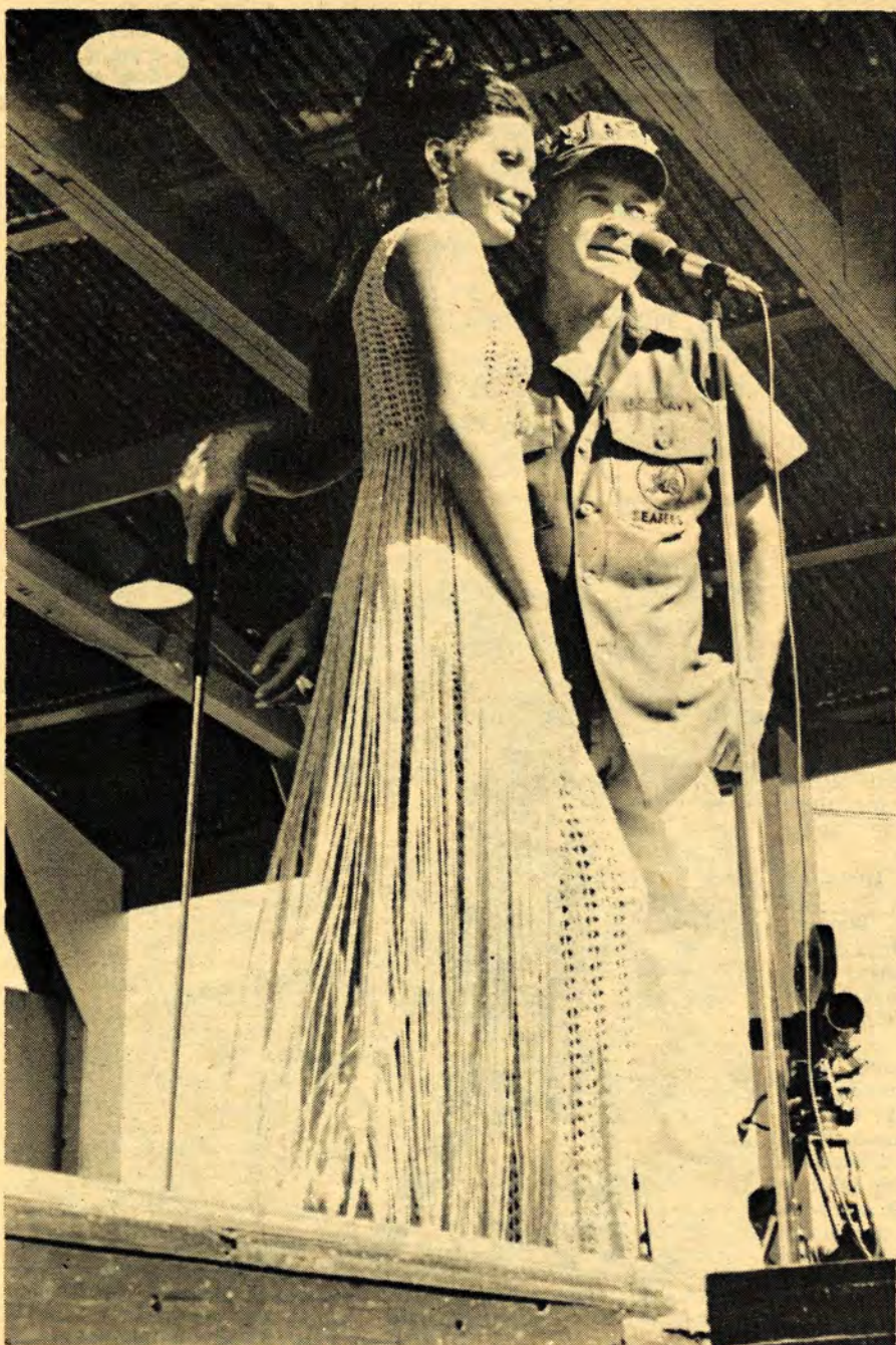
The old master with Miss World.