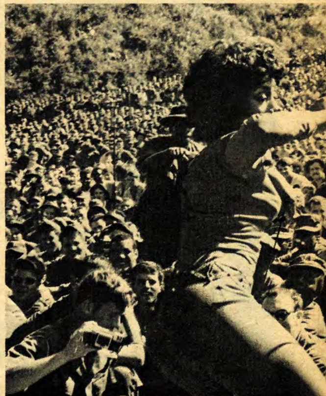
Lola Falana moves out into the crowd to help the guys