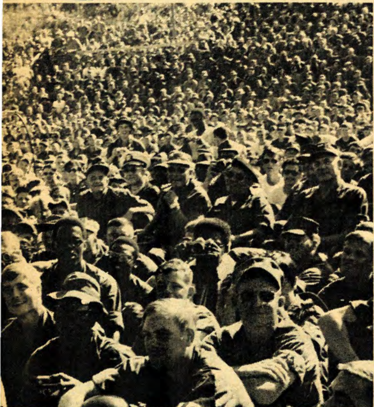
forget about the war, the girl back home and everything else.