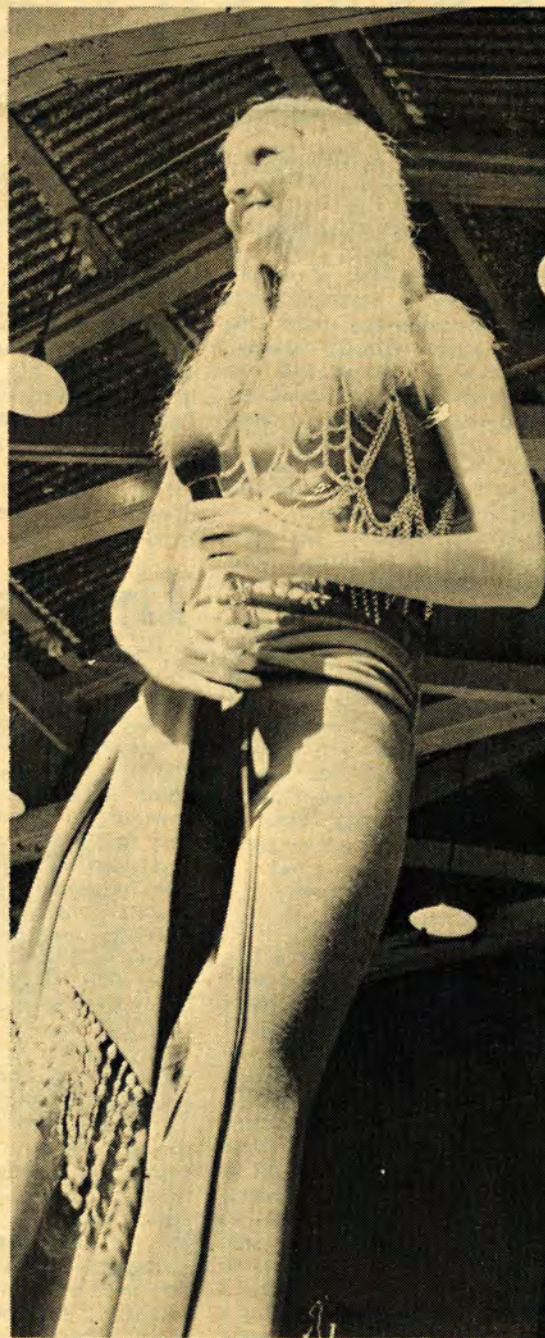
This is the number one ding-aling of the show.