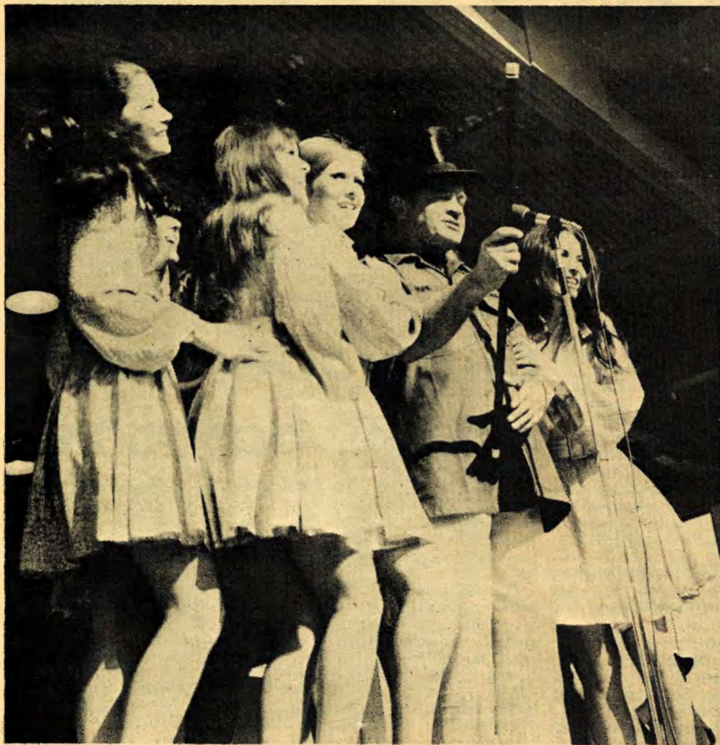
Bob Hope performs with the Gold-diggers