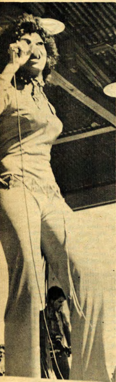
reactions: Lola Falana