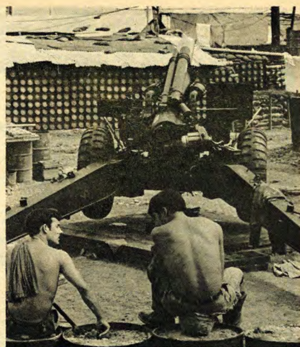
Time sometimes seems to drag on forever as "arty" men from the 3rd Battalion, 16th Artillery at Tien Phuoc wait for a fire mission.

During the search operation, the "Professionals" uncovered a small enemy storage shelter, which, upon closer scrutiny, yielded a sizable cache.