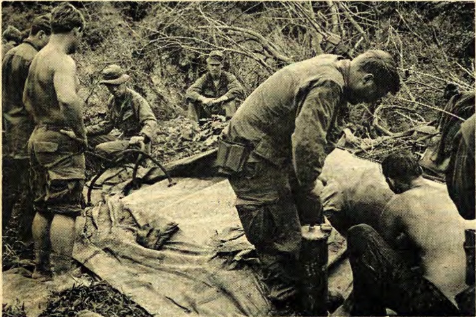
Soldiers from Company B begin to inflate the makeshift craft for their first try.