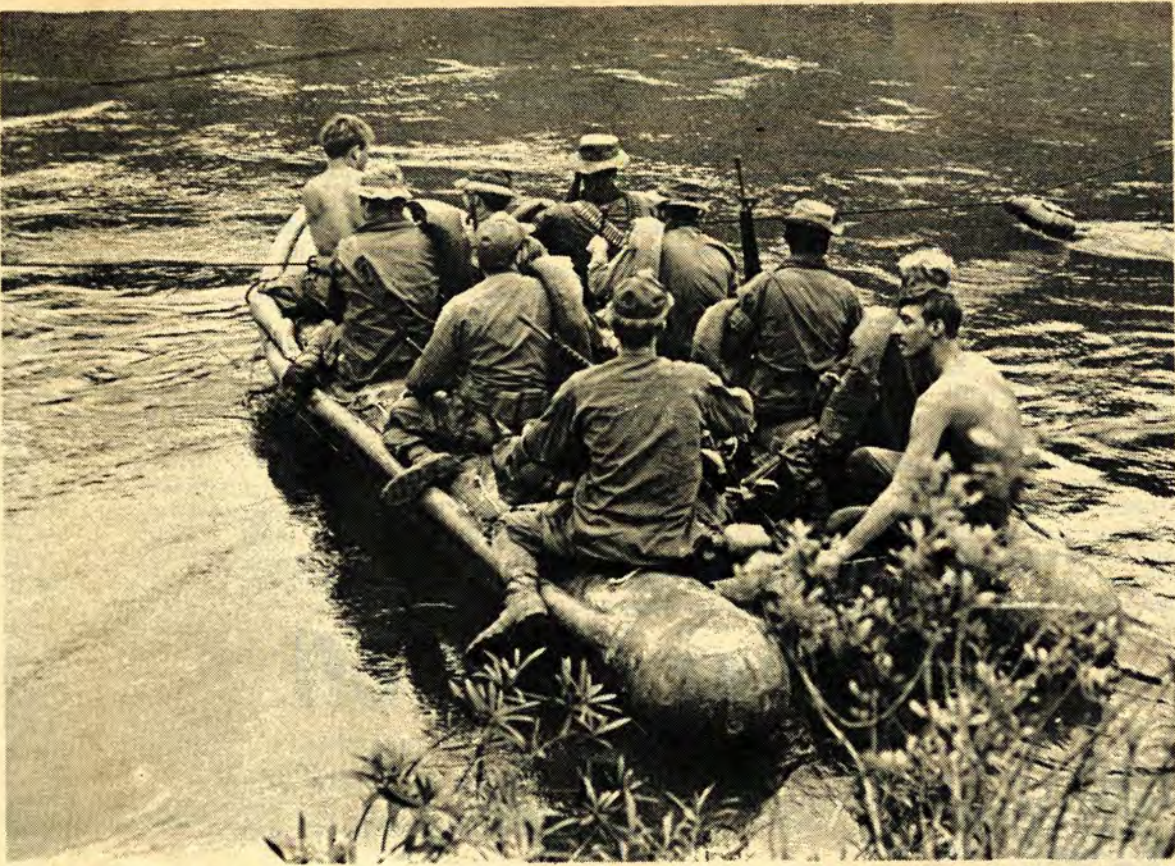
The launching of the "rubber ducky" is a success as she is swing-lined across the Song Ba Ky River with Company B.