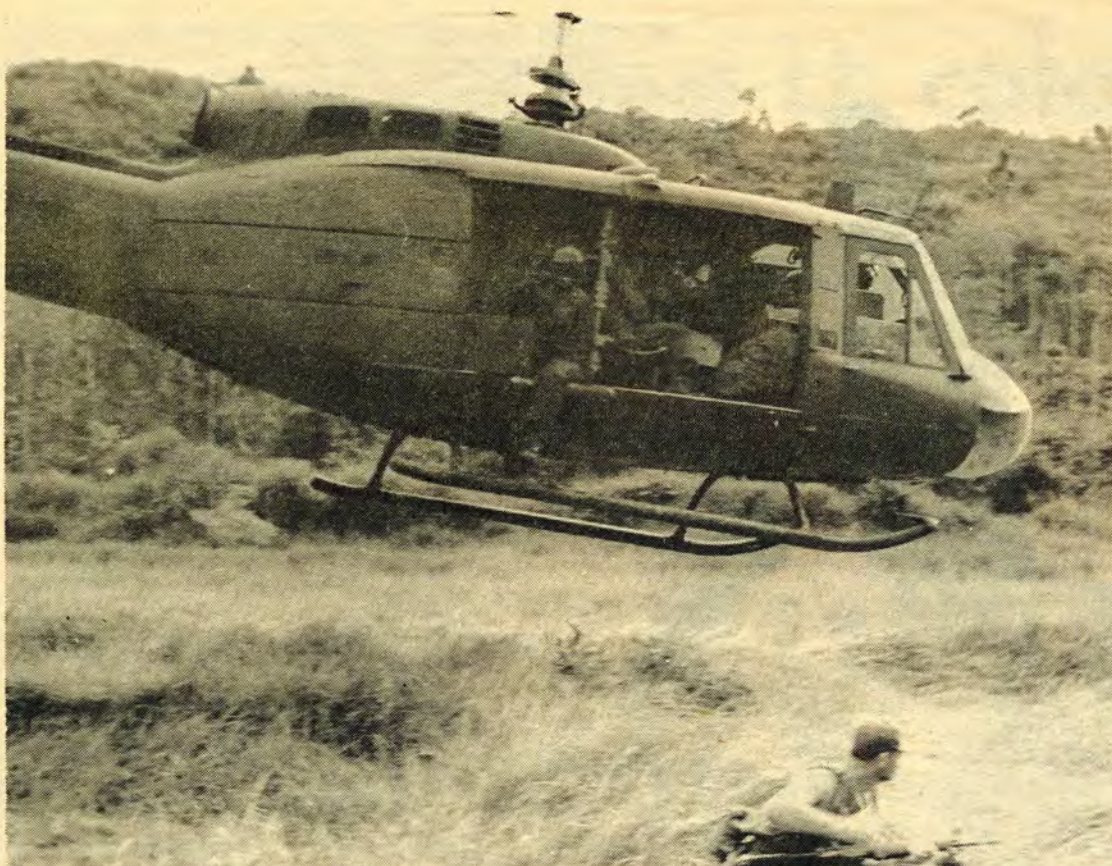
A helicopter from the 23rd Infantry Division lifts off after dropping supplies to a company of infantrymen in the field.