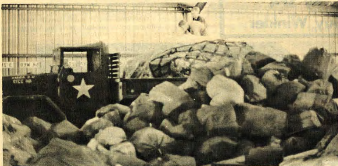
This shows you how much trouble you guys caused the postal types during Operation Reindeer Express.

Glancing at the sparse remains of the once gargantuan stack of mail, it was obvious that Operation Reindeer Express didn't disappoint anyone.