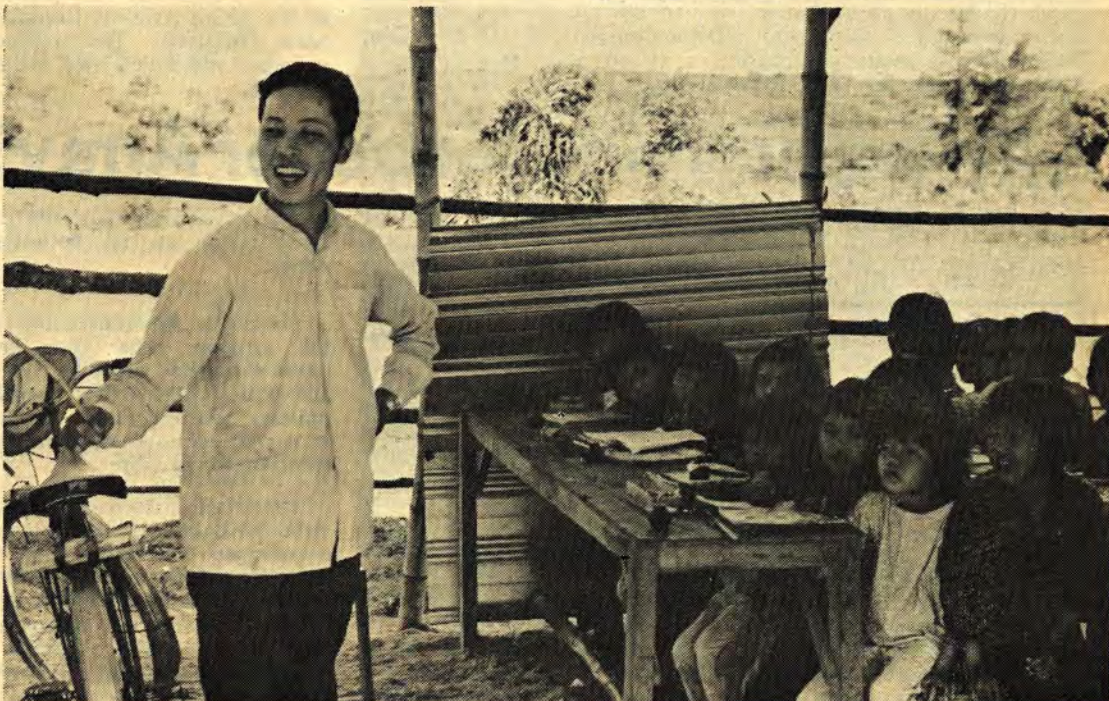
In this open air Vietnamese classroom reading, writing and arithmetic seem to be taught to the tune of the bamboo stick.

WASHINGTON (AFPS) - Some 14,000 Vietnam-era veterans were appointed to Federal civilian jobs from January through June, 1970. The majority were employed through regular Civil Service competitive procedures which provide preference for veterans.