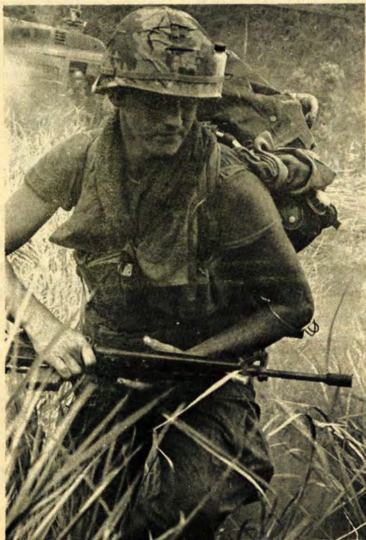
A 23rd Infantry Division soldier from Company A, 4th Battalion, 31st Infantry moves out during a sweep and clear operation northwest of Tam Ky.