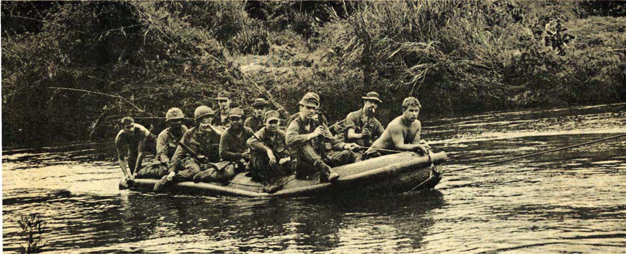
The rubber ducky holds up well transporting part of the company across the river. Who says the bush can't be fun?