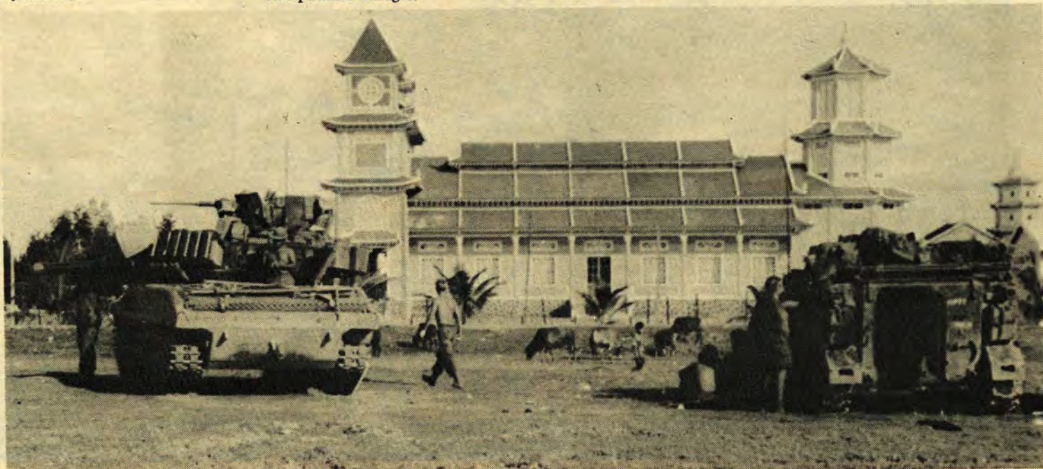
The crews of a Sheridan Tank and an APC take a break near a Buddhist temple during a halt in a recent operation conducted by Troop A, 1st Squadron, 1st Cavalry in Quang Tin Province.

The efficient Company D team secured by the local Vietnamese forces turned a footpath into a roadway for supply and local use by the villagers traveling between the two pacified villages.