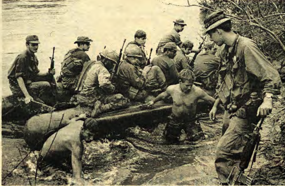
The engineers pull the ducky to shore with soldiers of the company after crossing the river.