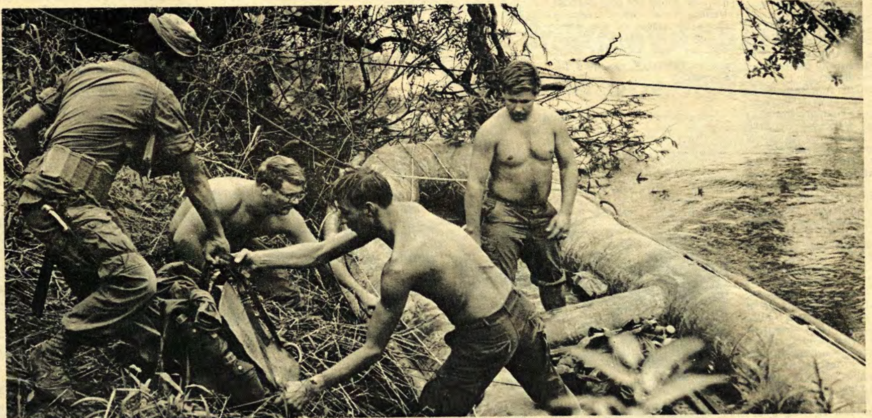
The rubber raft gets loaded in preparation for its mission fulfillment.