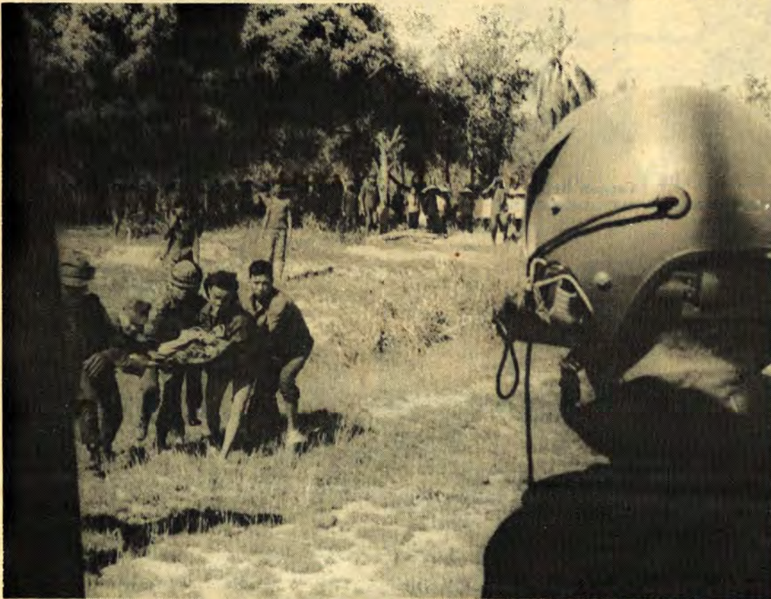
Dashing towards the Medevac chopper from the Americal Division, these ARVN soldiers carry a wounded comrade to be flown back to Chu Lai for hospitalization.

The "Regulars" of the 1st Battalion, 6th Infantry killed one enemy and detained three during the week. Several weapons and a rice cache were also confiscated.