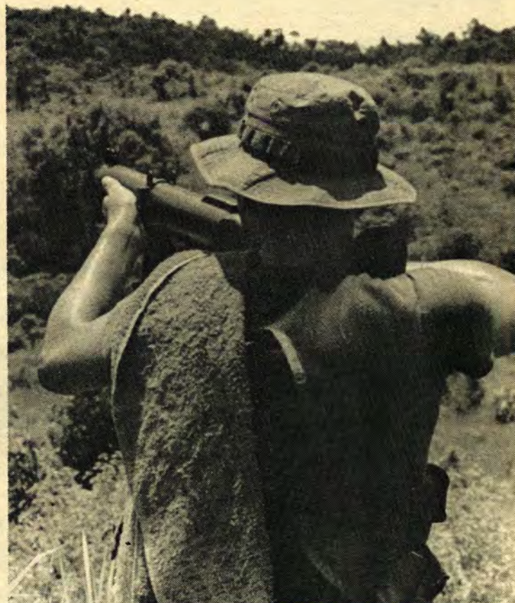
A soldier from the 23rd Infantry Division sets his sights of an M-79 grenade launcher toward a suspected enemy position.

There are times between missions, however, when waiting seems to never end as time drags on for hours and sometimes days before the call is received for artillery support.