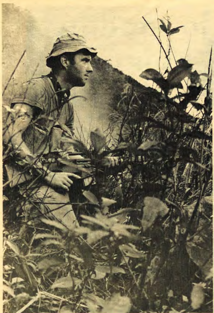
This infantryman from Company C, 4th Battalion, 31st Infantry makes his way through some high grass during a combat assault into a VC position during a recent operation in the 196th Infantry Brigade.