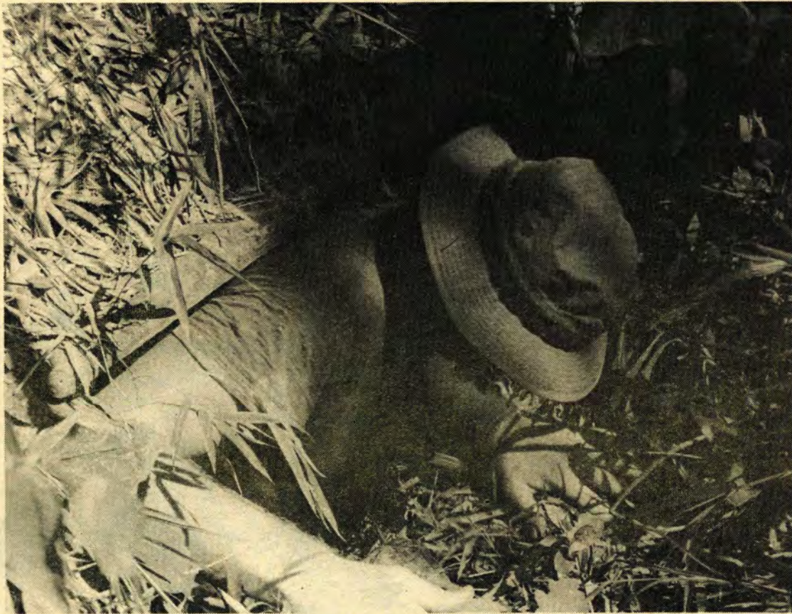
One more enemy tunnel complex will soon be put out of commission following its search by elements of the 23rd Infantry Division. Here a rifleman makes his exit via what had been a well-concealed escape hole leading into the underground hideout.