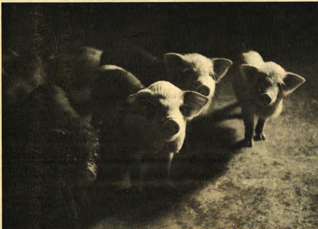
After a close-up look, could you eat anything as cute as these piglets? It depends on how hungry you are. These are going to feed village orphans.

The list is not complete, but it is a good sampling of the current vocabulary used in Vietnam. As previously mentioned, the jargon is constantly changing and possibly becoming more definitive. THERE IT IS.