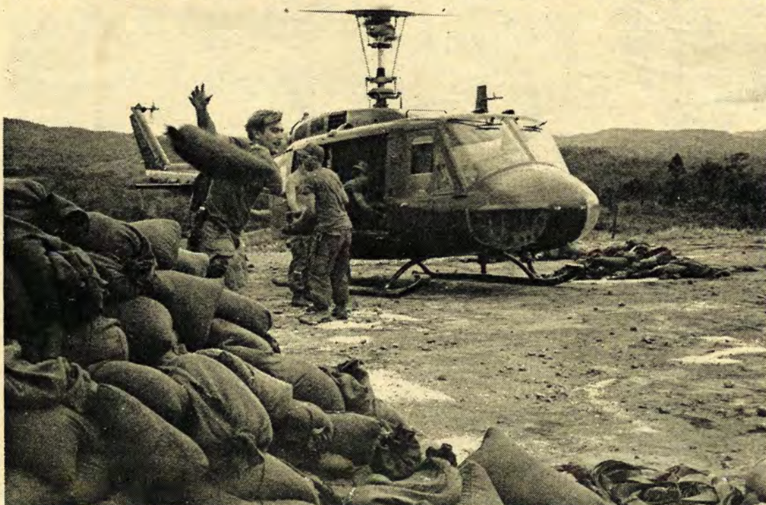
Soldiers of the 196th Infantry Brigade unload sandbags of salt, which represents only a fraction of the 17 tons of salt captured by Company A, 1st Battalion, 46th Infantry