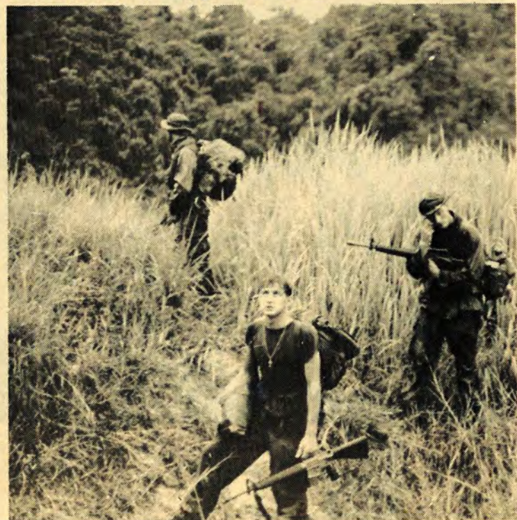
Infantrymen of the 23rd Infantry Division secure a landing zone for a fast approaching helicopter bringing supplies to a line company operating Northwest of Chu Lai.