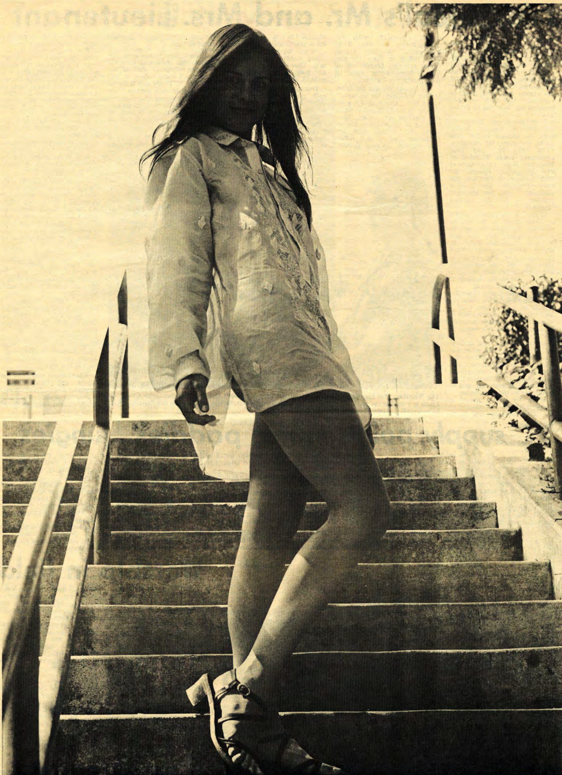
The doll in the picture is June Fairchild who plays Sonny in MGM's current release, "Pretty Maids All In A Row". If the flick ever gets to the big Nam, you can see more of her. February 5, 1971