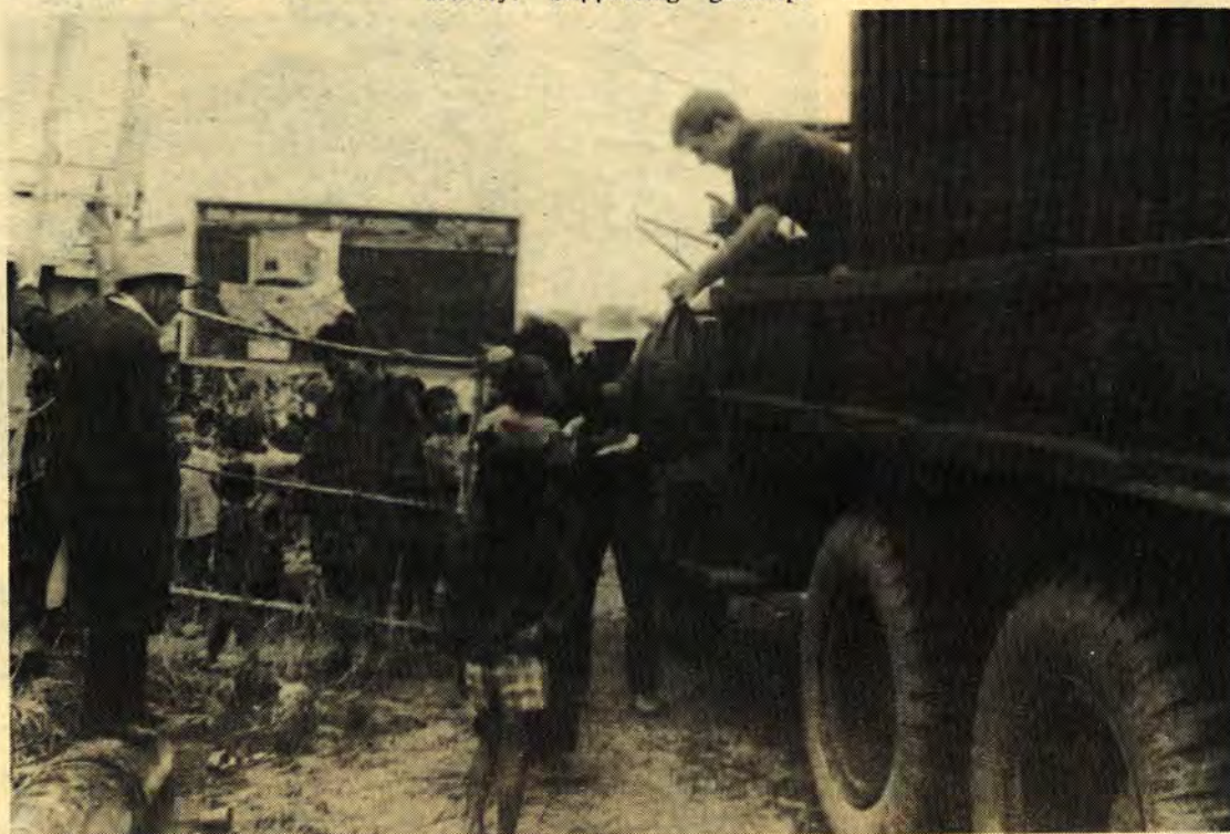
Recently, when the rains came, causing floods and flood victims, somebody remembered to help out. These Americal soldiers distribute bags of rice to flood victims a few miles north of Duc Pho.

That made the enemy toll for the entire hamlet search ten enemy killed and six captured.