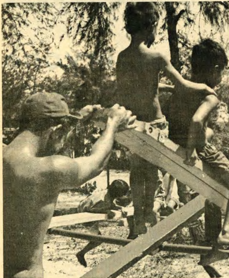
It doesn't take the kids long to figure out the mechanics of see-sawing when a GI is around to lend a hand. Ky Khong School, near Chu Lai, is the site of the new playground which received hundreds of child hours of use the day it was set up.