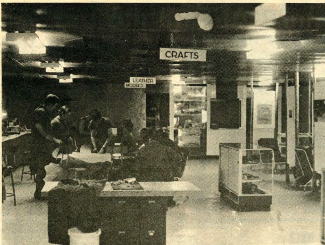
Division soldiers work on different projects in the craft shop. Many varied areas of interest are offered.