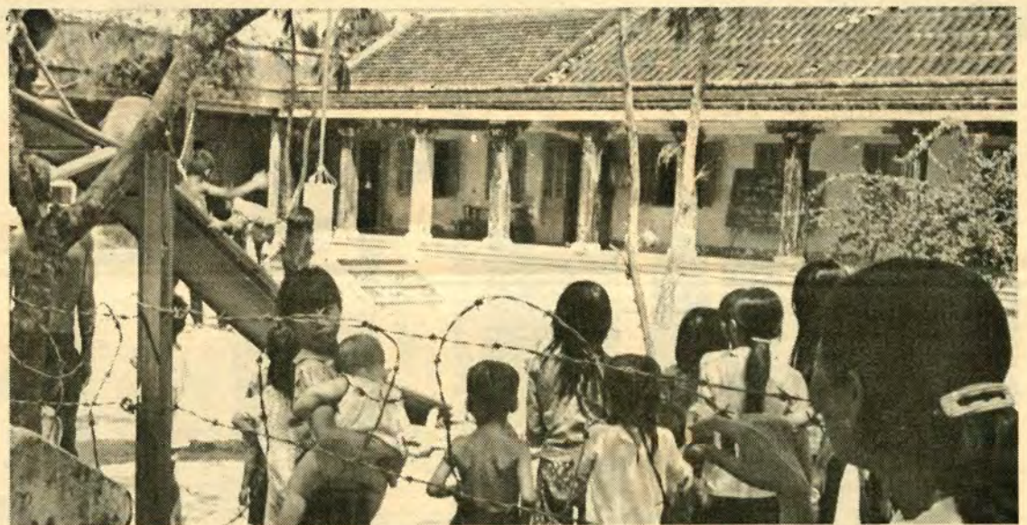
Mommasan watches her children join the gang to test the new slide. The slide is part of a set including see-saws, a merry-go-round, swing and monkey bars. This was the second of ten playground sets being prepared for public school children in the area around Chu Lai.