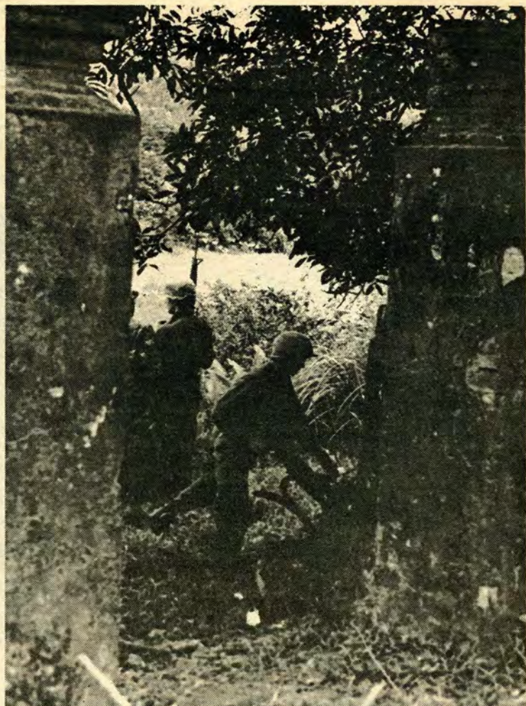
Twenty-third Infantry Division infantrymen inspect a deserted ville southwest of Tien Phuoc during a recent patrol through the area. The troopers are with Delta Co., 2nd Bn. 1st Inf.

The entire fire-fight had lasted only a few minutes, but during that time the recon unit had served in many capacities, from patrol, to attack force, to rescue squad. In an ever changing war, the men "who do not die" had proven their adaptability.