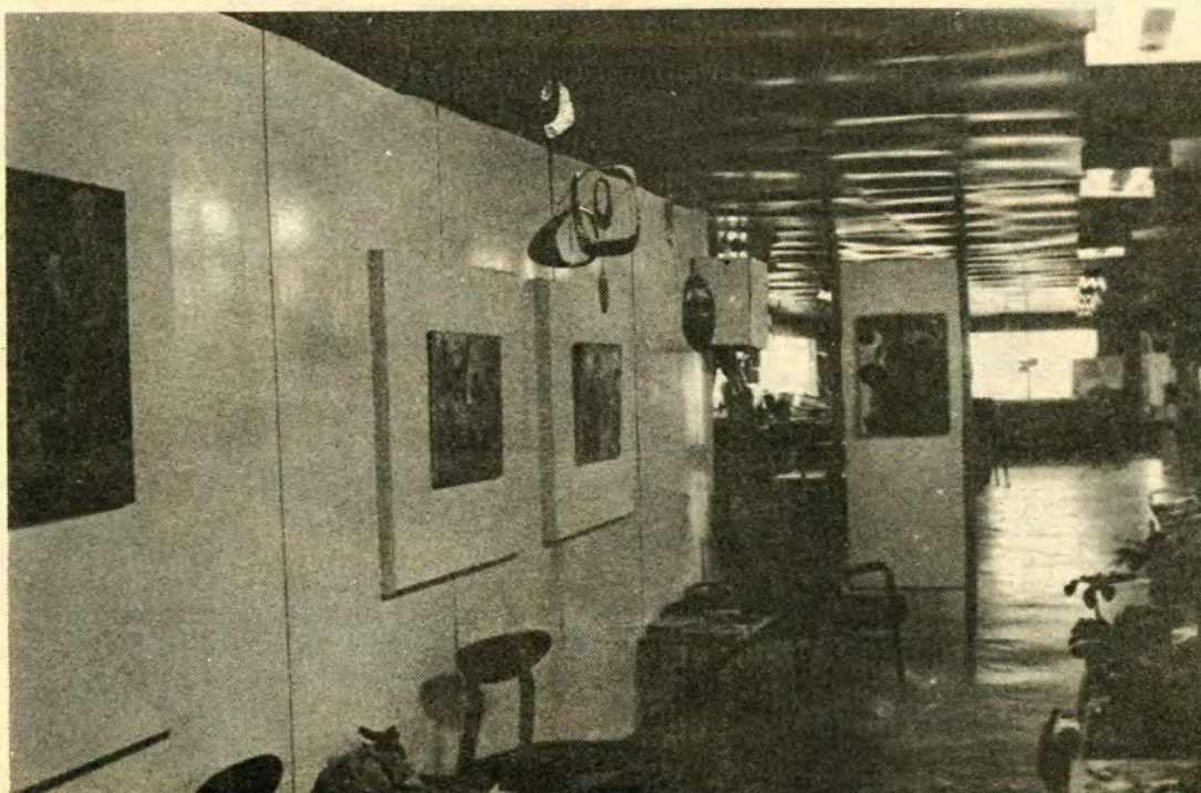
The combination lounge-gallery is a good place to sit and relax, Craft magazines are available and works of art by 23rd Division soldiers are on display.

CHU LAI (23rd INF DIV IO) -- Keep your cool and do something constructive, try the air-conditioned Chu Lai Special Services Crafts Shop.