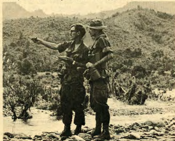
A platoon leader of Charlie Co., 5th Battalion, 46th Infantry, 23rd Infantry Division makes a point from his map during a recent operation in the Ky Tra Valley.