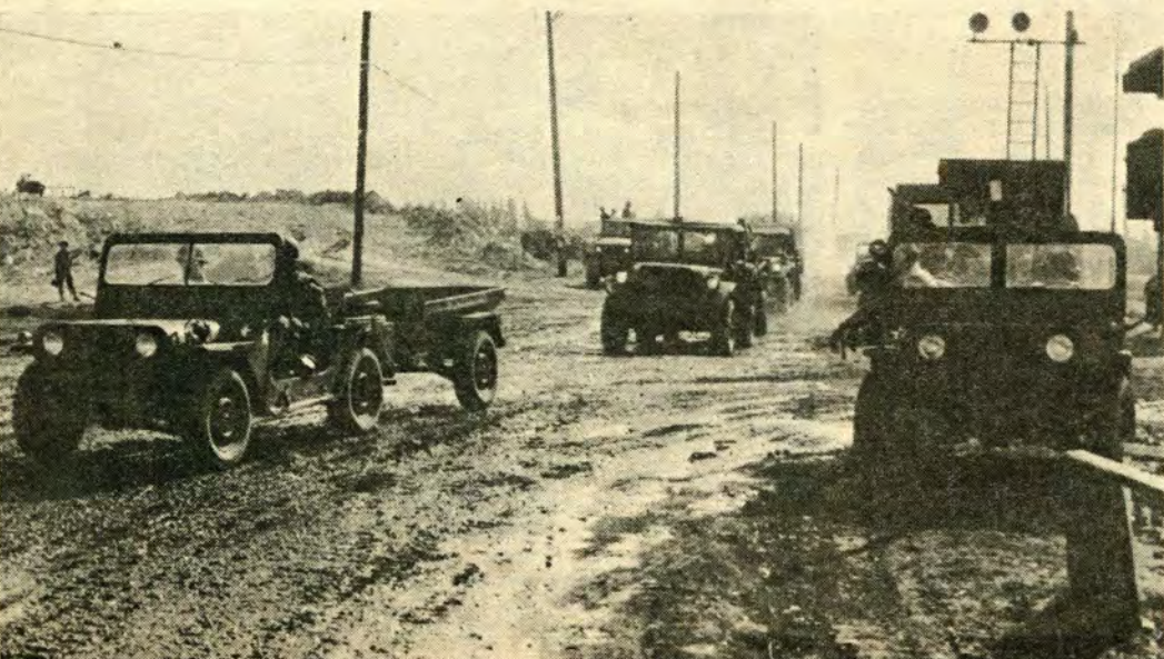
The last of the convoy makes it's way to the gate and "on to Da Nang".