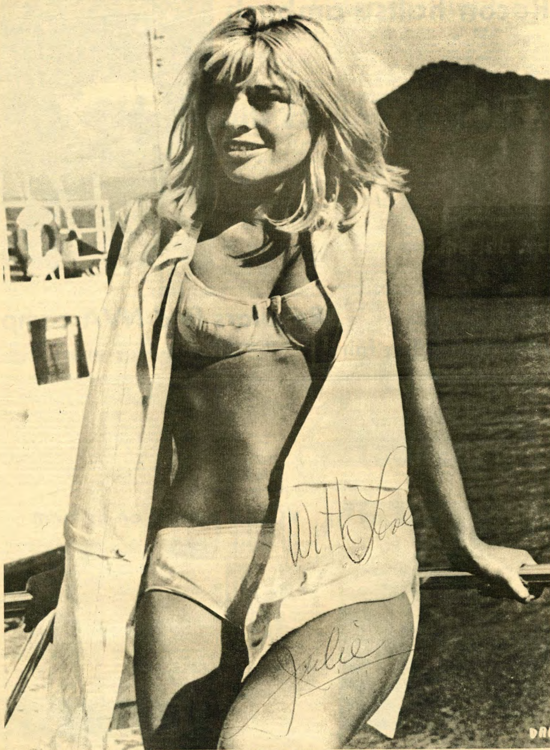
Beautiful, curvacious Julie Christie currently starring in "The Go-between", has performed in many a moving picture. We thought you might appreciate seeing her in an 'un-moving' pose. June 11, 1971