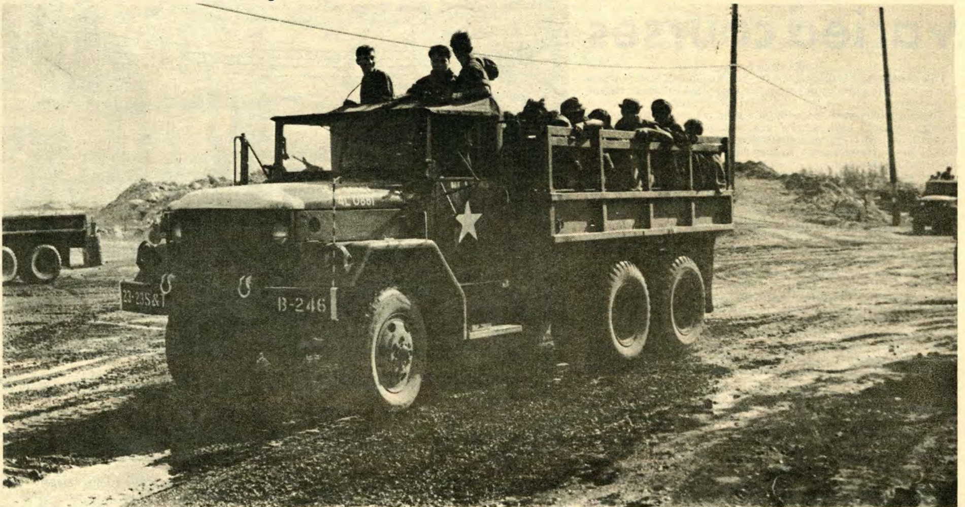
A truck load of men from 5/46 take a last look at Chu Lai as they begin their trip to Da Nang.