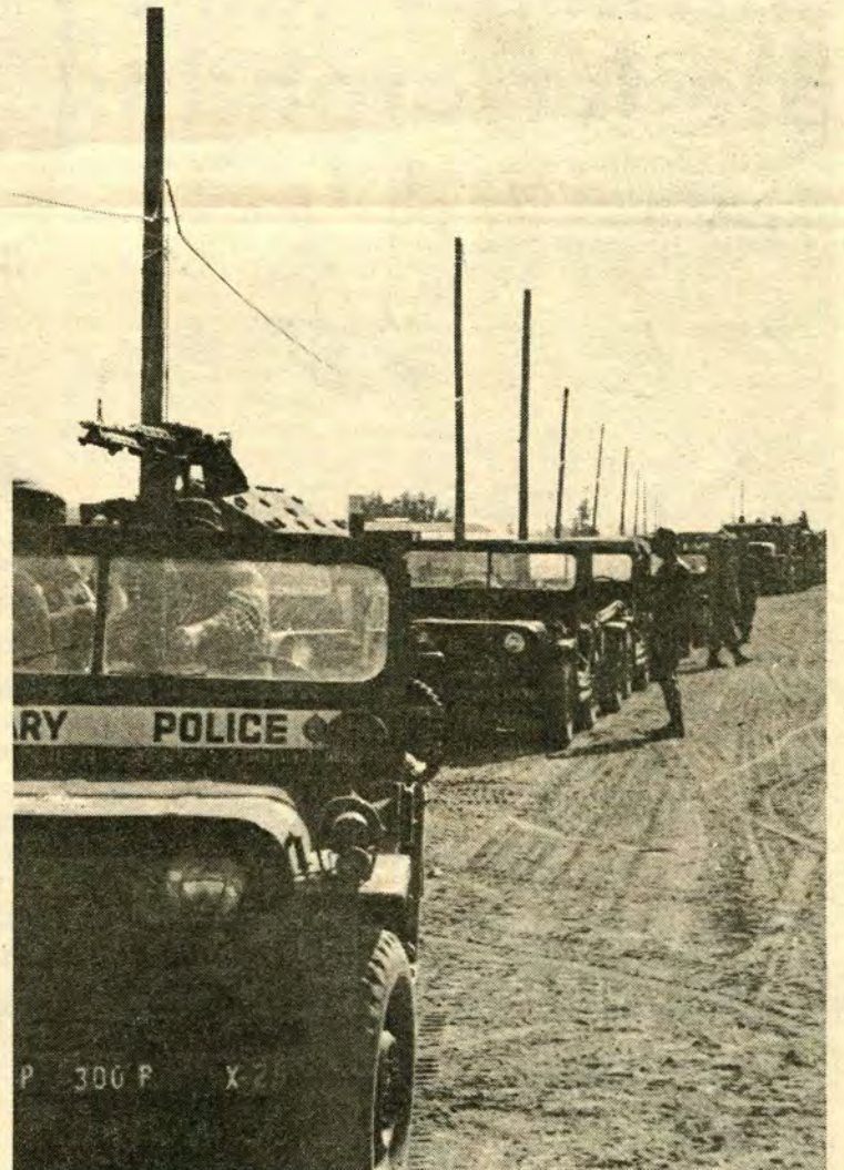
The endless line of vehicles and equipment belonging to 5/46 begins to form up just prior to departure for Da Nang.