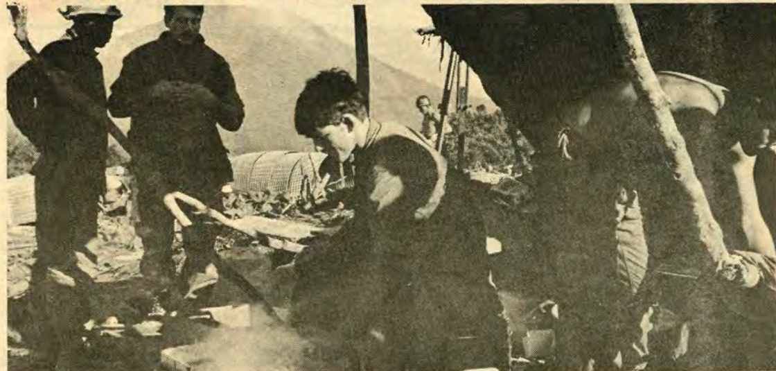
These cooks make the best of their facilities to provide a hot and nourishing meal for the troopers of Charlie Company, 2nd Battalion, 1st Infantry, 196th Infantry Brigade recently operating near Hiep Duc.

from getting the men their R&R and ETS orders. "I'm just glad I could do something constructive," he said smiling.