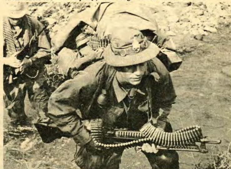
An M-60 gunner of Charlie Co., 5th Battalion, 46th Infantry, 23rd Infantry Division totes his "Pig" through a shallow stream during a recent operation in the Ky Tra Valley.

If it takes much longer, we can start looking for the Grand Opening of the Rawhide Hilton, built of course, by the Combat Engineers of Alpha Company, 26th Engineers Battalion.