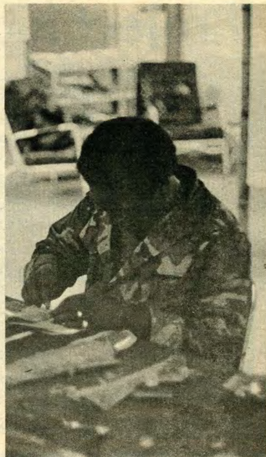
A soldier works on a pair of leather moccasins in the leather department of the Chu Lai Special Craft Shop.