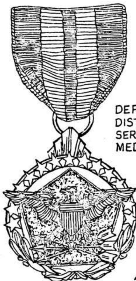
DEFENSE DISTINGUISHED SERVICE MEDAL

13 September.... Three individuals dressed in green and carrying packs returned fire after being engaged by elements of Delta Company operating near the southern rim of the Rice Bowl. The three VC evaded successfully.