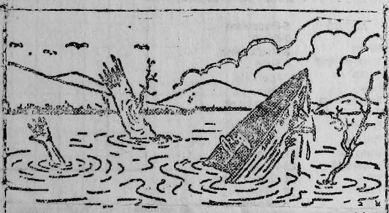
"Climax of a bad trip..."