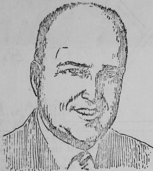
MELVIN R. LAIRD