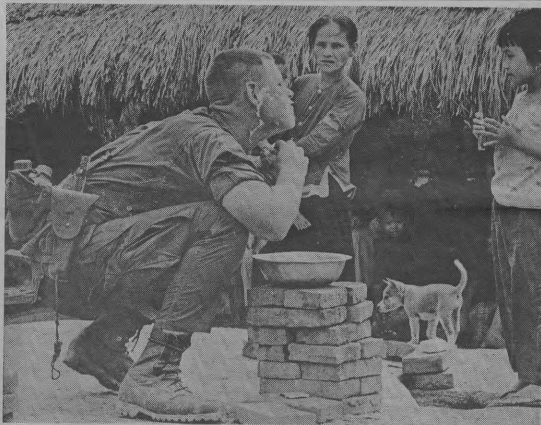
STOOP TO CONQUER — A Vietnamese child holds a mirror for a Marine, enjoying a rare morning shave in the field during Operation Union, May 2. The operation, a multi-battalion search and destroy mission through the Hiep Duc valley, 40 miles south of Da Nang, has already accounted for 220 Viet Cong and 104 North Vietnamese soldiers killed since it began, Apr. 21.