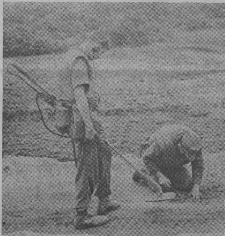
EASY DOES IT —Marine engineers probe for Viet Cong mines on Highway 1, the longest convoy route in Vietnam.