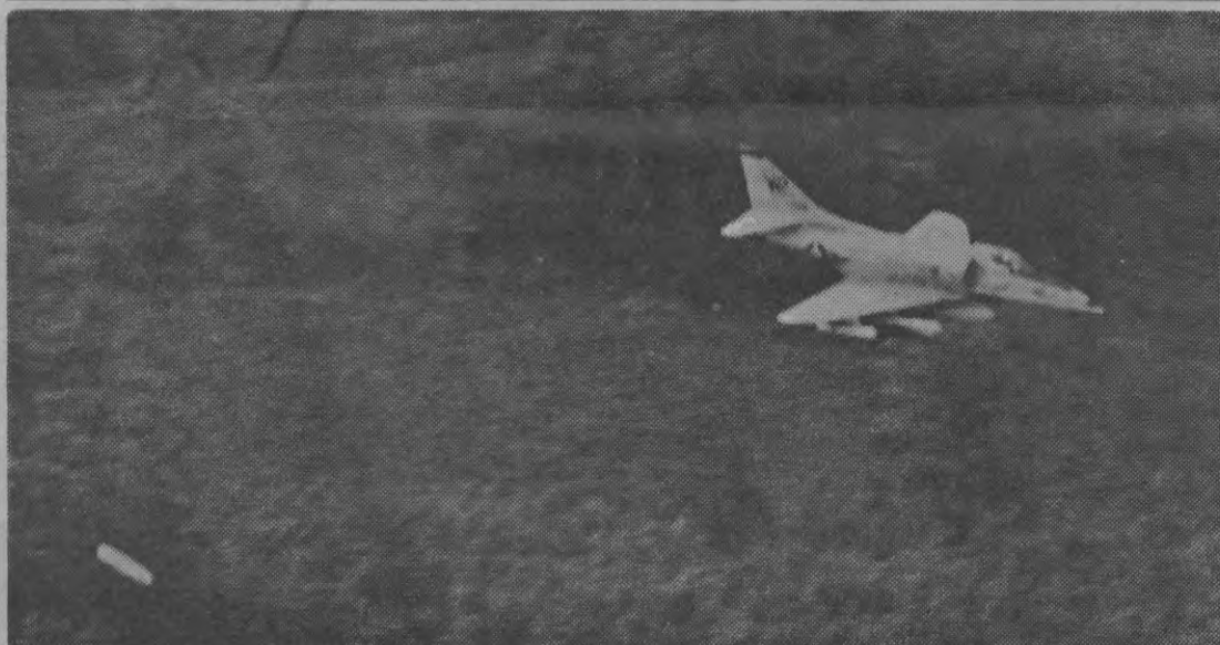
AIR SUPPORT —An A-4E Skyhawk attack jet drops its ordnance on a North Vietnamese Army position near Khe Sanh. First Marine Aircraft Wing fighter and attack jets and supporting artillery accounted for 75 per cent of the nearly 600 confirmed enemy kills during recent action of Hills 861, and 881 North and South.

All things considered, the 3rd Division exchange system is a big business.