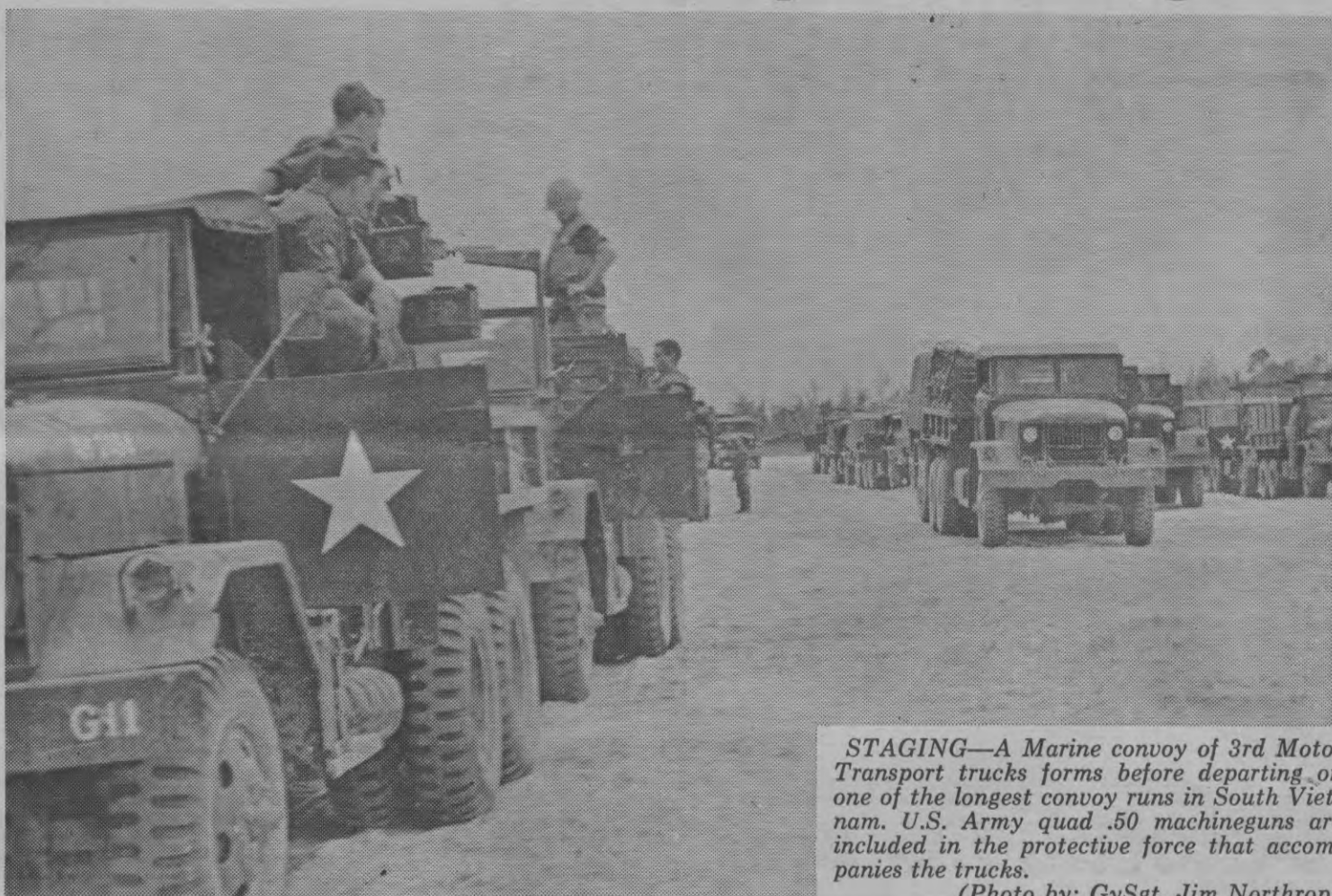
STAGING —A Marine convoy of 3rd Motor Transport trucks forms before departing on one of the longest convoy runs in South Vietnam. U.S. Army quad .50 machineguns are included in the protective force that accompanies the trucks.

Following the mine truck in a jeep, the convoy commander led a U.S. Army 2½-ton truck carrying bed-mounted quad .50 cal. machineguns, crew-served