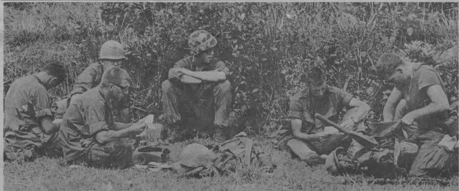
TAKE TEN —Weary Leathernecks of the Fifth Marine Regiment, 1st Marine Division read mail from home during a rest on Operation Union.