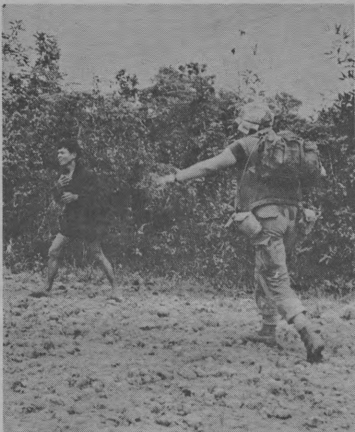
CONG CORNERED — A Viet Cong is flushed from a hedgerow by a Leatherneck of "E" Co., 2nd Bn., First Marine Regiment, 1st Marine Division.