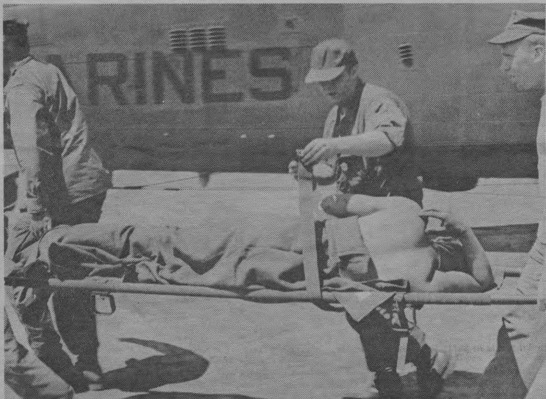
HELPING HAND —Marines and Air Force personnel helped Navy hospital corpsmen evacuate wounded Marines at the Khe Sanh airstrip. The wounded were medevaced to rear area hospitals during the battle for Hills 881 South and 812 North.

At midday, as several Huey gunships continued to hit the hill with rockets and machinegun fire, another Huey landed beside the Marines and extracted them.