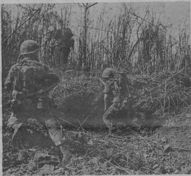
ASSAULT—Marines of "G" Co., 2d Bn., Third Marines, assault Hill 881 N. during battle near Khe Sanh.