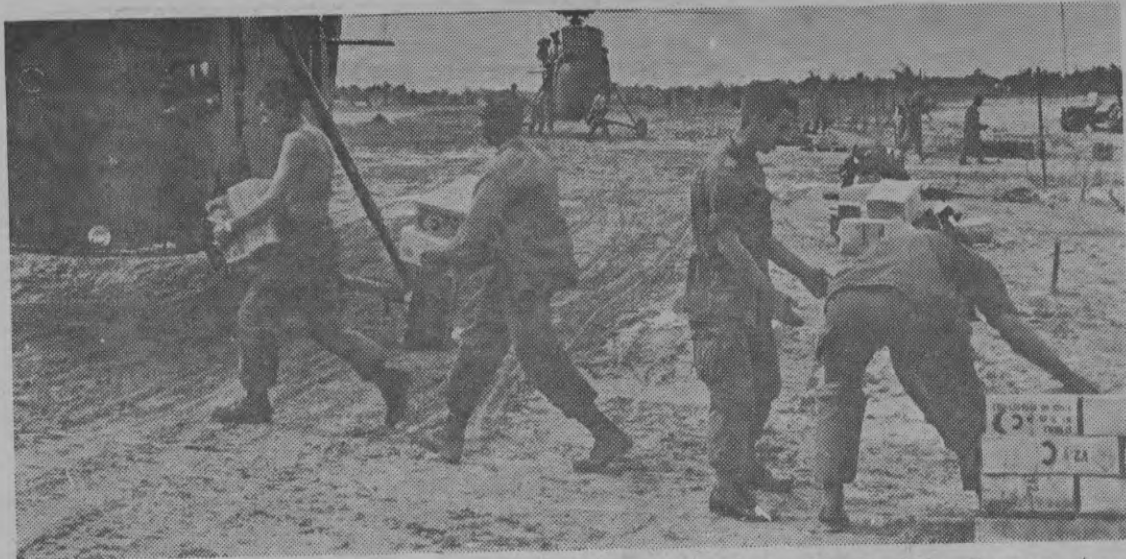
LOADING CHOW —Members of Force Logistics Support Group-B's Logistics Support Area (LSA) at Quang Ngai, operating in support of the 1st Marine Division, rush cases of rations to a waiting helicopter for resupply to field units.