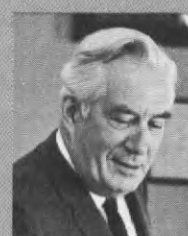
Chief Justice Warren E. Burger