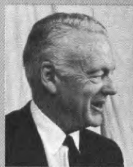
Robert M. Hutchins

Some of the contributors to The Establishment and All That