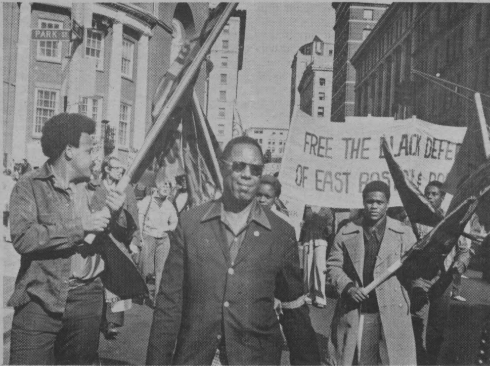
Over 300 people, including C.U.L.A., said an emphatic no to racism in Boston in support of the East Boston, Dorchester and Hyde Park defendants.

The popular appeal of the campaign and the massive support in the communities and at several rallies has shown hundreds of people that through a united fight, the rich corporations and their government stooges can not only be challenged, but can be forced on the defensive, and that the people will win.