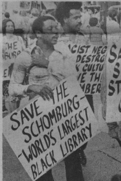
Members of the Citizens Committee to Save the Schomburg held a militant picketline outside the 42nd St. library in midtown Manhattan in September.

On Friday, November 5th, the Coalition will hold their next meeting at the Harlem branch of the Y.M.C.A., 180 West 135th Street, at which time additional plans for saving the Schomburg will be announced. Plans for additional rallies and demonstrations will be discussed. The meeting will begin at 7:00 P.M.