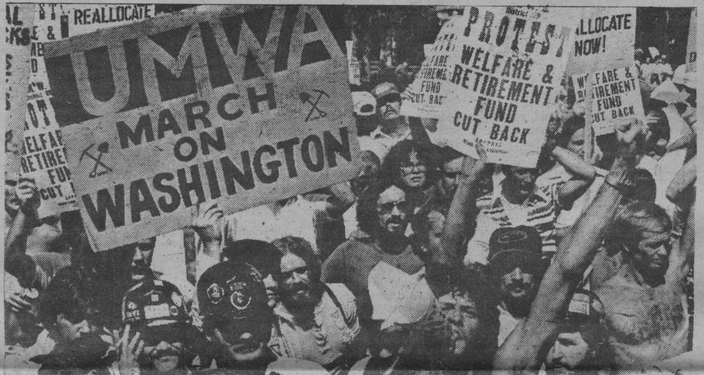
On August 5, in Washington, D.C., 1,000 striking miners protested the drastic cuts in their medical benefits.