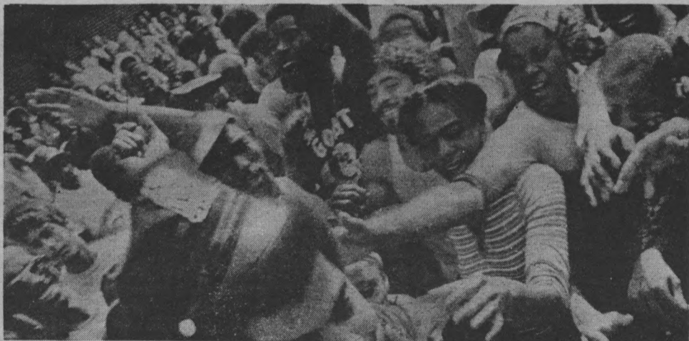
Latest government figures show 86% of all Black and Latin teenagers are without jobs. Here, 12,000 N.Y.C. youth apply for 2,000 Emergency jobs.

While Carter is spending so much time and effort forcing the poorest people to take jobs at the lowest pay, he isn't saying anything, or doing anything, about the real welfare fraud, the welfare for the rich, the ones who pay little or no taxes on millions of dollars of income, who receive millions of dollars more for not