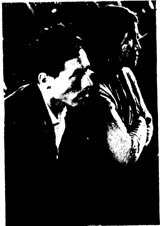
STRATEGY OF U.P.

The stagnating effects of this structure are shown by the impoverishment of the agrarian population -- 43% were undernourished, 85% of families lived in sub-standard housing (only 3.8% of housing has running water, and less than 20% have electricity). Infant mortality was one of the highest in the Western Hemisphere, with 120 of each 1,000 babies dying before their second birthday. Among the Mapuche Indians, who represent 1/4 of the rural population, infant mortality reaches 60% in the first year of life. Thus, it was obvious that the necessity for agrarian reform was paramount.