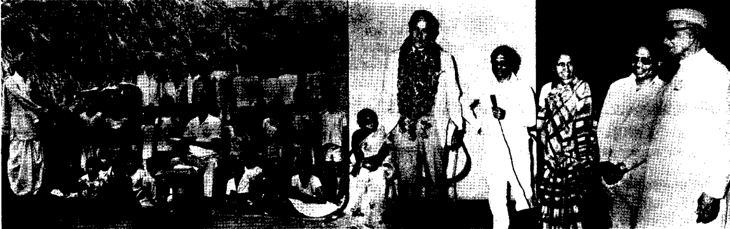
The children in the Prathipadu Home with their superintendent.

"Bear ye one another's burdens and so fulfill the law of Christ."