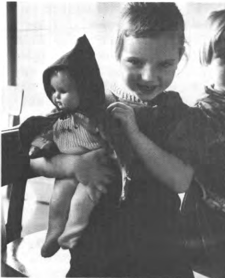
A Christmas gift from IRC brings joy to a Cuban refugee child in Spain.