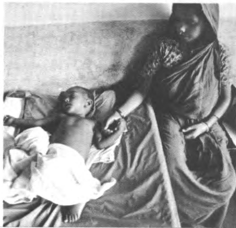
This Bengali baby is well now—after treatment at an IRC clinic.