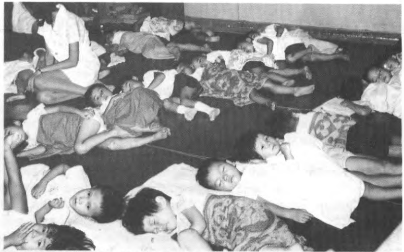
Wall-to-wall children—an afternoon nap at an IRC refugee nursery in Hong Kong.