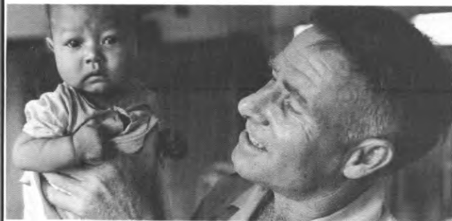
A Vietnamese war orphan is comforted by the IRC Director in Saigon.