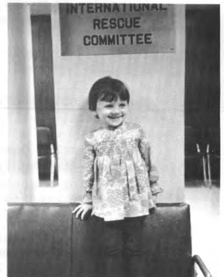
A refugee girl from Russia smiles happily at IRC headquarters in New York.