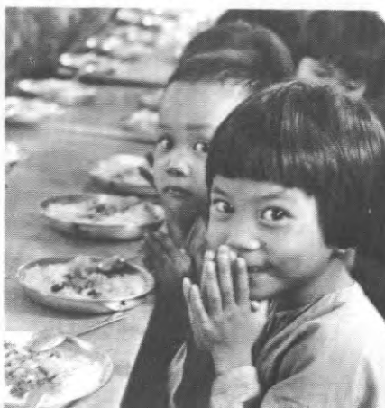
Lunchtime is a joyous event at an IRC refugee children's center in Vietnam.

Your tax-deductible donation to the International Rescue Committee will do a lifetime of good for a refugee child.