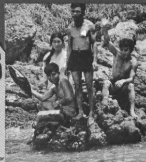
These four young "freedom-swimmers" from Mainland China who swam 10 hours through treacherous waters are among the thousands of Chinese refugees helped by IRC in Hong Kong.

Their bodies were found floating in the sea, or washed up on the shores of remote islands. Many were found along the coast of Hong Kong.