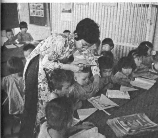
Pre-school educational activities play an important part in the daily schedule at IRC's day-care centers for Vietnamese children.