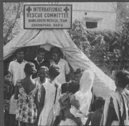
In the new nation of Bangladesh, IRC clinics provide medical care for the uprooted victims of the recent invasion by West Pakistani troops.