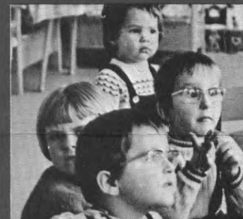
IRC finds asylum in the free world for thousands of refugees fleeing from East Europe, among them many children.