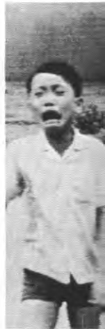
The destination line of refugees is a primitive camp packed with thousands of Vietnamese civilians whose homes have been destroyed.

In Binh Duong Province, where destruction has been massive, thousands of Vietnamese children are among the homeless refugees. Here, IRC supports a children's center where food, clothing, schooling and medical care restore the health of refugee boys and girls and turn their tears into smiles. IRC maintains several day-care centers in Vietnam for war victims, many of them orphans.