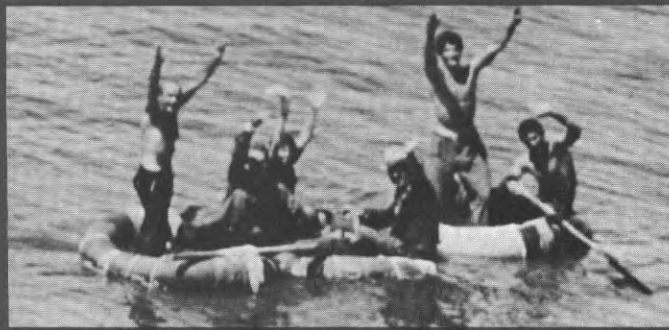
Many refugees are risking their lives to escape from Cuba to the free world in small rafts and boats.