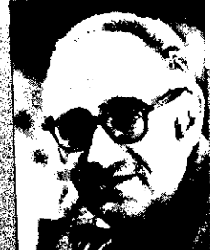
Murray N. Rothbard