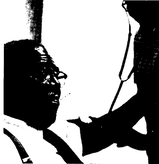
A full range of medical services are provided by the community medical program, shown above. In addition, many of the region's poor are receiving professional dental care for the first time (below).